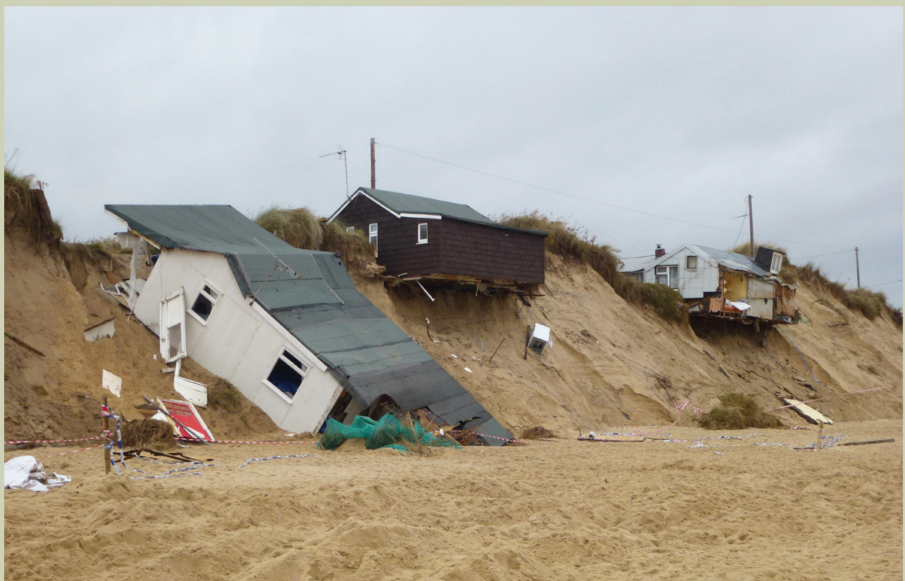
Figure 5. Coastal erosion and loss of dwellings, Hemsby, Norfolk, UK in 2013.

War, corruption, and weak institutions work against the delivery of sustainable development and the UN’s SDGs. Therefore, SDG16 stresses the importance of delivering peace, justice, and strong institutions without underestimating the problems in achieving them, as recent events in Afghanistan and elsewhere