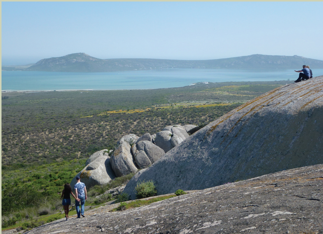
Figure 3. A landscape in the West Coast National Park, South Africa.

Geoscience can contribute to improving healthy environments, such as by understanding the origins and movement of pollutants through the environment. In addition, WHO (2021) has recently promoted the benefits of being out in nature. For example, increased contact with nature has been associated with lowering cortisol, blood pressure, and the risk of developing type 2 diabetes. Nature provides opportunities for stress reduction, physical exercise, and a physically active lifestyle; for restoration and relaxation; and for socializing with friends and family. Access to nature increases life satisfaction and happiness ratings (WHO 2021). Although frequently only green spaces or biodiversity are mentioned in connection with natural health benefits, they often come from access to diverse physical landscapes (Figure 3) or the physical exercise involved in hiking, hill walking, or rock climbing. There is increasing use of mobile geology and geoheritage apps and other new technologies that