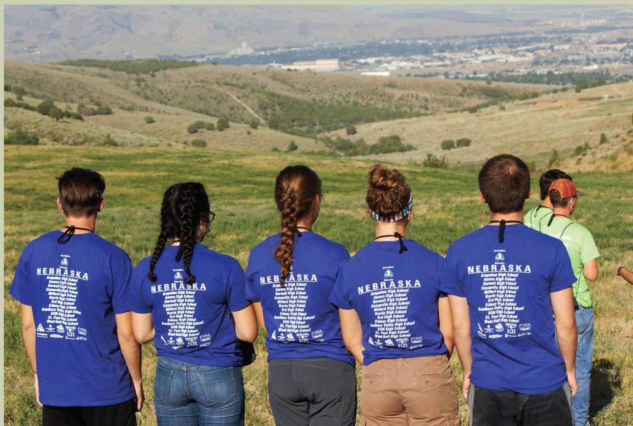
An Envirothon student team ready to engage in place-based learning.

which winning teams from participating US states and Canadian provinces compete for recognition and scholarships by demonstrating their knowledge of environmental science and natural resource management. The program has a strong outdoor component, and is sponsored by the US Forest Service, the US Natural Resources Conservation Service, and others. Much of the field education and field competitions are held in areas protected for their geoh heritage and biodiversity values, and this use of geoh heritage as a gateway to the broader educational goals is central to the program. The Envirothon's emphasis on both project-based and place-based learning make it a perfect fit for enhancing natural science education in China. By broadening the influence of the Envirothon program and its underlying conservation goals in China, this work provides a platform for project-based learning opportunities and field-based experiences as well as to foster international collaboration.