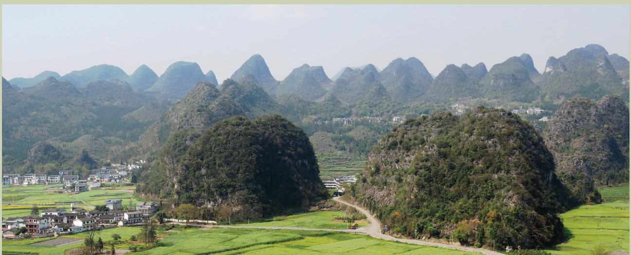
Wan Fenglin in Xingyi Geopark, Guizhou, China: an example of spectacular fenglin-type karst.

The fact that many protected areas, including those recognized by UNESCO, contain carbonate karst should mean that their karst geoheritage is acknowledged and protected. However, within these pro-