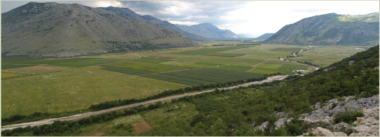
Popovo polje in Bosnia-Herzegovina is around 40km long and up to 5km wide. The Trebinjica River, now canalized, flows along its floor. Under natural conditions there were over 500 sinks ( ponors) and reversing springs ( estavelle).