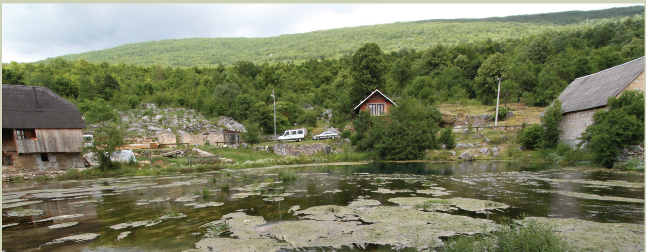
Majerovo Vrilo, Croatia: A large vauculian spring explored by cave divers to a depth of 92m below the point of emergence.