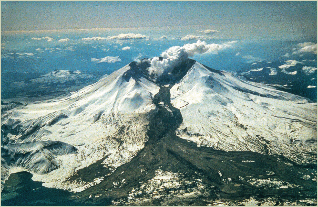
Mount St. Helens in 1982, showing the active volcano, a new lahar, and Spirit Lake (lower left).

multi-criteria decision-making approach was specified (NASEM 2018). In 2019, USFS commissioned the William D. Ruckelshaus Center of the University of Washington and Washington State University to develop a report titled Situation Assessment for the Long-Term Management of the Spirit Lake/Toutle–Cowlitz River System (Ruckelshaus Center 2019). The purpose was to engage a broad spectrum of stakeholders in order to identify and clarify key issues to be considered within a multi-criteria decision-making framework.