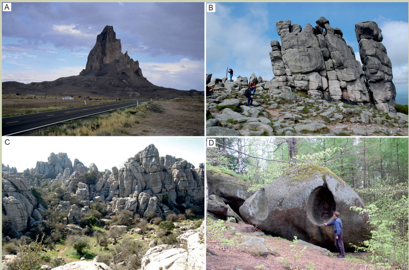
Figure 1. Diversity of rock landforms: A—solitary hill ( inselberg ) built of very resistant volcanic rock (Agathla Peak, Arizona, USA), B—granite tor (Karkonosze Mountains, Poland), C—rock city (El Torcal, Spain), D—granite boulder with weathering pit as an example of surface weathering microform (Jizerské hory, Czechia). PIOTR MIGOŃ

rock is rarely exposed at the earth surface. It is typically concealed by a layer of in situ weathering products, known as regolith (which may also include sediment coming from elsewhere), which in its uppermost part supports soil. Nevertheless, the regolith mantle is not everywhere continuous, and solid bedrock may protrude through, forming natural outcrops of different sizes and shapes (Figure 1). These may be inconspicuous, low, shield-like elevations and platforms, but they may also be impressive hills or mountains hundreds of meters high, weirdly shaped smaller elements resembling ruined buildings, or rock cliffs along valley sides, within the slopes of mountains, and along the shores of water bodies (Gerrard 1986). Some are described in geomorphological vocabulary under specific names. Thus, bedrock hills rising sharply from an otherwise flat, regolith-supported surface are known as inselbergs (literally “island hills”—the term is derived from German), whereas smaller outcrops,