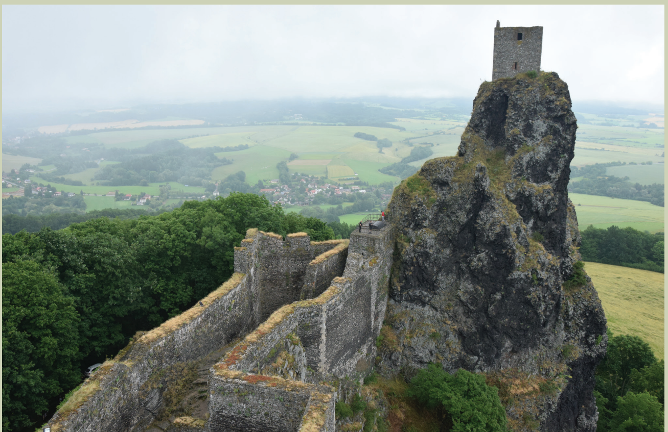
Figure 3 (above). Inselberg massifs, especially in arid and semi-arid areas, are typically characterized by higher biodiversity than their surroundings (Pedra da Boca, Brazil). PIOTR MIGOŃ