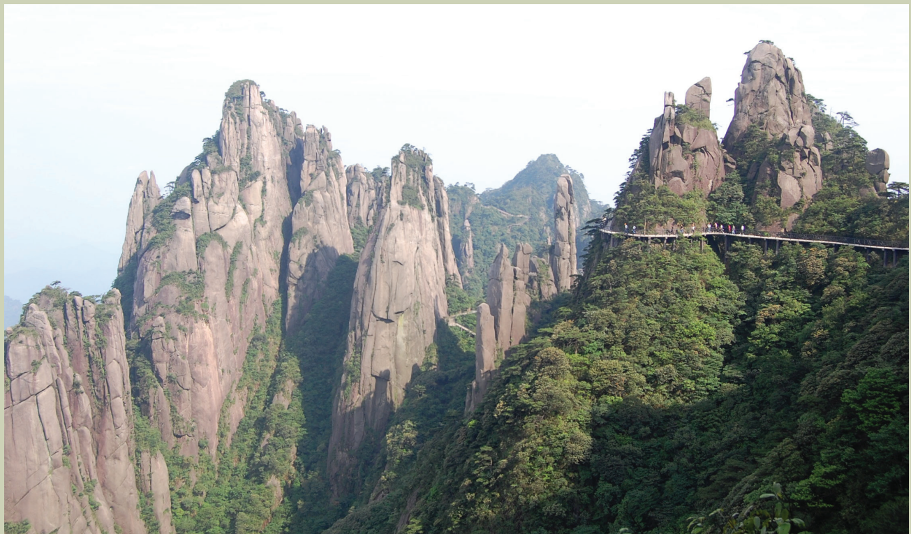
Figure 5. The granite massif of Sanqingshan (China) has been a UNESCO World Heritage Site since 2007. PIOTR MIGOŃ

Despite apparent durability, rock landforms are not impervious to change, and their values can be compromised. The catalogue of threats to their integrity and the challenges that conservation faces is quite varied (Table 1). First and foremost, physical damage to the site may occur. The most devastating of all is stone quarrying, which may lead to the complete disappearance of an outcrop. For example, in the 19th century several granite tors and huge boulders in several Central European lands fell victim to quarrying, including Waldviertel in Austria and Lausitz and Erzgebirge in Germany. In the Stołowe Mountains tableland in southwestern Poland, large residual sandstone boulders, which constituted a unique legacy of hillslope processes and plateau degradation, were ubiquitously used as a convenient source of building material. Less evident alterations were associated with trail engineering, aimed at increasing accessibility of rock