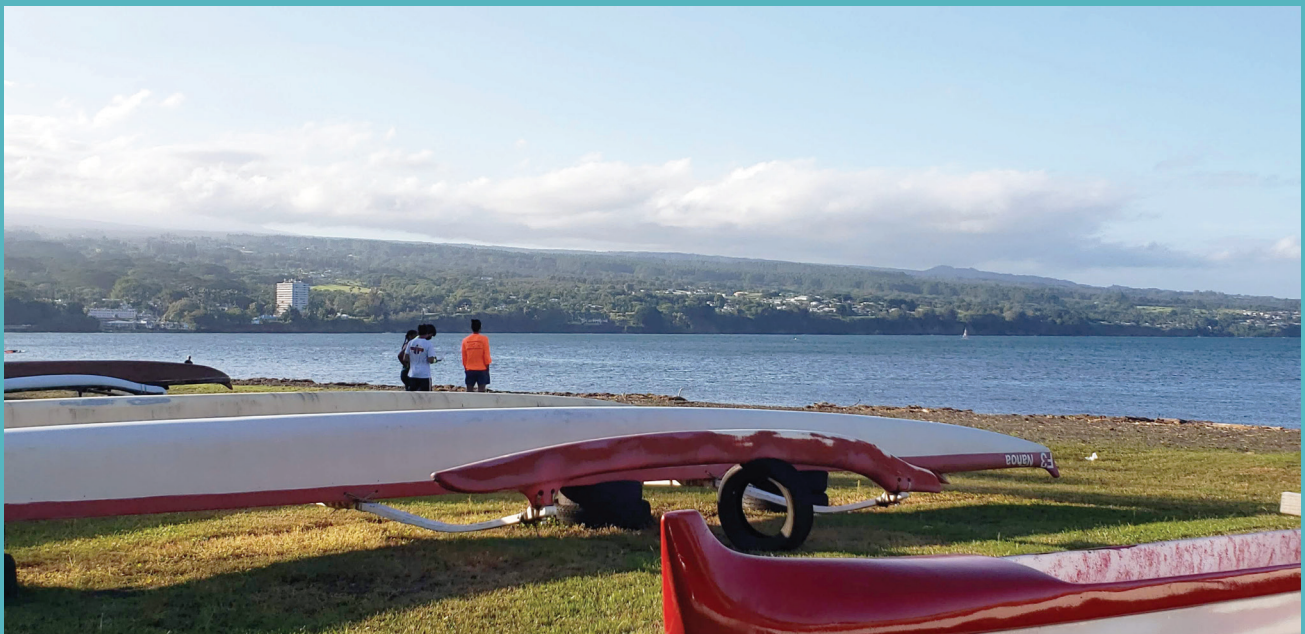
▲ Students teach visiting Kumu about their Nā Kilo ‘Āina practices.

The (HVP) was developed by the Nā Wa‘a Mauō Marine Stewardship Program to support Kānaka ‘Ōiwi high school students through wa‘a from the under-represented communities of East Hawai‘i Island. HVP provides pathways for Kānaka ‘Ōiwi youths to strengthen their Indigenous self-identity, perpetuate the practices of our Kūpuna (ancestors), and prepare themselves for adulthood. To advance Indigenous sovereignty, self-determination, and sustainability the HVP has made a generational commitment to Kānaka ‘Ōiwi youth by hosting six student cohorts over ten years. This long-term commitment aims to foster a generational change in ocean stewardship by revitalizing the identity of wa‘a as vehicles to care for our ocean and sustain our island communities and by helping to raise the next generation of marine