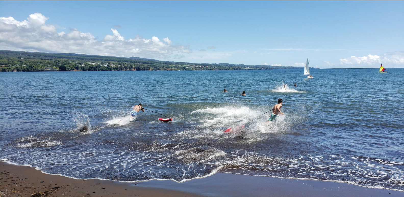
▲ Ocean rescue training (top left; bottom); CPR and First Aid training (top right) HŌKŪ PIHANA

and begin using our NWM methods to learn about our ocean environment. Our NWM methods exemplify that ocean research and monitoring can be done in a more holistic and less invasive way, one that is rooted in Native Hawaiian science and practice.