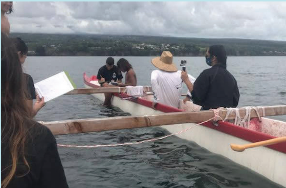
▲ Students collect water properties and environmental observations data in the wa‘a.

Mālama ‘āina , our kilo and time spent with place, evokes our desire to care for and give back to the place that has given to us. Tending to our oceans and ‘āina contributes to the health and wellness of ourselves and the environment. This reciprocal action strengthens the relationship between kānaka and ‘āina and awakens the desire to steward that space.