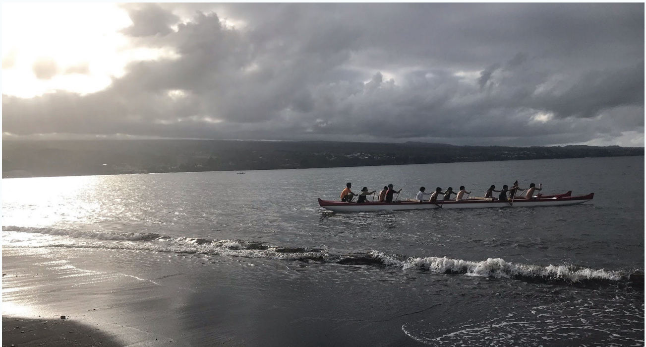
▲ Nā Wa'a Mauō students open each practice by strengthening their paddling timing and technique skills.

our communities and planet. For us to support justice and equality for people, we must ground ourselves in our Indigenous identity as Native peoples, share our practices with our families and communities, and work together to sustain 'āina mauō. Through these pathways, Nā Wa'a Mauō and the Honuiaiākea Voyaging Program will evoke justice and equality for our indigenous practices, people, and places.