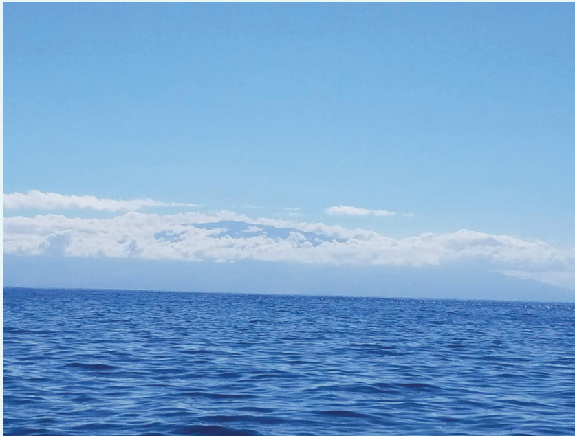
▲ Moku o Keawe view from the wa'a as we paddled around Lanai back to Maui.

‘Āina mauō , environmental and cultural sustainability obtained from the reciprocity between the ‘āina and the kia’i (protectors/stewards). The ultimate goal is to reach a state of ‘āina mauō, the land that sustains us. Through our practices of kilo ‘āina, mālama ‘āina, and ‘āina momona we move towards ‘āina mauō. Our relationships build our stewardship which strengthens the health and wellness of our people and island and guides us to a state of āin mauō.