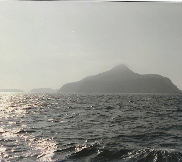
▲ Dolphins off the Channel Islands.

coastline, because most people lived and traded by the ocean. It was a thriving, advanced, complex society built around art, trade, crafts, and community.