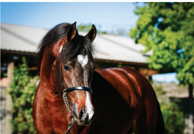
EVIE TUBBS SWEENEY