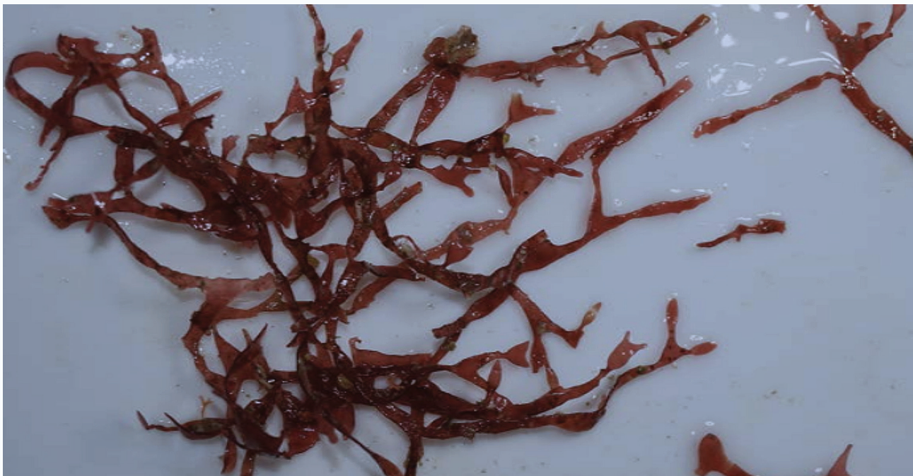
▲ Hānau ka limu Nu‘ahilihili, noho i kai!