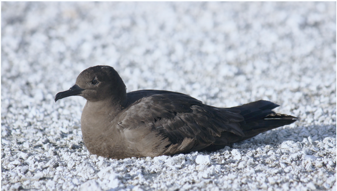
▲ Hānau ka Ao‘ū, lele!