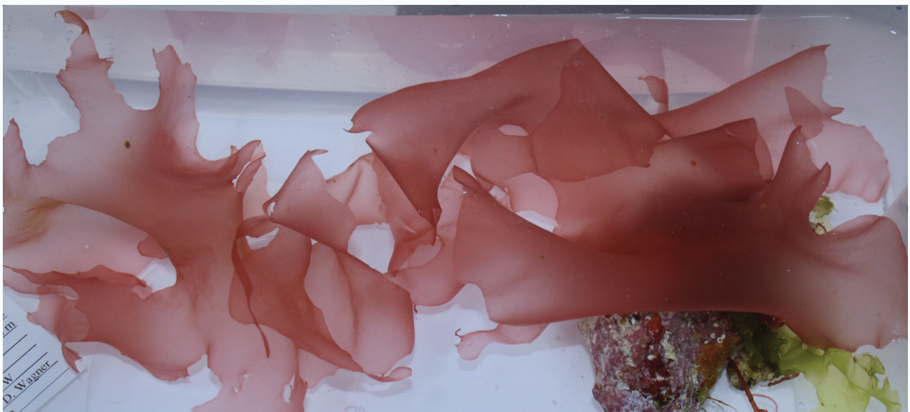
▼ Hānau ka limu Kalaukapu, noho i kai!