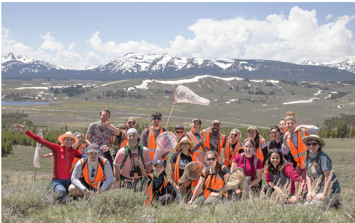
FIGURE 3. RMSSN field crews pose for a picture after finishing up their pollinator study in Yellowstone National Park. CARRIE LEDERER

conducted 75 days post-experience exploring key elements of place attachment and stewardship motivations that were impactful for those involved.