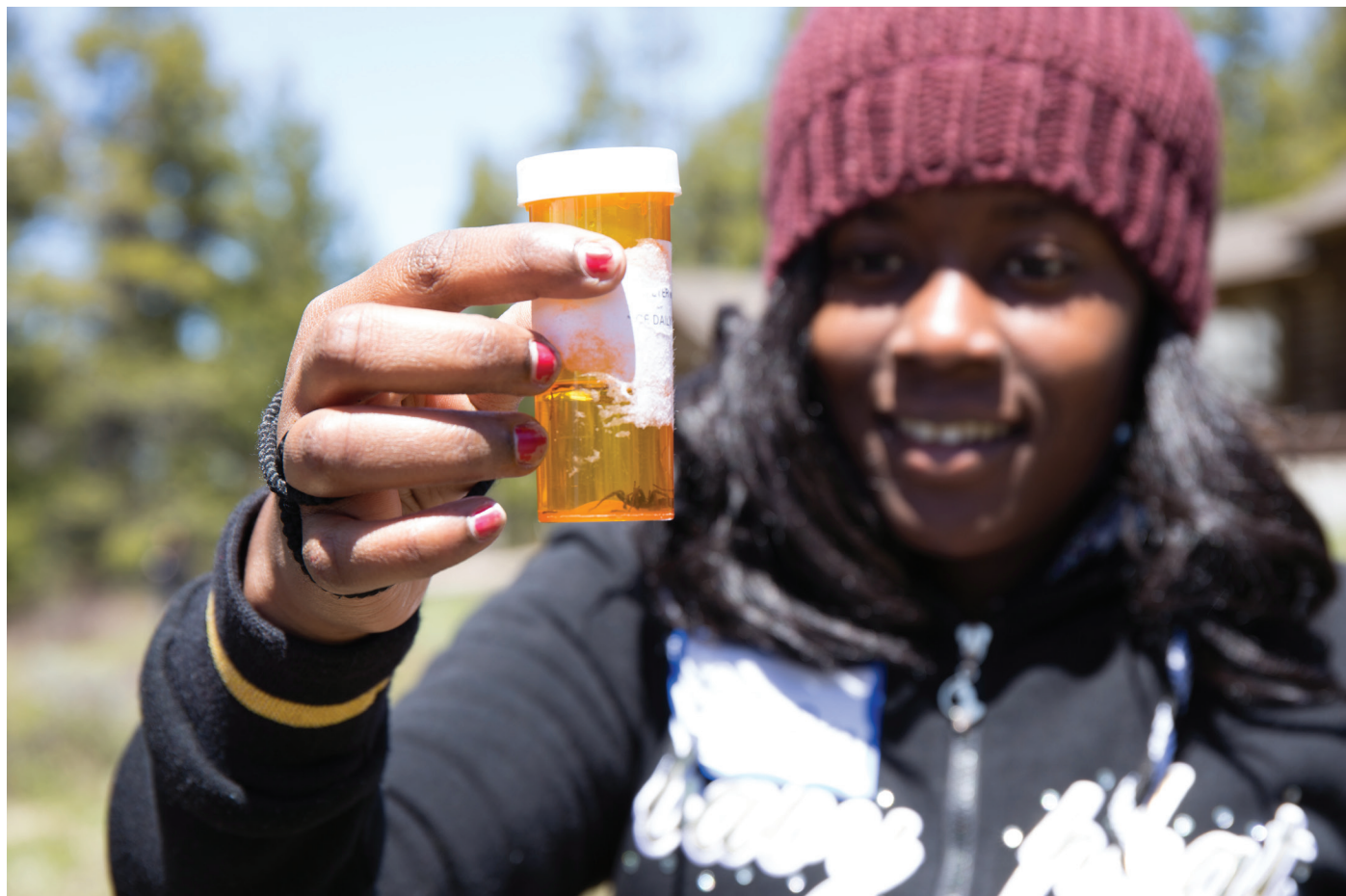
FIGURE 2. An RMSSN student participates in an arachnid survey in Grand Teton National Park. CARRIE LEDERER

Qualitative and quantitative assessments of the 2018 and 2019 RMSSN cohorts considered how the experience of participating in citizen science research on public lands impacted place attachment, advocacy, and stewardship motivations for participants. Students completed pre-post surveys throughout the effort. The surveys primarily employed two well-established instruments, the Motivations for Environmental Action (MEA) and the Place Attachment Inventory (PAI), which assessed the participant's impressions on a nine-point Likert scale. Quantitative surveys were followed up by focus group sessions in an effort to gain a deeper understanding of each participant's experience. Two separate hour-long sessions were