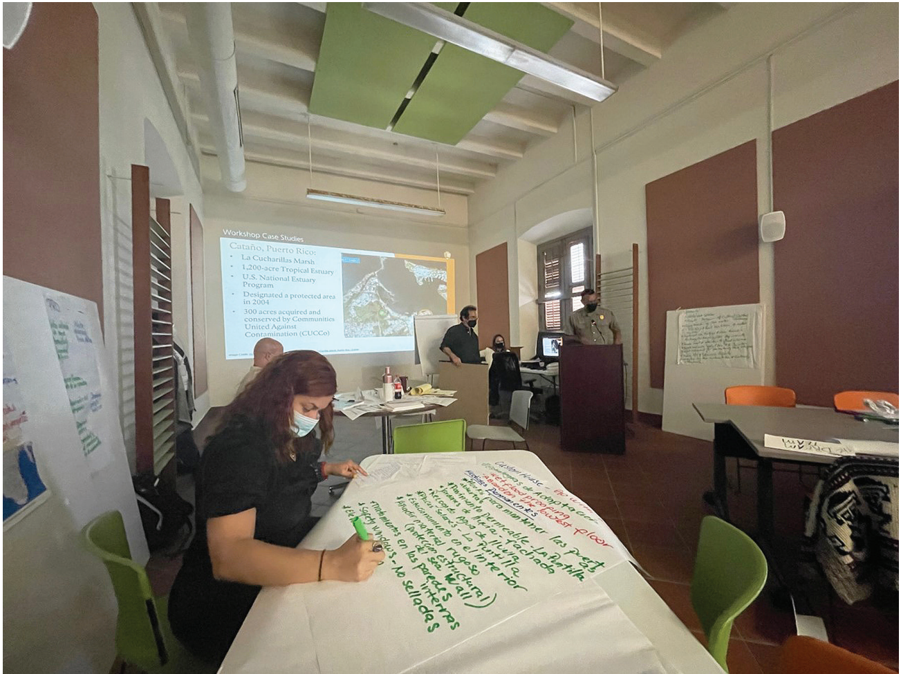
FIGURE 4. In June 2022, the Climate, Science, and Disaster Response Program collaborated with the Federal Emergency Management Agency, the National Endowment for the Arts, and the NPS National Center for Preservation Technology and Training to work with local partners in Puerto Rico to offer a workshop focused on the impacts of coastal hazards and adaptation of historic structures in San Juan.

actions. In developing the eight action areas, the team of two have worked collaboratively to propose a map for moving forward, and, by defining guiding principles, have characterized how CSDR intends to carry out these initiatives. A good plan is essential to a good product, but there is recognition that planning itself is insufficient to the task at hand. As described above, CSDR has only begun to implement attendant actions. The immediate intent is to learn rapidly, provide considered and scientifically sound recommendations, and develop and steward partnerships to maximum utility. As the team iterates and responds to climate and preservation science, emergent disasters, and lessons learned, we will continue to plan the work and work the plan.