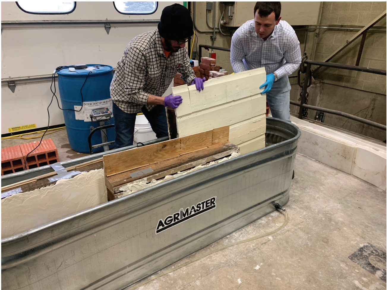
FIGURE 3. The Cultural Resources Partnerships and Science Directorate is collaborating with the US Army Corps of Engineers Engineer Research and Development Center to devise and implement a methodology for testing the flood resilience of historic building assemblies, materials, and finishes and substrates. NATIONAL PARK SERVICE

can officially designated as “flood damage resistant.” Given that they are not rated as flood damage resistant, historic materials are often replaced, rather than repaired (Eggleston et al. 2021).