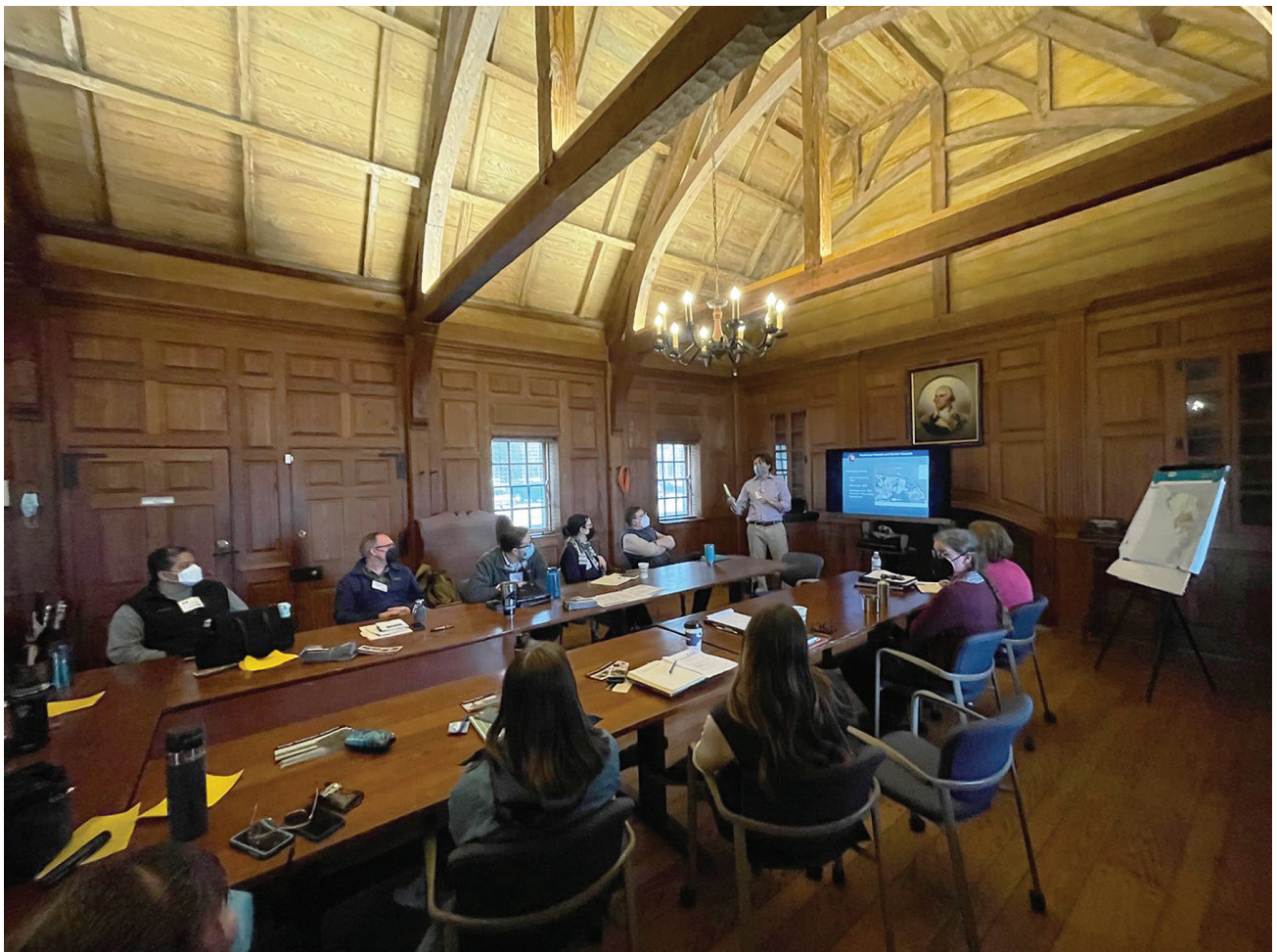
FIGURE 2. From March through July 2022, George Washington Birthplace National Monument collaborated with the Climate Change Response Program and University of Rhode Island to review the outcomes of the Western Carolina University park-level vulnerability assessment (exposure and sensitivity) and explore the adaptive capacity of natural and cultural resources and facilities and park assets.