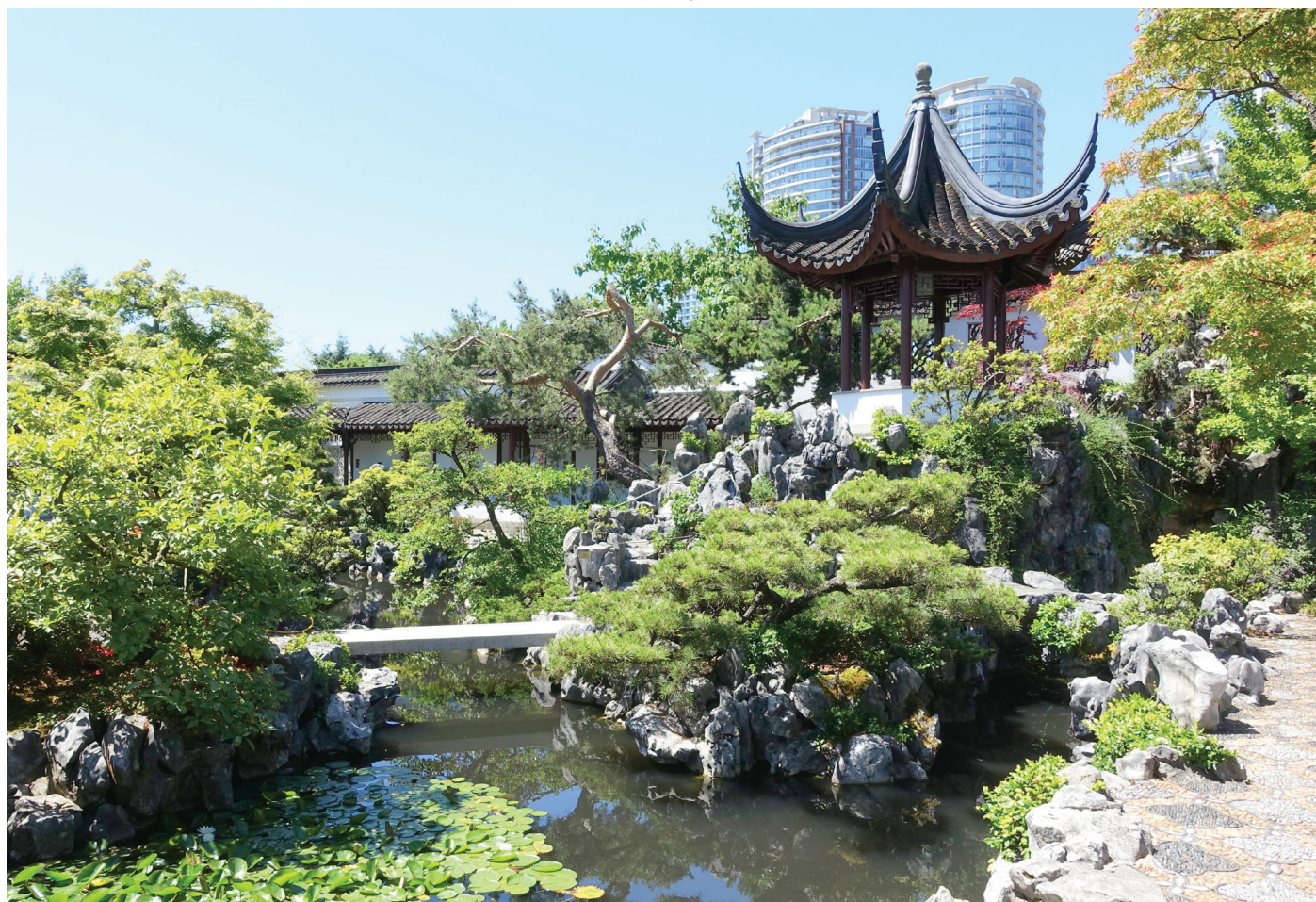
The Dr. Sun Yat-Sen Classical Chinese Garden and Park, in Vancouver, BC, is protected by designation.

Consistent with today’s more democratic ideologies, protection now often extends not only to exceptional places, such as the Empress Hotel and the Hollow Tree, but also to unremarkable, vernacular buildings, landscapes, and ensembles, called historic (or heritage)