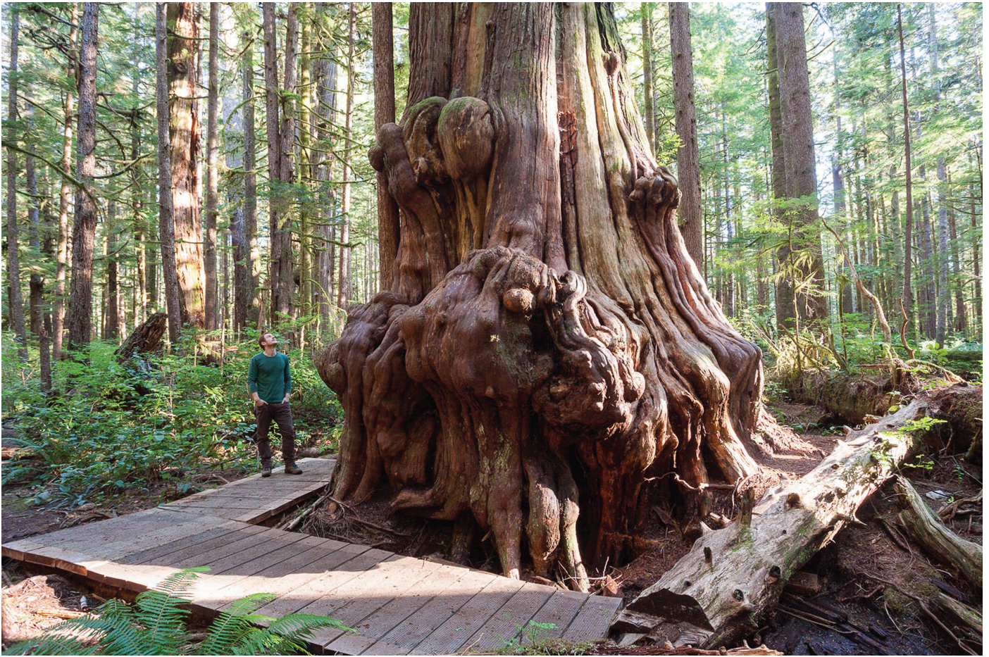
“Canada’s gnarliest tree,” in Avatar Grove, has been made more accessible to visitors with the construction of a cedar plank walkway by the Pacheedaht First Nation.