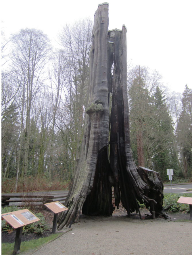
The millennium-old Hollow Tree in Stanley Park, Vancouver, has been stabilized and interpreted as an historic relic. Photographed in 2012.

districts (or areas). This is analogous to protecting forests as well as trees. Adjacent to the Empress and Victoria's Inner Harbour is "Old Town." Dozens of vernacular buildings dominate three areas: the old commercial core, a cluster of waterfront warehouses, and Chinatown. Old Town traces its origins to Victoria's role as the point of departure for prospectors heading to the Fraser River Gold Rush of 1858. Old Town has been designated a municipal historic area and its development commemorated as a National Historic Event. 55