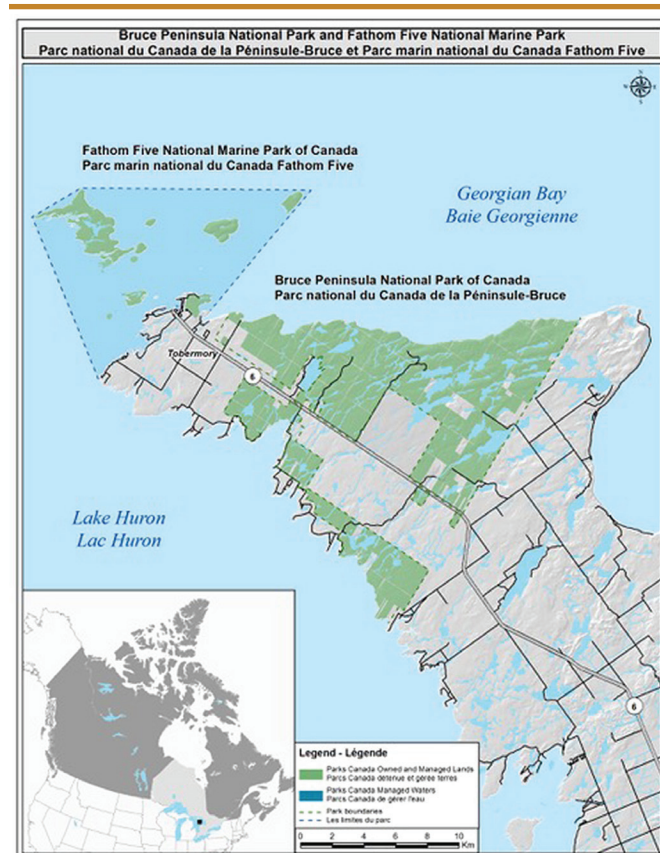
FIGURE 1. The location of Bruce Peninsula National Park and Fathom Five National Marine Park. Inset shows the location of the parks in relation to the rest of Canada. PARKS CANADA

This study includes BPNP and FFNMP (henceforth referred to as “the parks”) because they are administratively managed and operated together. However, they are managed under different legislation and accordingly have different goals. BPNP is managed in the “spirit” of the Canada National Parks Act (2000) because it is not yet officially included under the act and therefore operates under a complex mix of provincial and federal legislation (Parks Canada 2010a). The primary goal of management at BPNP is to maintain ecological integrity (Parks Canada 1998a). Likewise, FFNMP is managed in the “spirit” of the Canada National Marine Conservation Areas Act (2002) because it too is not yet scheduled officially included under the act. The primary goal of FFNMP is ecological sustainability through maintaining ecosystem structure and function (Parks Canada 1998b; Parks Canada 2010b).