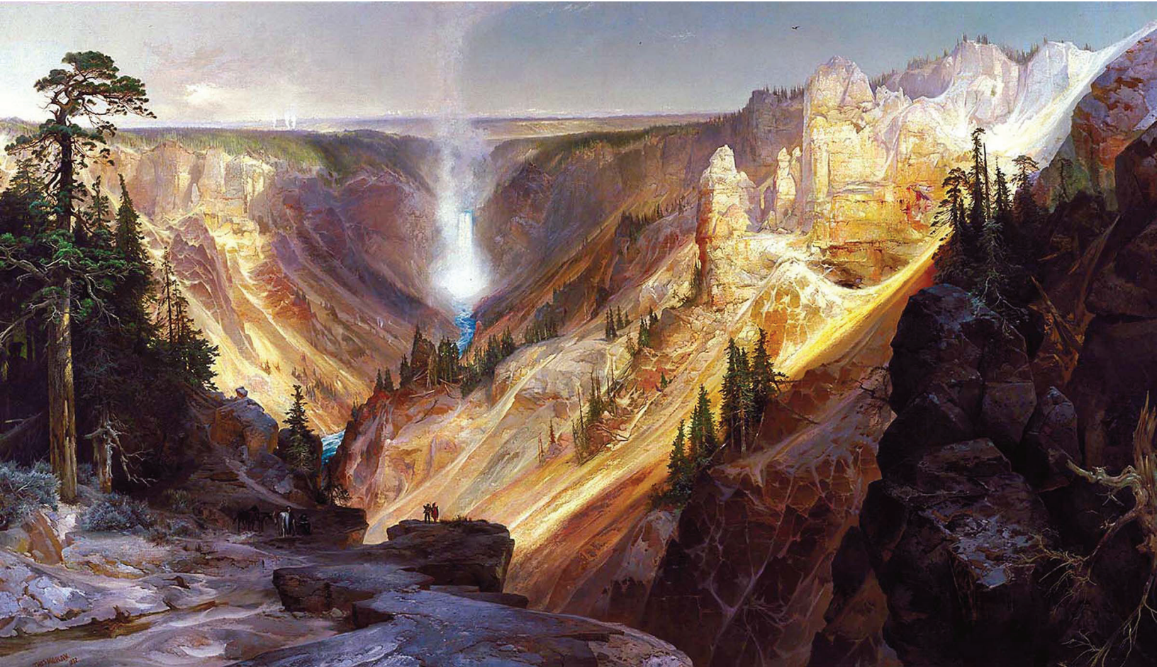
Thomas Moran, "Grand Canyon of the Yellowstone" (1872)

Yet in that very same year, 1872, Yellowstone, an area about three times the size of Rhode Island, was set aside as the world's first national park, and as a result there are now more than 6,000 national parks in almost 100 countries, and over 260,000 other protected places globally. Since then, over the course of a century and a half, about 17% of the world's land and 8% of its oceans have been protected, at least officially, for the use of other species. The figures for the United States are 13% of lands and inland waters and 19% of marine and coastal areas, a monumental achievement considering Columbia's path of annihilation.