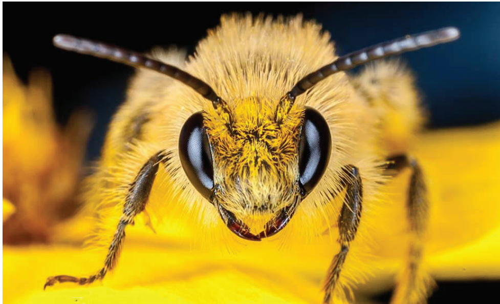
THE BEE CONSERVANCY