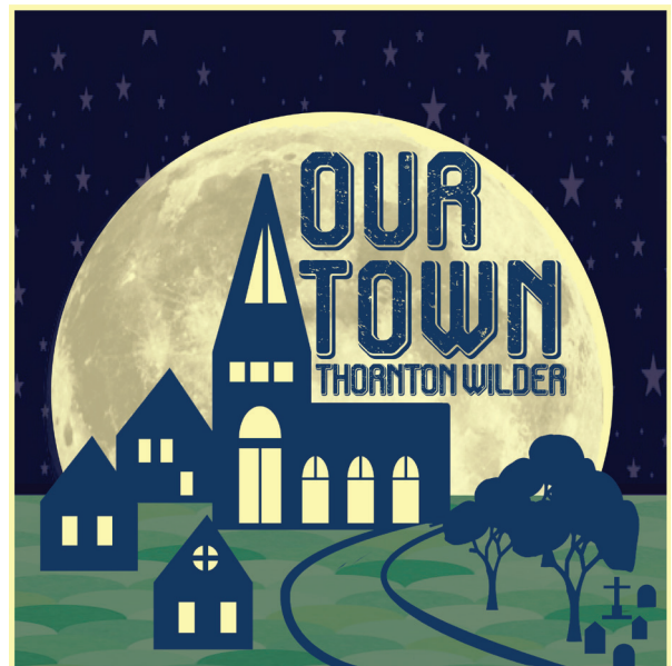
Poster for a Laconia, NH performance, November 19, 2021

The physical boundaries of towns and states, invented horizontal borders, are lengths and widths placed flat on earth, the thing we’re “on.” Such markers are easy to see as lines on maps; on the ground they require signs or border guards to be noticed as enforceable edges. In some ways these markers act like invisible corrals, pens, or pastures.