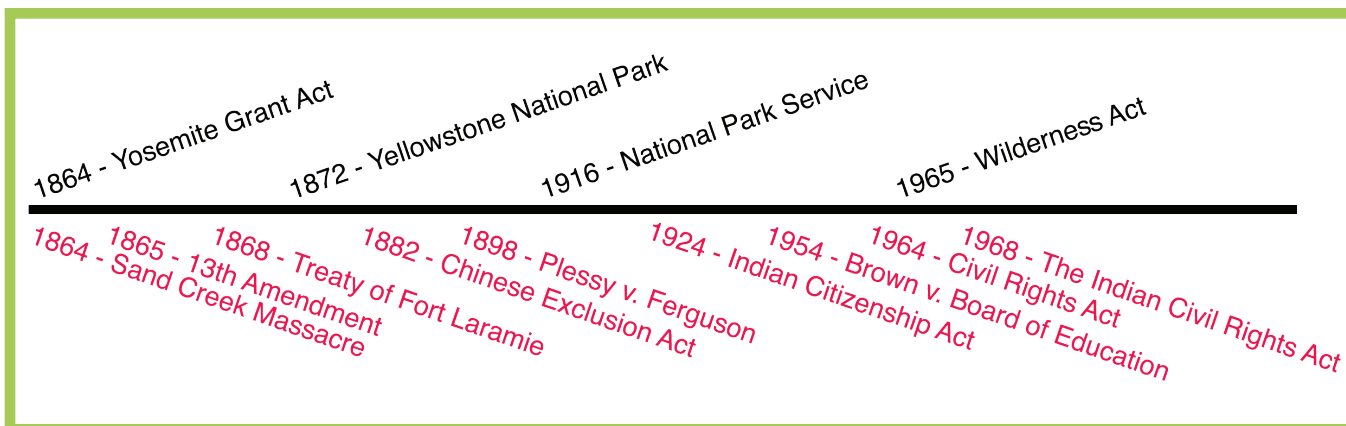
An abbreviated timeline comparing the United States protections of public lands and the denied access to public spaces for RMCs.

Over 150 years ago the United States began its commitment to setting aside land for future generations to enjoy, creating legislation that would dictate the use of these spaces, developing fields of study to better understand the value of these spaces, and establishing agencies charged with managing these lands. Meanwhile, enslaved people were