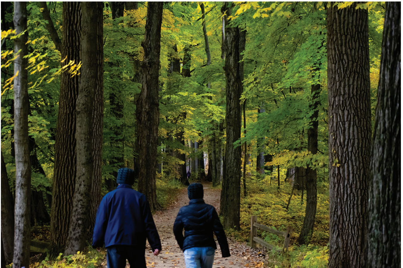
Into the woods and into the immersive colors of Fall! ▲ ▼ Brushwood Center at Ryerson Woods, Lake County, Illinois