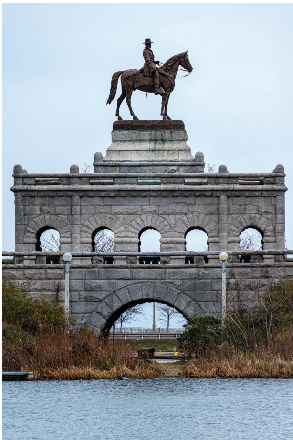
▲ Ulysses S. Grant Monument, Lincoln Park, Chicago, Illinois