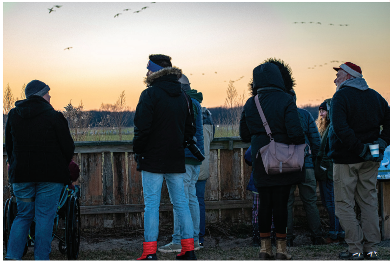
▲ Jasper-Pulaski Fish & Wildlife Area, Medaryville, Indiana