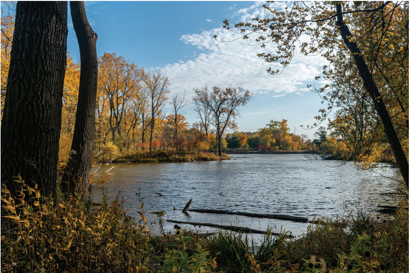
▲ West Ridge Nature Park, Chicago, Illinois