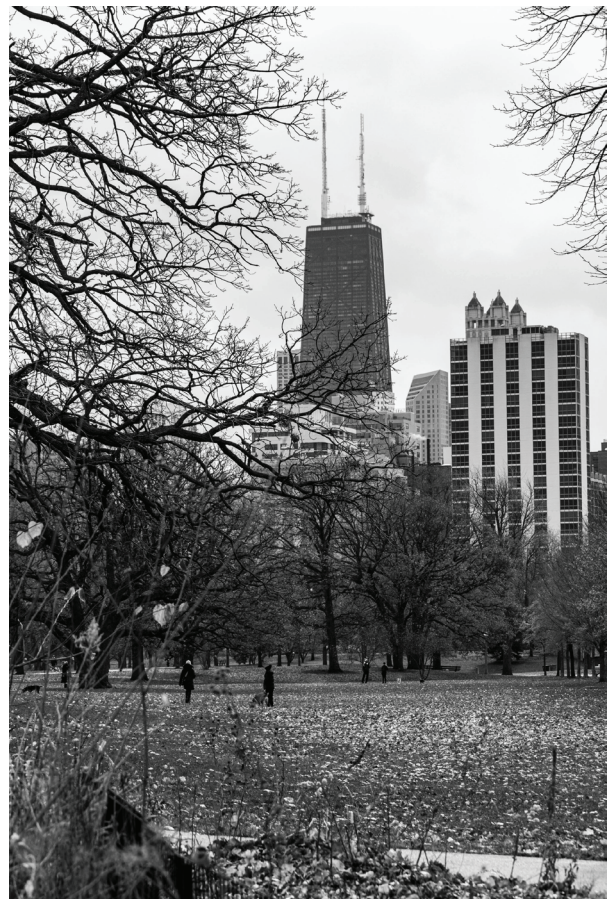
▲ Lincoln Park, Chicago, Illinois