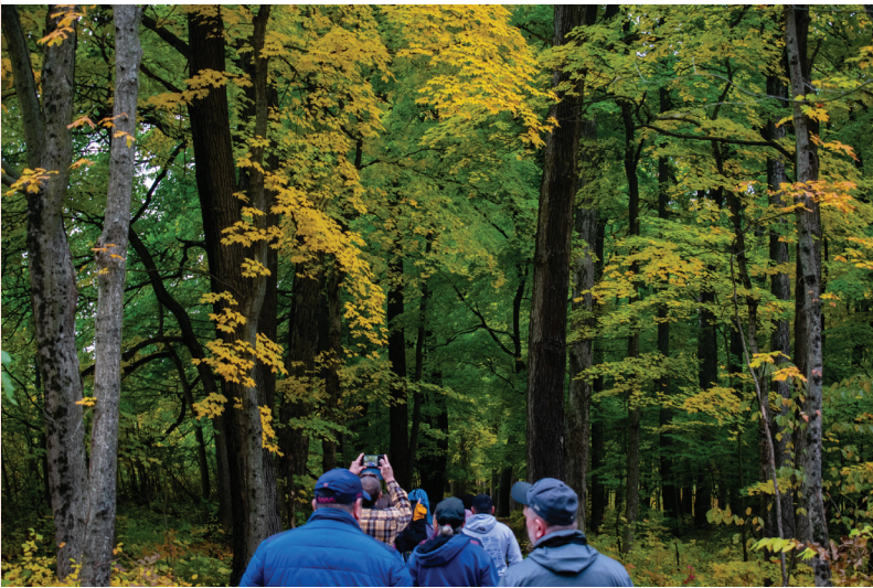
▲ Brushwood Center at Ryerson Woods, Lake County, Illinois