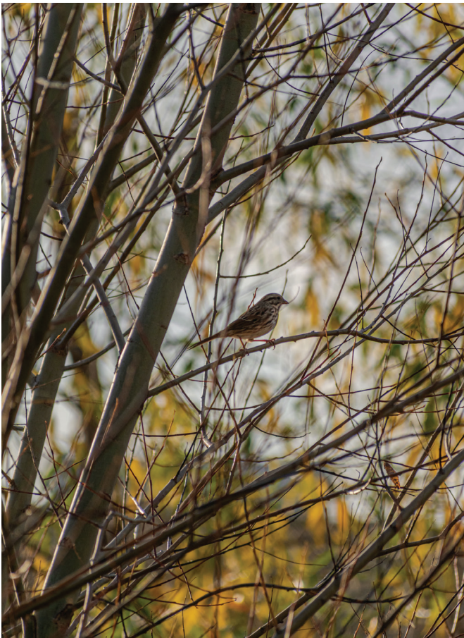
▲ West Ridge Nature Park, Chicago, Illinois