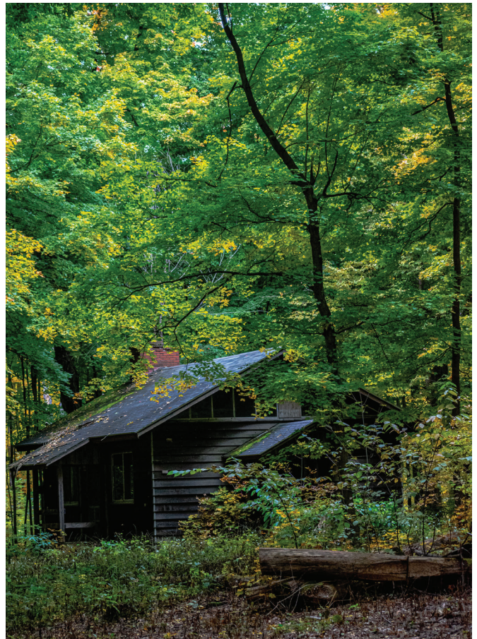
▲ Brushwood Center at Ryerson Woods, Lake County, Illinois