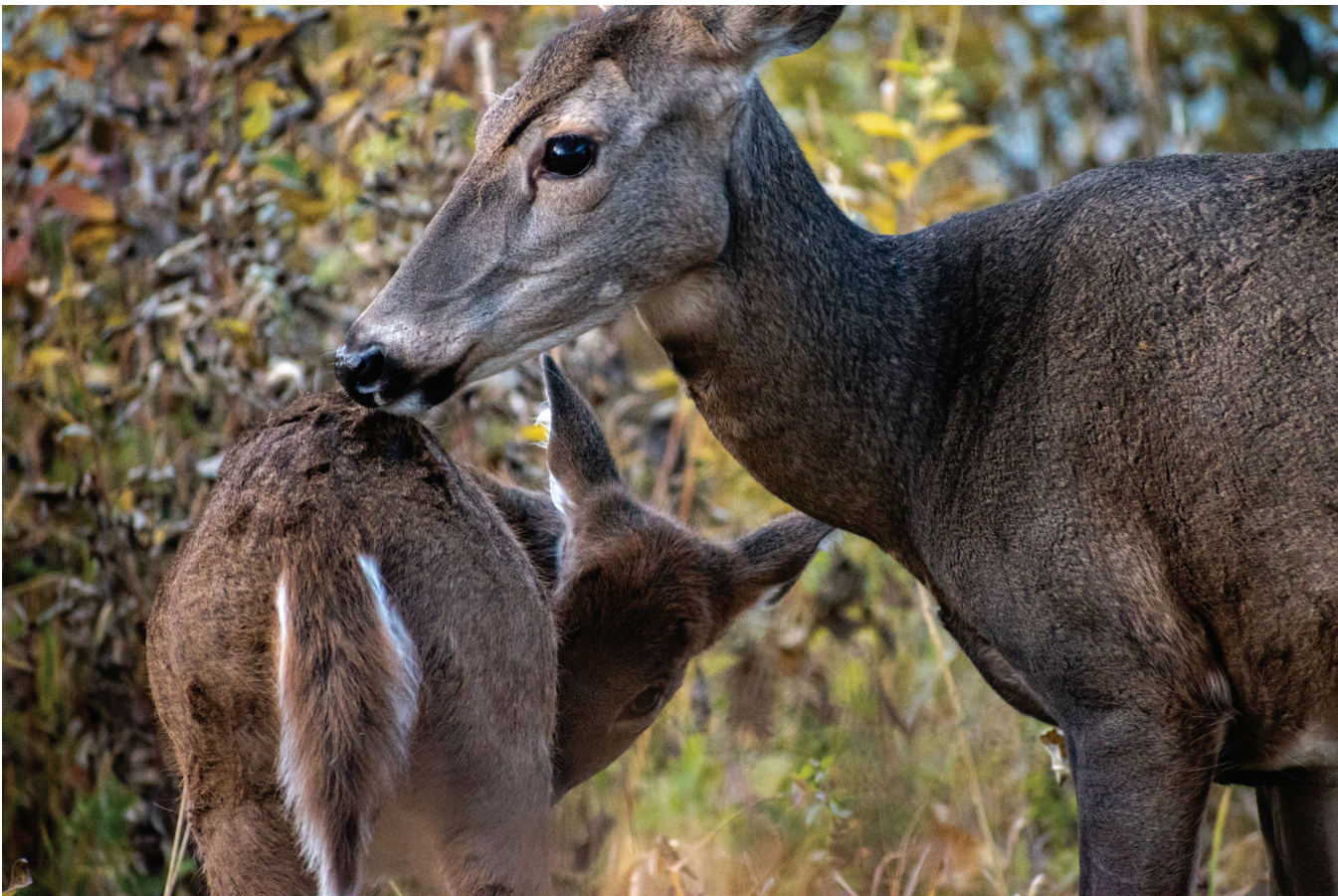
Remember that you are not alone. We are OUT there, in conservancy, in community, in health, and with you. ▲ West Ridge Nature Park, Chicago, Illinois ▼ Nature Boardwalk at Lincoln Park Zoo, Chicago, Illinois