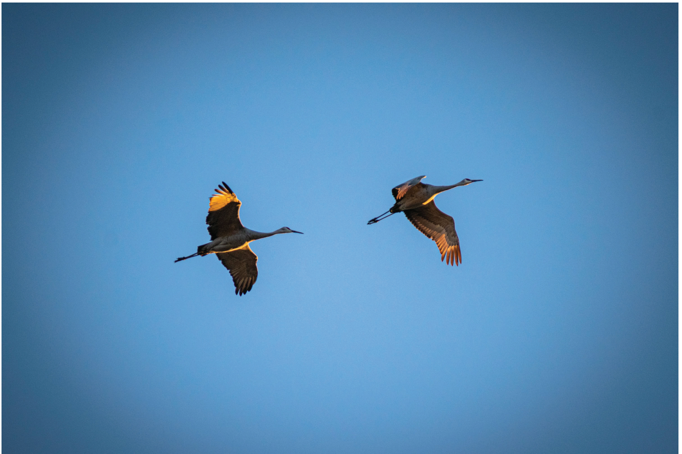
Flocks of sandhill cranes migrate from the north to Georgia and Florida, making their stopover in Jasper County, Indiana. ▲ ▼ Jasper-Pulaski Fish & Wildlife Area, Medaryville, Indiana