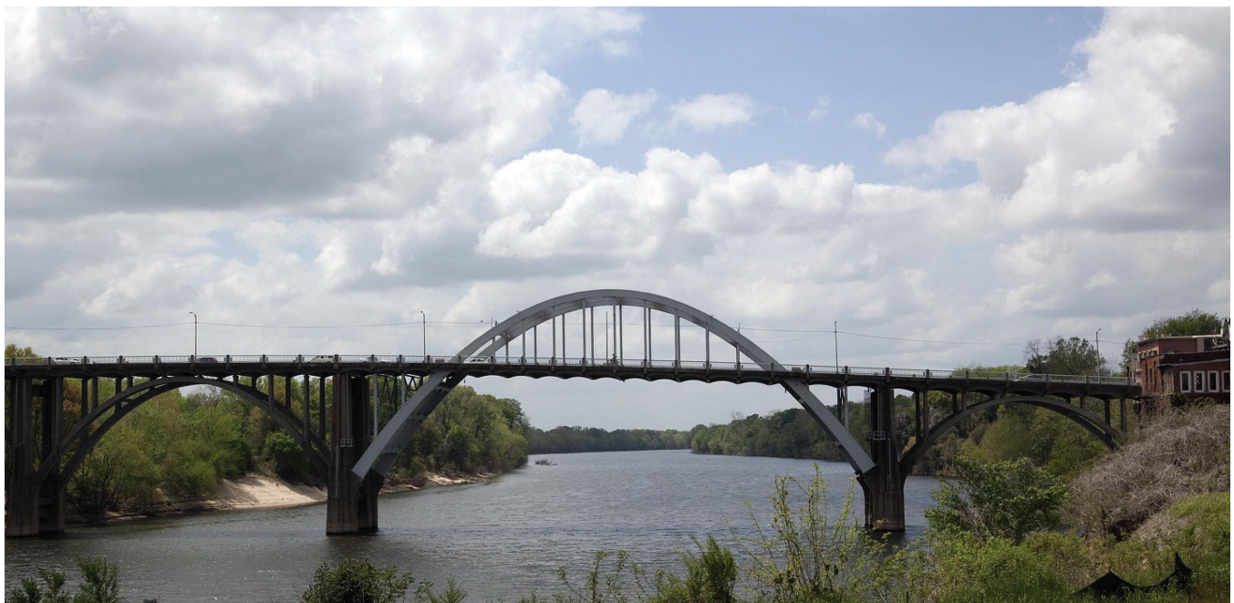
Edmund Pettus Bridge, Selma, Alabama, 2010.