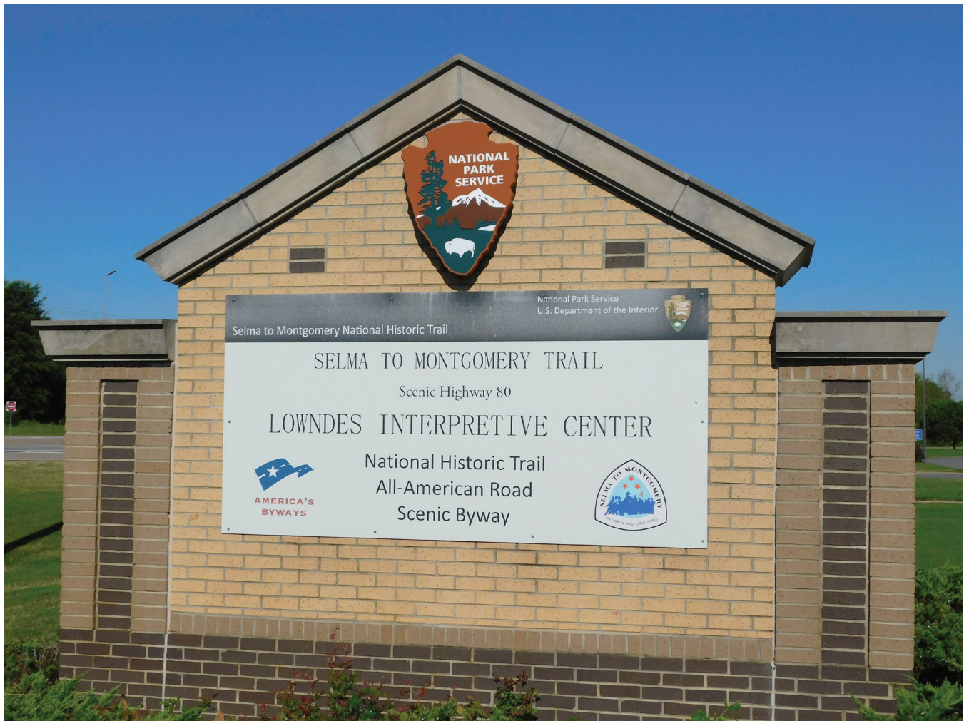
Lowndes Interpretive Center sign.