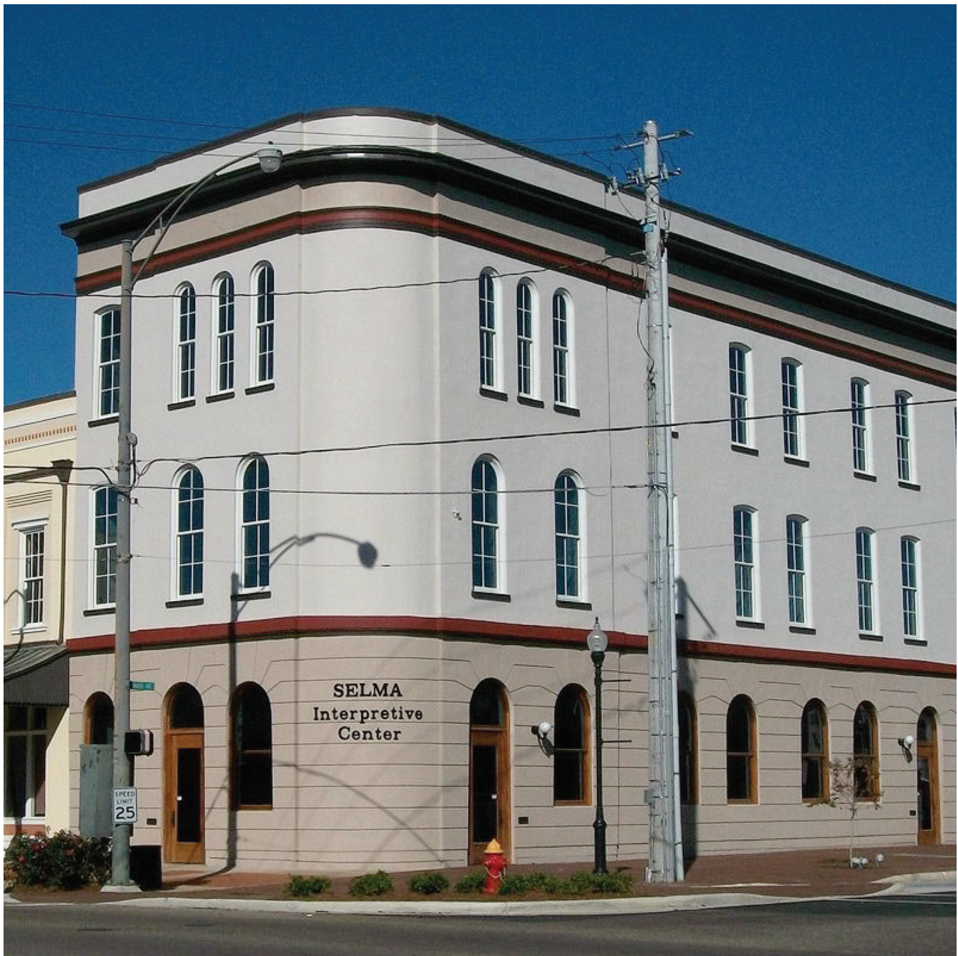
Selma Interpretive Center.

remodeled, with state-of-the-art exhibitions, a new theater and film, more visitor space new stations featuring local activists' stories, and a new interpretive focus on voting and citizenship, it will bring additional life to the trail.