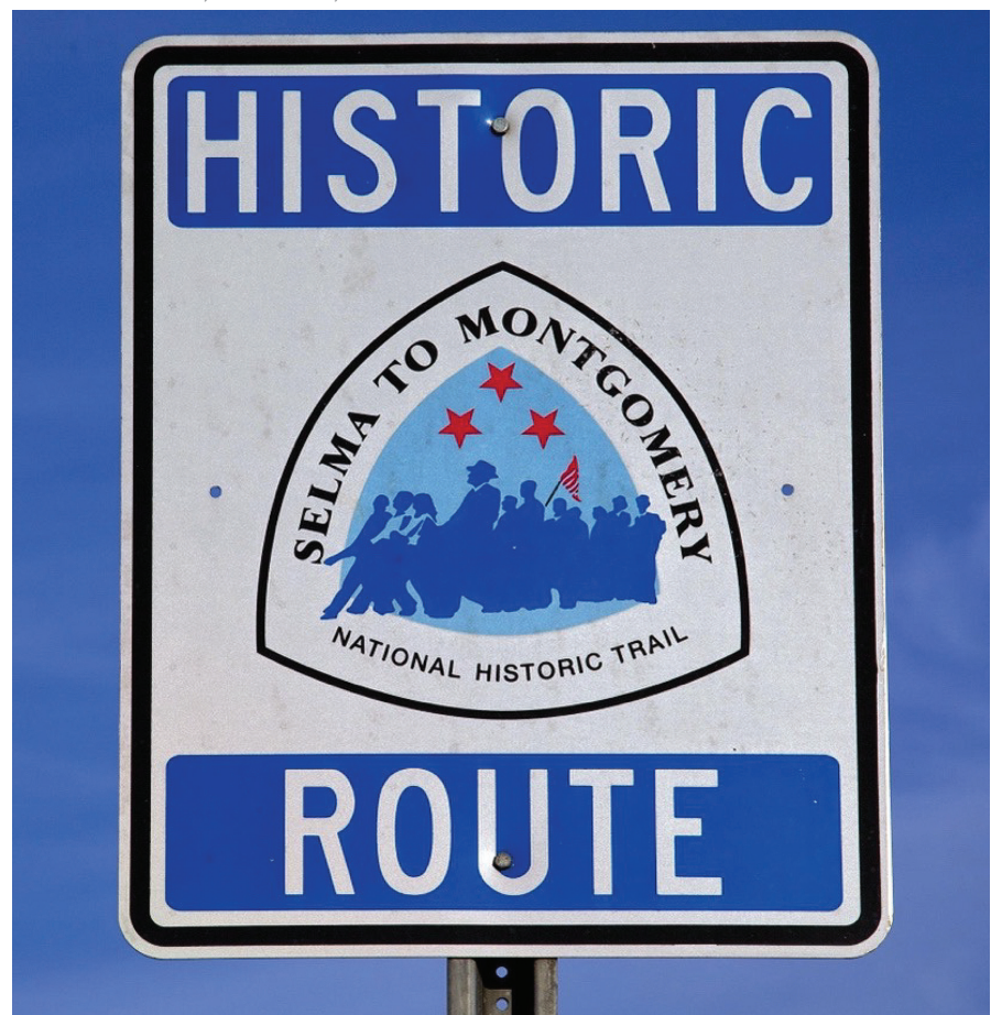
Official Selma to Montgomery National Historic Trail signage.

Congressional authorization of Selma to Montgomery National Historic Trail followed a decade of related efforts to commemorate the people, events, and places associated with the greater Civil Rights Movement, beginning with designation of the Martin Luther King, Jr., birthplace as a national historic site in 1980. 7 In 1989, Representative John Lewis, former member of SNCC and a leader of the 1965 march on the Edmund Pettus Bridge that became known as Bloody Sunday, introduced legislation in Congress to fund a Department of the Interior study to determine the eligibility and feasibility of a new historic trail that preserves the Selma-to-Montgomery March route under the National Trail Act of 1988. 8 Lewis saw the trail concept as a way of stringing together disparate places along the route, which covered three counties and two municipalities in Alabama's Black Belt region. Using historical research, oral history interviews,