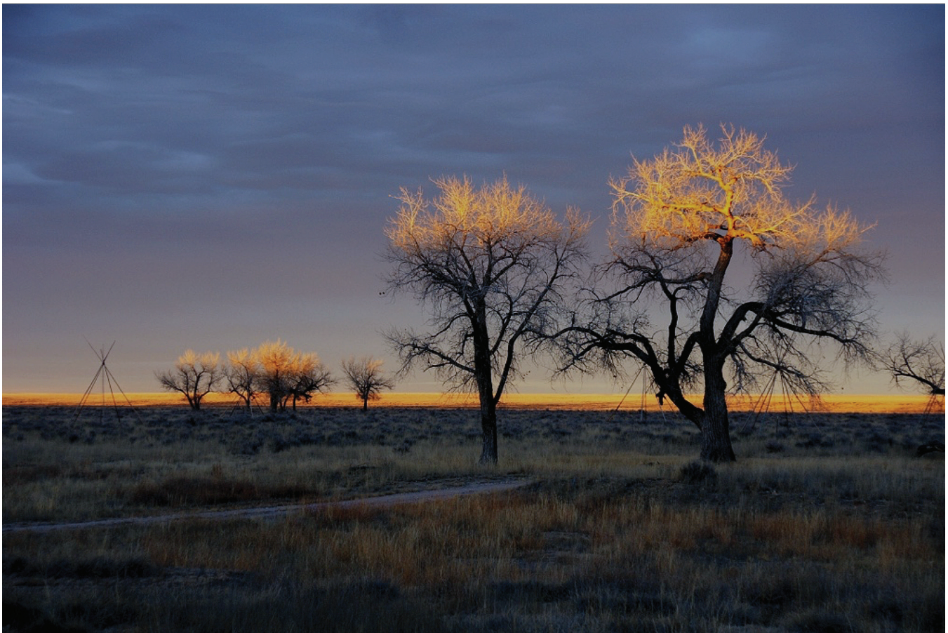
FIGURE 12. The Sand Creek site on the morning of the massacre's sesquicentennial.