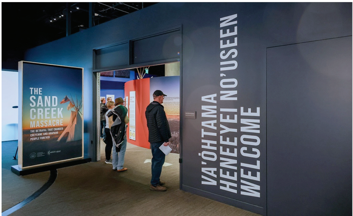
FIGURE 11. The entrance to History Colorado’s Sand Creek exhibit.