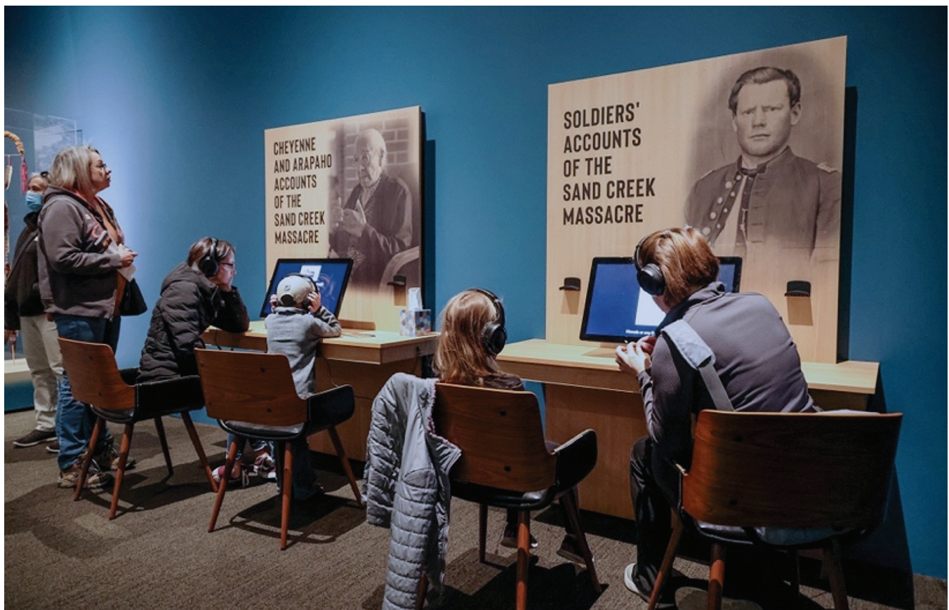
FIGURE 10. Listening stations at History Colorado’s Sand Creek exhibit.

A preliminary meeting, focused on planning, took place in January of 2020. The group intended to reconvene in March, but the COVID-19 pandemic threw their efforts—among other things—into chaos. After that, work on the