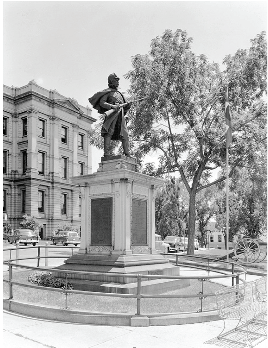
FIGURE 6. The Colorado Civil War memorial.