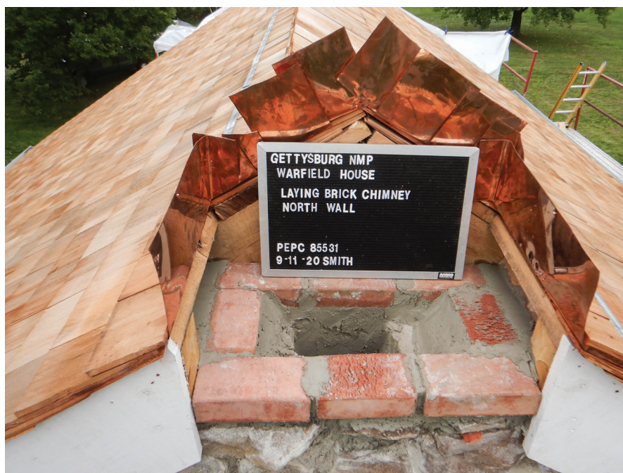
Detail of the restoration of the James Warfield home.

Indeed, I wondered what had changed along Confederate Avenue, that stretch of asphalted roadway