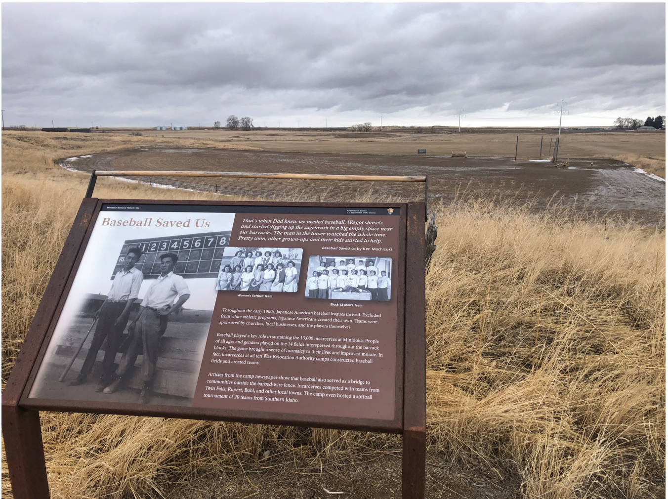
(top) The camp's root cellar: fish-eye view showing construction details. (bottom) Baseball field and signage.

wind farms proposed by Magic Valley Energy, a subsidiary of LS Power: a nationwide investor in, and developer and operator of, clean energy sources. In March 2020, Magic Valley Energy announced the company's plan to develop one of the nation's largest wind farms in southern Idaho, on land mainly owned by BLM and just on the edge of the national historic site. On the highway driving to the turn-off for Minidoka, I saw several survey crews and trucks off in the fields and scrub. Company officials touted the estimates of nearly 700 jobs the project would create during construction and millions in added annual tax revenue to local counties to fix roads and fund schools. 15 At the time, the company was hoping to begin the project as early as 2022, once BLM issued its environmental impact statement (EIS), after a period