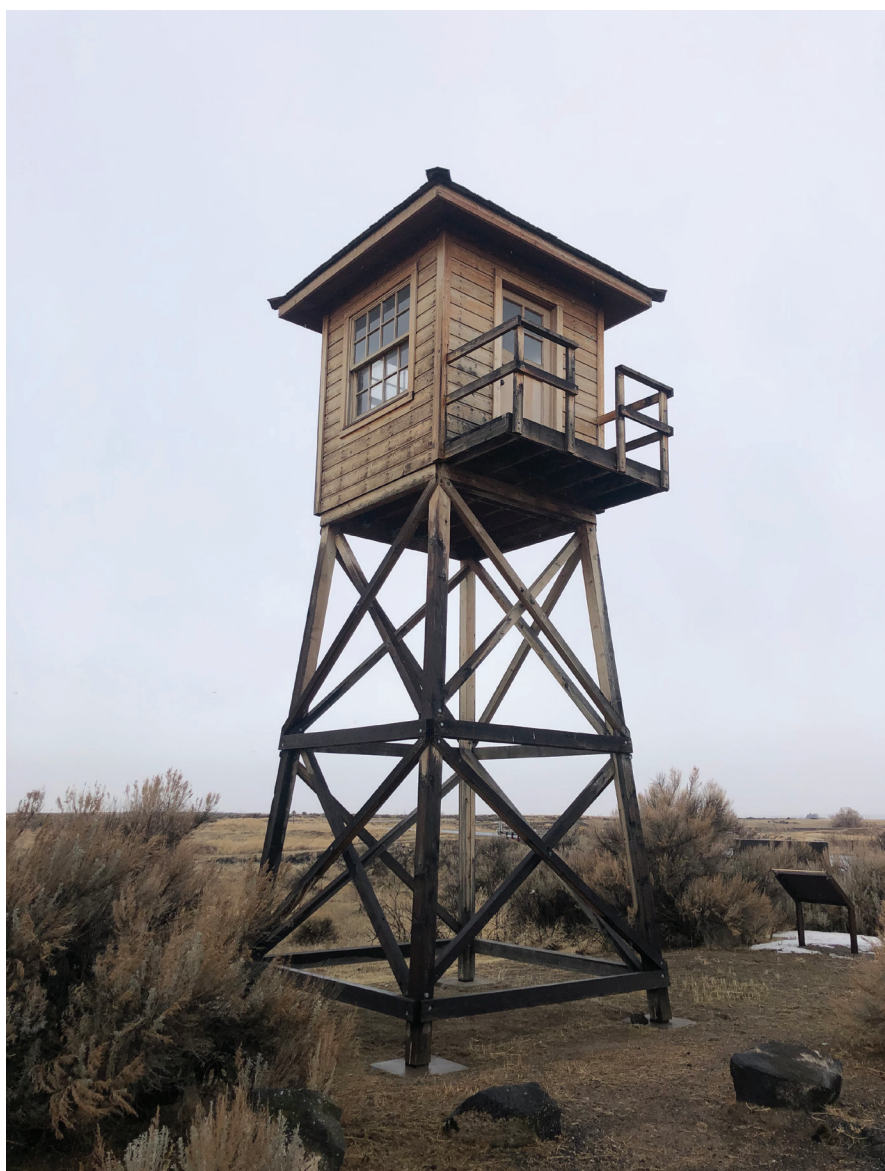
Minidoka guard tower. ROBERT T. HAYASHI

Not much changed at the site until recently. In 2001, President Bill Clinton utilized the Antiquities Act to designate 73 acres of the original site the Minidoka Internment National Monument. The National Park Service (NPS) then developed a general management plan for the site, lobbying for the acquisition of more land, the reconstruction of former structures, such as living quarters, and a change in the site's official name. At the time, the official name, the Minidoka Internment National Monument was not in line with that of the agency's other related site, Manzanar National Historic Site. The term "Internment" was unacceptable to some Japanese Americans and their organizations like the Japanese American National Museum who use "concentration camp" to define the American World War II civilian incarceration sites. In 2008, Minidoka was redesignated as a national historic site. Thus its name was changed,