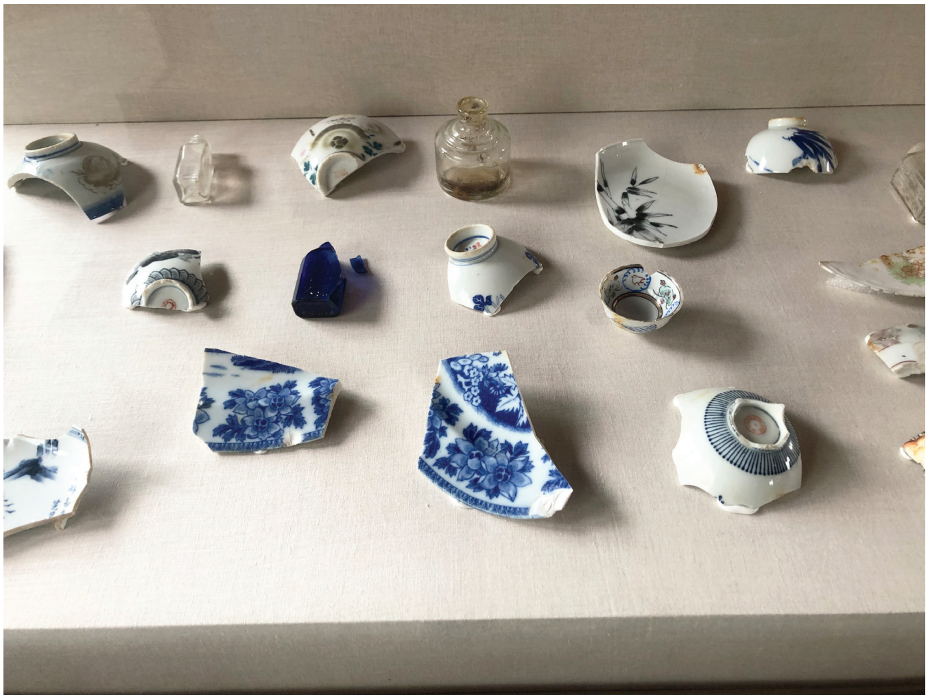
Visitor Center exhibit of ceramic and glassware.