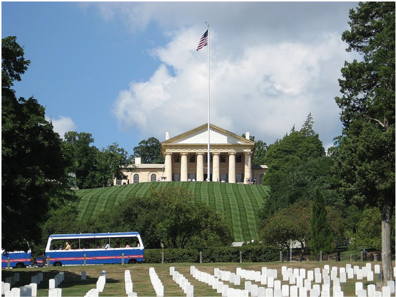
Arlington House.

this place that he departed two days later to begin his four-year fight for Virginia and the Confederacy. He never returned. 2