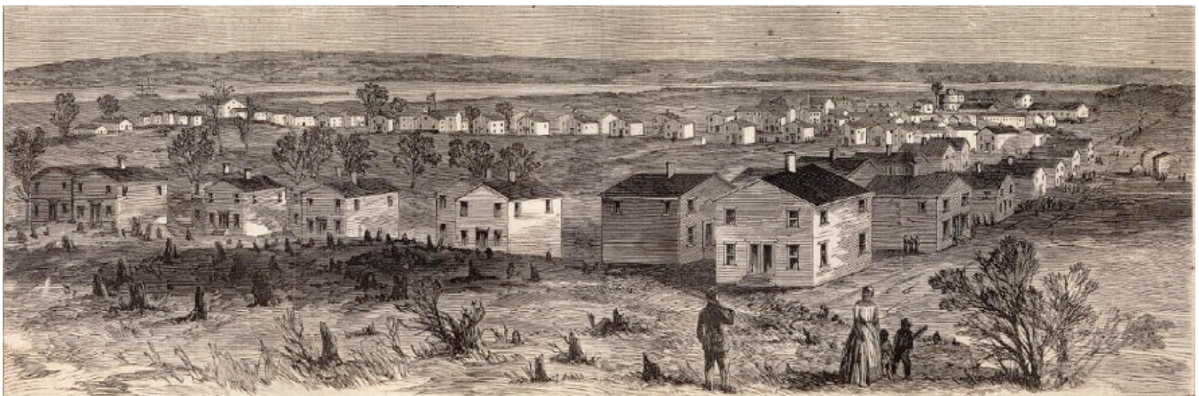
(top) US soldiers at Arlington House, 1864. LIBRARY OF CONGRESS (bottom) Freedmen's Village, Arlington, Virginia, Harper's Weekly , May 7, 1864. LIBRARY OF CONGRESS

process of closing the settlement down, in response to complaints that it had become an eyesore. By 1900 the village was no more. 4