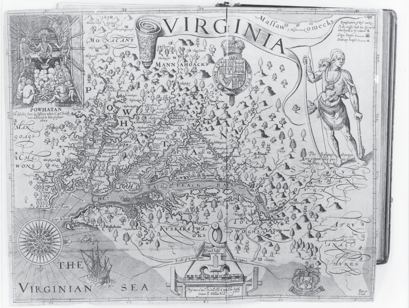
This map, created by John Smith in 1624, is the first recorded detailed map of the Chesapeake Bay. In this portion of the map, Point Comfort is surrounded by numerous villages and towns occupied by tribes who were part of the Powhatan Confederacy.

Also in that year, the first Africans, kidnapped into slavery by the Portuguese from the Kingdom of Ndongo, were forcibly brought to Old Point Comfort, where they faced an emerging colonial system that never embraced them as citizens or contributors to the colony. Brought to the colony by two English privateer vessels—the White Lion and the Treasurer —who pirated about 100 Africans from the San Juan Bautista , the ships landed at Old Point Comfort in late August and exchanged about 32 Angolans for supplies. The rest of the prisoners were presumably sold as unfree laborers in Bermuda. 5 More Africans were transported to and enslaved in the colony in the years afterward.