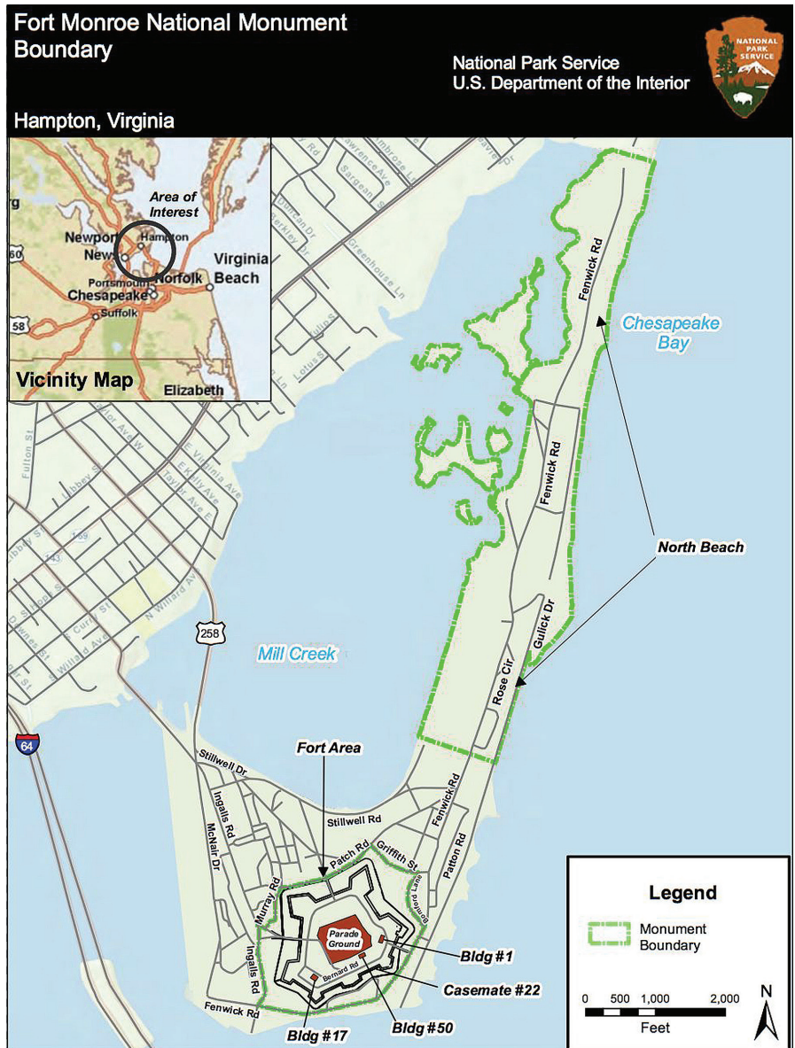
(right) The boundary of Fort Monroe National Monument (in green) and the overall site also controlled by the Fort Monroe Authority. NATIONAL PARK SERVICE

North Carolina rested with the deep waters of the Elizabeth River. This tremendous expanse of lands and waterways connected thousands of Indigenous people's tribal groups with their numerous cities and towns.