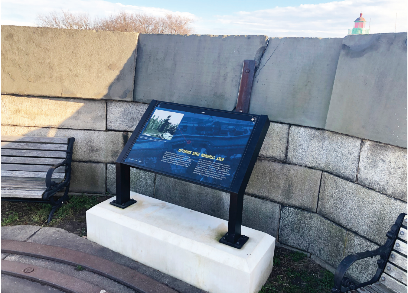
Visitors to Fort Monroe now see, instead of the arch, the Jefferson Davis Memorial Park Marker dedicated to the defeated Confederate President.

Davis’s imprisonment to the establishment of a memorial park and its subsequent removal beginning in 2019, 63 years after its first dedication.