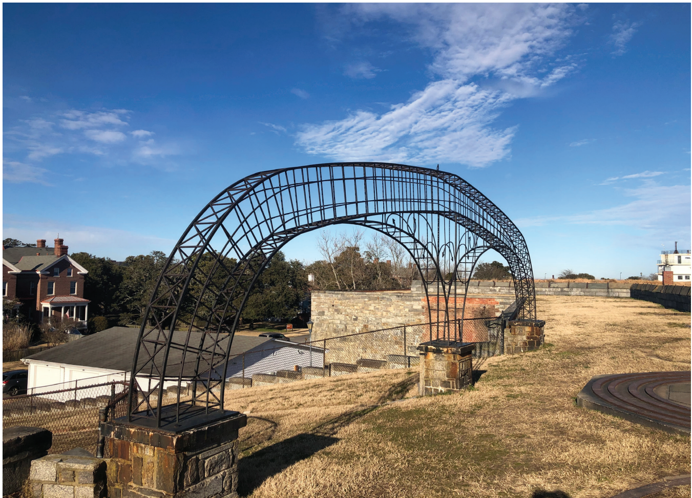
This Memorial Arch, dedicated to Jefferson Davis, was erected in 1956 on the grounds of Fort Monroe. This photograph was taken after the name of Jefferson Davis was removed. Later, the arch itself was removed.

Visitors to Fort Monroe no longer see the memorial park honoring the person who betrayed the nation as president of the Confederacy. Instead, they see a historical marker dedicated to what happened from 1865 with Jefferson