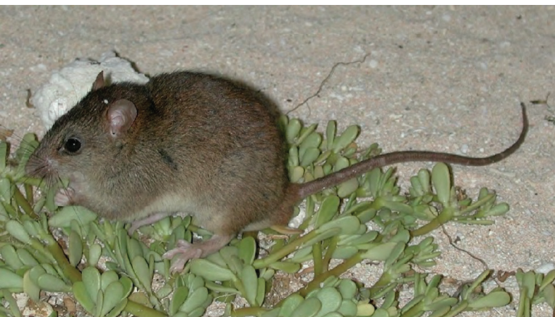
Left: Bramble Cay melomys rodent ( Melomys rubicola ), extinct since 2009, due to anthropogenic climate change. QUEENSLAND ENVIRONMENTAL PROTECTION AGENCY Right: Bramble Cay (Maizab Kaur), Torres Strait, Australia, its final habitat. QUEENSLAND ENVIRONMENTAL PROTECTION AGENCY

Extirpation is the disappearance of a population of a species from a distinct geographic area. From 1849 to 2012, human-caused climate change, more than other human factors, caused extirpations in more than 400 plant and animal species, (Wiens 2016; Roman-