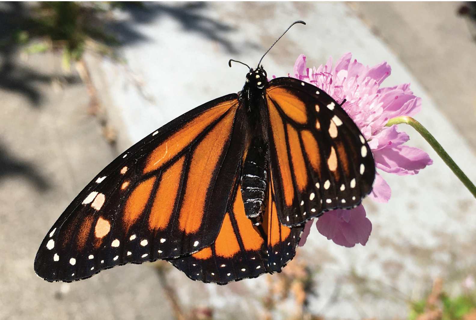
Monarch butterfly ( Danaus plexippus ), Berkeley, California, USA. PATRICK GONZALEZ

Monarchs face threats at both ends of the migration: in Canada and the US, neonicotinoid insecticides kill butterflies and glyphosate herbicides kill milkweed, their required food plant; in México, deforestation destroys oyamel fir ( Abies religiosa ) forest, their required vegetation. Along the way, climate change adds threats of heat and aridity above the thermal tolerance of the species. Climate change under high emissions could cause heat-induced mortality of 60–80% of eastern monarchs in Canada and the US; cutting emissions to meet the Paris Agreement goal could limit heat-induced mortality to 0–40% (Zylstra et al. 2021; Zylstra et al. 2022). Climate change also increases risks of heat and aridity-induced mortality of butterflies across the western US, including the western population of monarch butterflies that