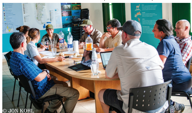
FIGURE 4. Onsite consultations and workshops with the five focal parks. JON KOHL

The SST traveled to Argentina twice to conduct onsite consultations at the five focal parks (Figure 4).