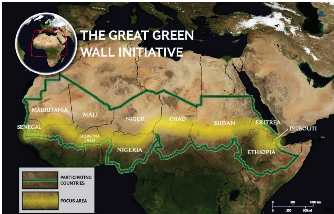
▼ The continent-spanning Great Green Wall Initiative in Africa, linchpin of the newly formed Mega-Eco Project Alliance. THE GREAT GREEN WALL INITIATIVE