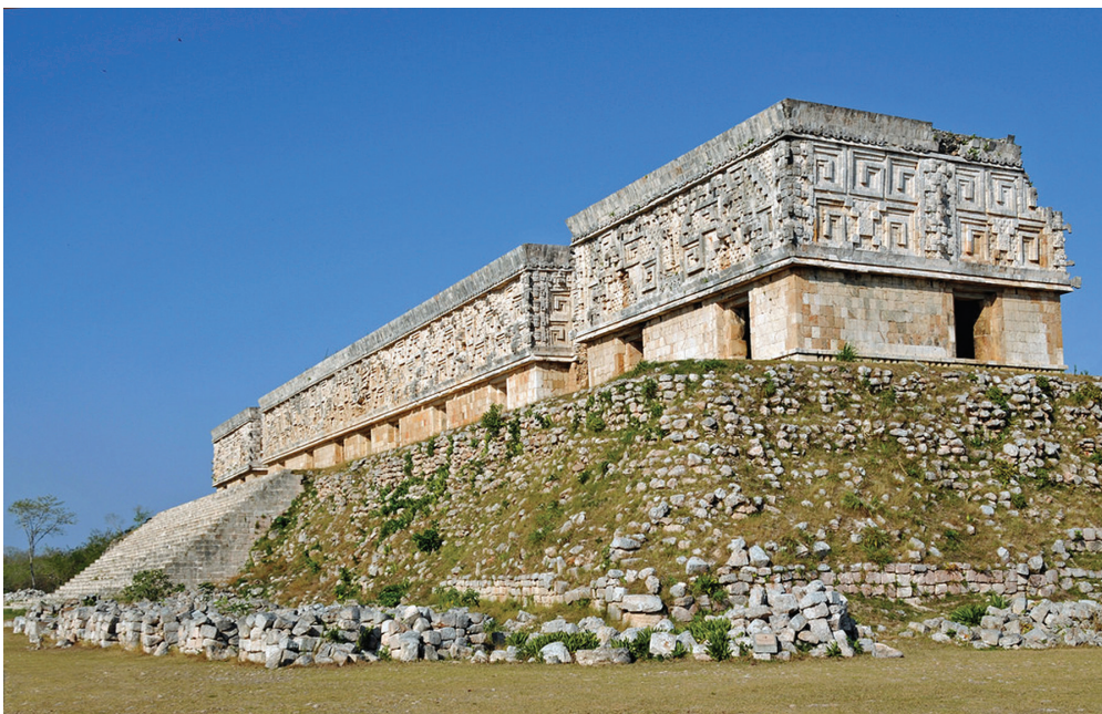
▼ The House of the Governor, Uxmal, Mexico. The building was constructed in the 10th century CE to commemorate the reign of Lord Chahk. It was used as a royal palace and administrative center.

REBP Reserve not only promotes the conservation of natural resources, but also the environmental services that these resources provide to the Indigenous communities that inhabit the Puuc region. In other words, conservation is not limited only to flora and fauna, but also to ways of life and the relationship between the landscape and local knowledge of land management, where culture, ancestral knowledge, and forms of production are the primary objects of integration for conservation, respecting local ways of life, patterns of consumption, and forms of organization.