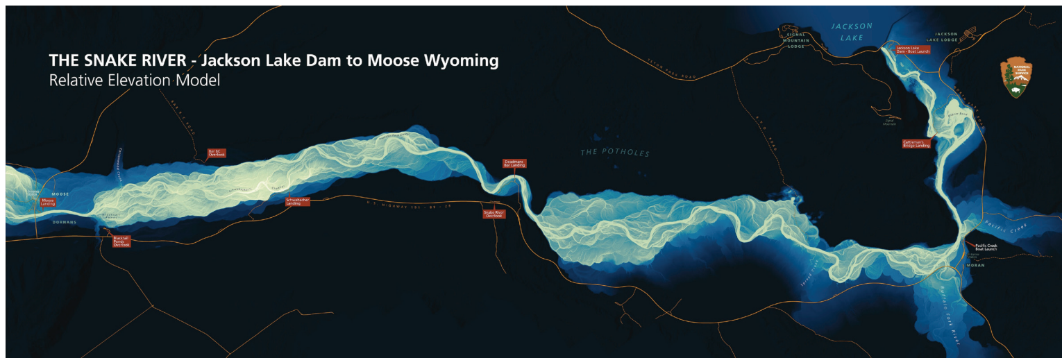
FIGURE 2. Map of the Snake River riverbed, including its paths and braids over time. Map created by Madeline Grubb, reproduced with permission from the National Park Service. The map can be found, along with more description of the Snake River, at https://home.nps.gov/grte/learn/nature/snake-river-rem.htm (NPS 2024). The caption for the map on that webpage reads, “The varying elevation of the streambed is visualized with a blue color gradient, showing how the river’s flow has eroded the landscape over time with altering paths of travel.”

opportunities and their impacts on local jobs and revenue, such as angler choices under different climate futures (Hofstedt 2024) and fisheries management strategies to maximize recreational revenues (Loomis 2006).