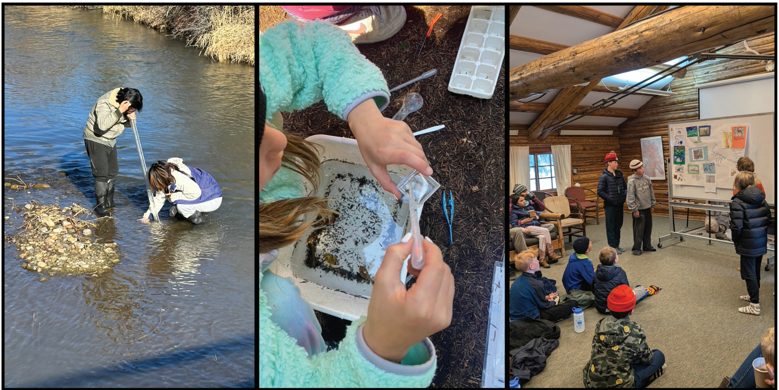
FIGURE 1. Three photos showing the learning progression across Teton 5th youth programming field days in Grand Teton National Park. The left photo shows students beginning their stream investigation, the middle photo shows them processing and identifying macroinvertebrates, and the right photo shows presentations at the end of the field day.

between GTNP, Teton Science Schools, and University of Wyoming's Science & Mathematics Teaching Center and their converging desire to support stream ecology education. Through a grant, we were able to expand this partnership to include University of Wyoming ecology researchers from the Departments of Zoology and Physiology and Botany and the Wyoming USGS (US Geological Survey) Cooperative Fisheries and Wildlife Unit. Much like channels of tributaries to a river such as the Snake River in GTNP, each of our four teams has added momentum, influence, and complexity to our efforts to develop stream monitoring protocols that support both long-term scientific monitoring and youth learning.