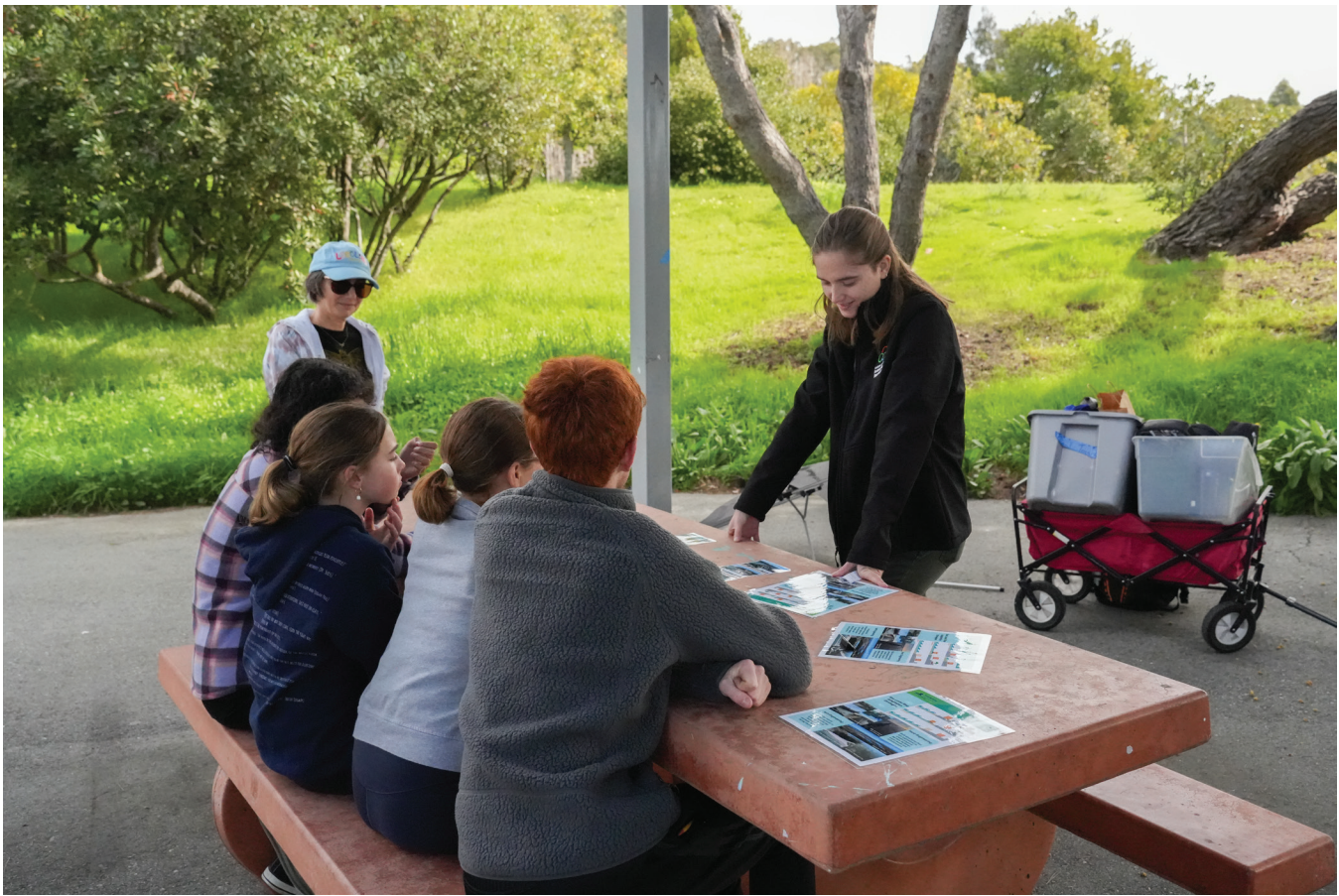
Middle school students on a YECS field trip consider engineered solutions to sea level rise impacts across San Mateo County.