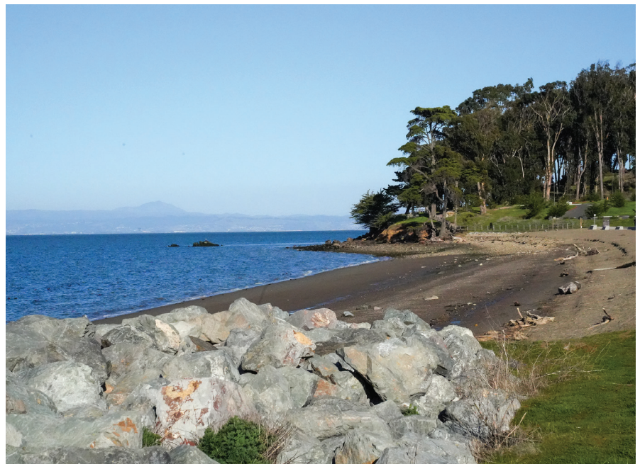
Coyote Point Recreation Area in San Mateo County, California, is situated along the San Francisco Bay shoreline, featuring stunning views and various recreational opportunities.

OVERLEAF San Mateo County Parks Department staff lead guided hikes for students around Coyote Point, sharing the history of the park and discussing how the park can be more resilient in the face of sea level rise and climate change.