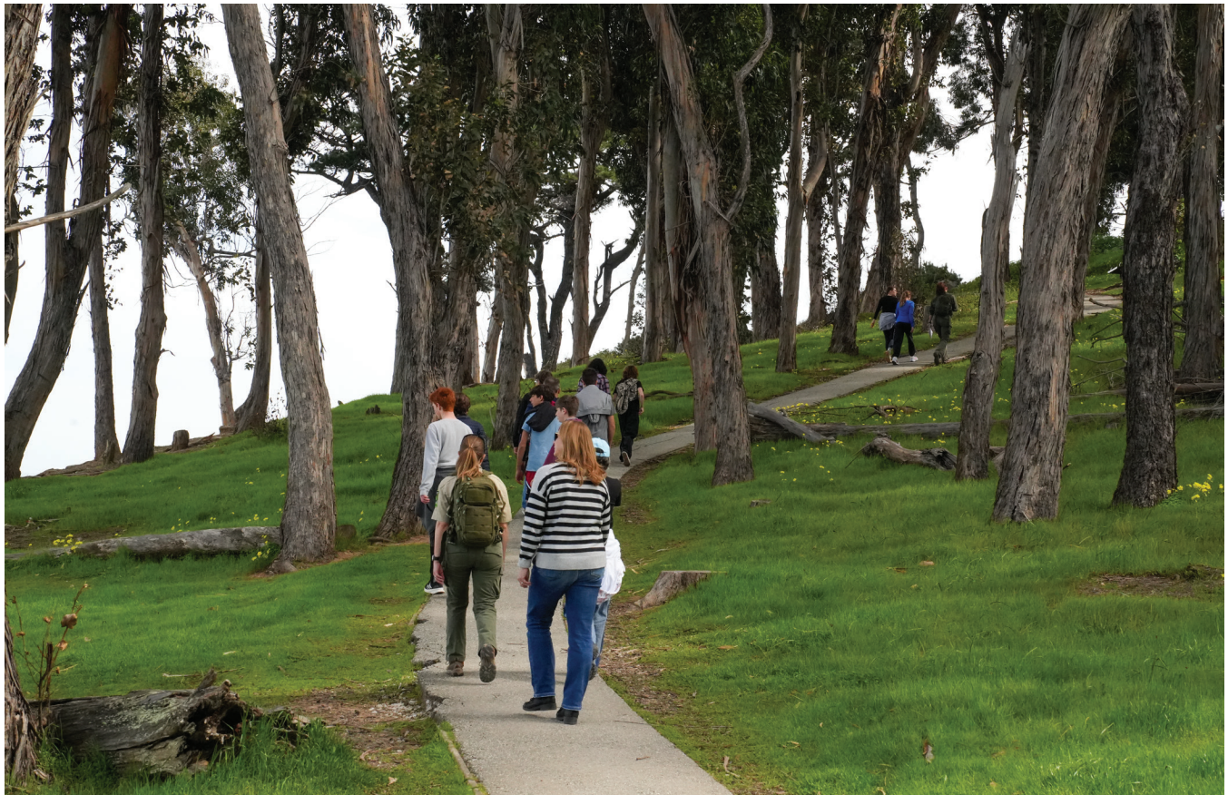
Students on a YECS trip, February 2025. SAN MATEO COUNTY SUSTAINABILITY DEPARTMENT