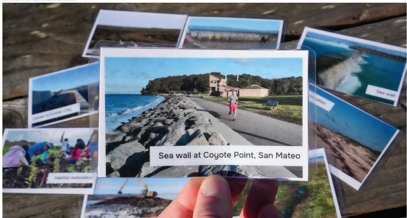
On YECS field trips, middle school students work on a card sorting activity that asks them to identify and categorize sea level rise adaptation strategies relating to soft and hard engineering.