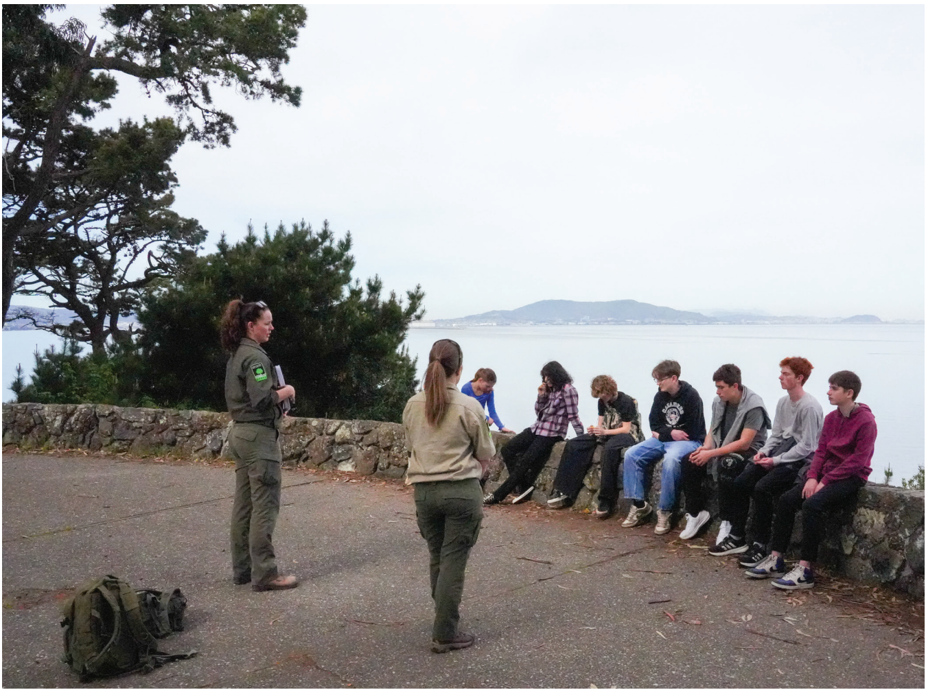
Parks Department staff teach students about the history of Coyote Point on a YECS trip.

Question: How have humans altered the area where Coyote Point is located?