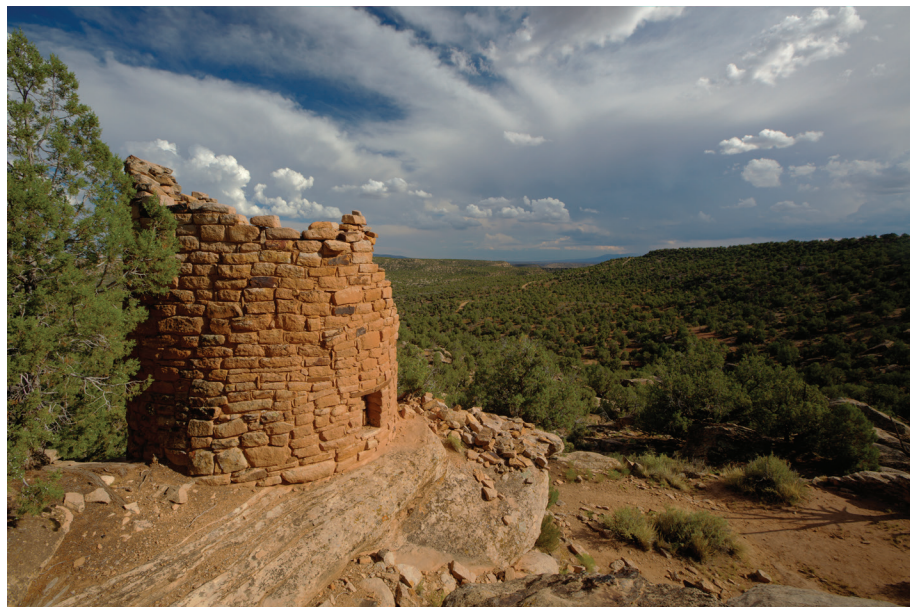
FIGURE 2. (TOP) One of over 6,000 recorded archaeological sites in Canyons of the Ancients National Monument in Colorado. (BOTTOM) A pumpjack in Canyons of the Ancients National Monument lifts oil and other fluids from an underground oil well. When the 176,000-acre monument was established to conserve and protect ancient archaeological resources, 81% of the area was leased for oil and gas development.

"There is a broad and diverse citizenry, often rooted in place, that has a deep affinity for these lands and are passionate advocates for the conserve, protect and restore mission," said one former senior land manager.