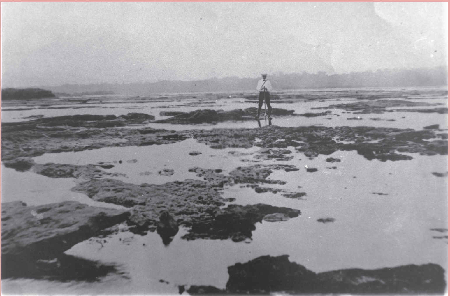
Low Water on the Muscle Shoals.

arriving in northwest Alabama in the late 1700s and early 1800s saw the Muscle Shoals as a hindrance to development. After a series of treaties with the Chickasaw in the 1810s—many negotiated by future president Andrew Jackson—opened up more territory in northwest Alabama, migration to the region increased along the Natchez Trace and Jackson’s Military Road, both of which connected Nashville to New Orleans. 7 Many of these migrants brought enslaved people to grow cotton in the rich bottomlands of the river. 8 The Muscle Shoals, however, prevented steamboats from operating freely along the river, making getting cotton and other goods to market challenging and expensive. 9 In the 1830s, when Alabama was still very much the frontier of the Old Southwest, the US government and local leaders sought to solve the “problem” of the Muscle Shoals. Between 1831 and 1834, private investors built the first railroad west of the Appalachian Mountains, which became the only railroad used during Indian Removal in the 1830s. The Tuscumbia, Courtland & Decatur (TC&D) Railroad allowed for rail shipment around the worst of the shoals. 10 The sale of 400,000 acres of land,