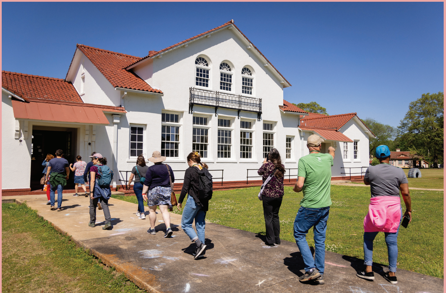
Village School.

other power generation projects, including its coal-fired plants. Such interpretation, however, is focused more on the history of plant construction, what TVA is doing to move away from coal, and how it addresses the problem of coal ash today, rather than on the history of the environmental impact of the plants and the extraction of the coal necessary to keep them running. 42 While TVA does explore the fascinating story of the restoration of the Copper Basin in the 1980s on the website, the significant work TVA did in the 1960s to promote the protection of waterways during coal mining and the reclamation of strip-mined land through reforestation to “stabilize the soil and return the mine area to productive use” is absent. 43