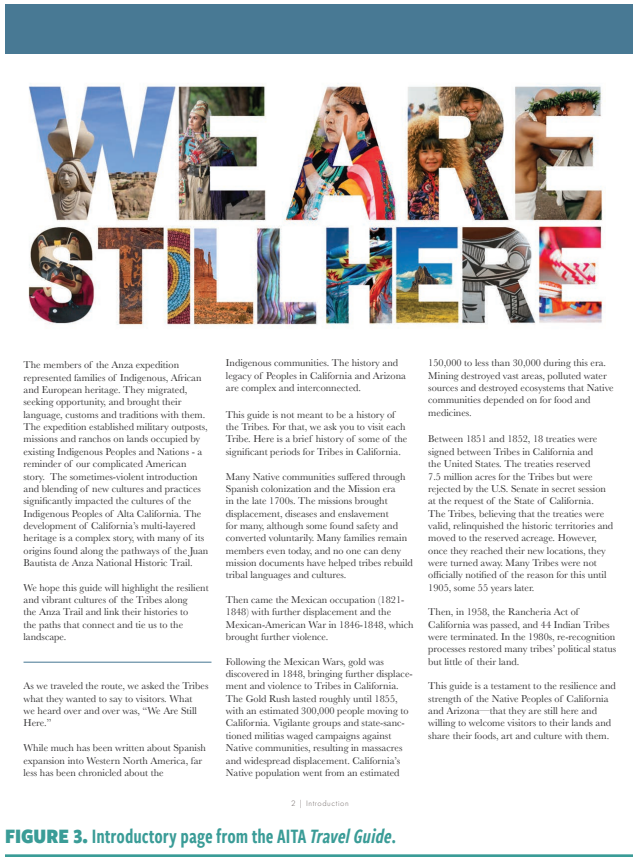
FIGURE 3. Introductory page from the AITA Travel Guide.

Attention to Indigenous history, life, and lands bookends this work and has long guided my work and ethic at and beyond Anza NHT. Correcting historically inaccurate and purely celebratory narratives of colonial seizure and occupation is but a small step in a larger project of decolonial abolition that includes the return of occupied lands to their ancestral kin and relations. A decolonial abolitionist focuses on supporting Indigenous futures and working together toward collective liberation. This approach also leaves room for many new and different ways of being in relation with one another that do not solely recirculate settler-colonial extractive relationships. Chickasaw scholar Jodi Byrd warns us of the “syllogistic trap of participatory democracy born out of violent occupation of lands,” which continually recenters the settler state as the central and sole apparatus of intervention and resolution for the very violence and inequity it creates. 32 Decolonization and returning the land back to Indigenous Peoples is possible and is happening. Corrina Gould, whose words open this piece, sits on the Board of Directors of the Sogorea Te’ Land Trust, which oversees the return of 2.2 acres of a sacred shellmound site to Ohlone peoples in March 2024. 33 In June 2025, over 47,000 acres along the Klamath River was returned to the Yurok. 34 While there remains much work to do to uphold Native sovereignty, I am ever heartened and emboldened by Indigenous resurgence.