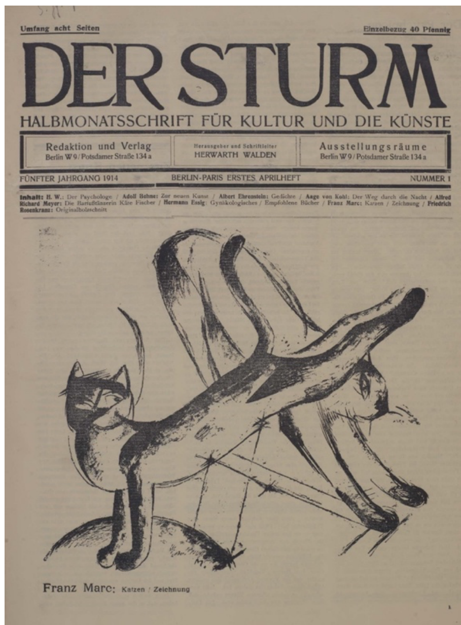
Figure 4 Franz Marc, Katzen [cats], on the cover of Der Sturm, vol. 5, no. 1 (1914). Image public domain.