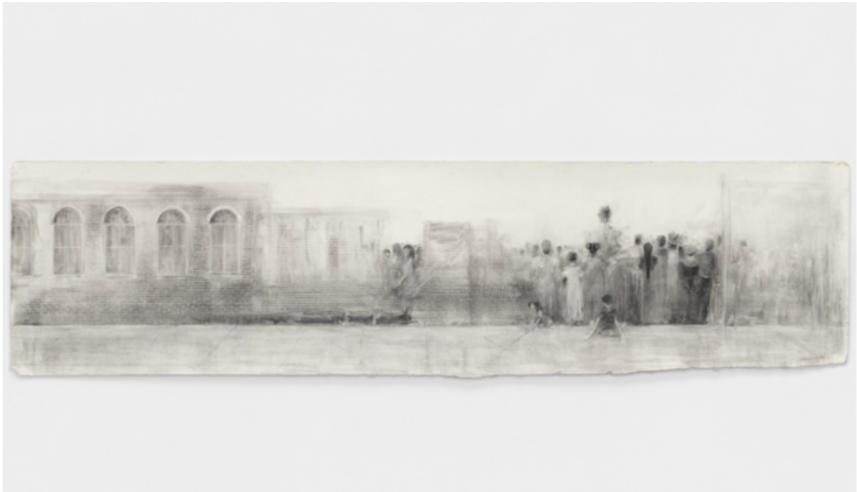
Figure 1 Sydney Cain, Turk and Fillmore , 2018, graphite, charcoal on paper, 21 x 63 in. (53.3 x 160 cm). Courtesy of the artist; photograph by John Janca.

communities navigate obfuscation to survive the threat of erasure. In Turk and Fillmore (2018), Cain visualizes multiple dimensions at the historic Turk and Fillmore Street MUNI substation in San Francisco's historically Black Fillmore district, once known as the "Harlem of the West" (fig. 1). Formerly a powerhouse that supplied San Francisco streetcars with electric power, the building has remained vacant since the 1970s. To the left of the drawing, Cain renders the substation's discernible façade of brick and rounded arched windows, while a congregation of faintly outlined figures assemble on the right. Most of these ancestral figures have their backs to the viewers so that the audience can only perceive their varied hairstyles, hats, and headwraps. In the center of the composition, a blurred figure emerges from the wall and extends their arm towards a train that is moving across the middle ground. The locomotive moves towards a young child wearing a mask who is busy extending the train track. This interstitial space, which collapses the division between structure and spirit on either side of the composition, suggests that the artist is deconstructing the substation to reveal what once was and is always there.