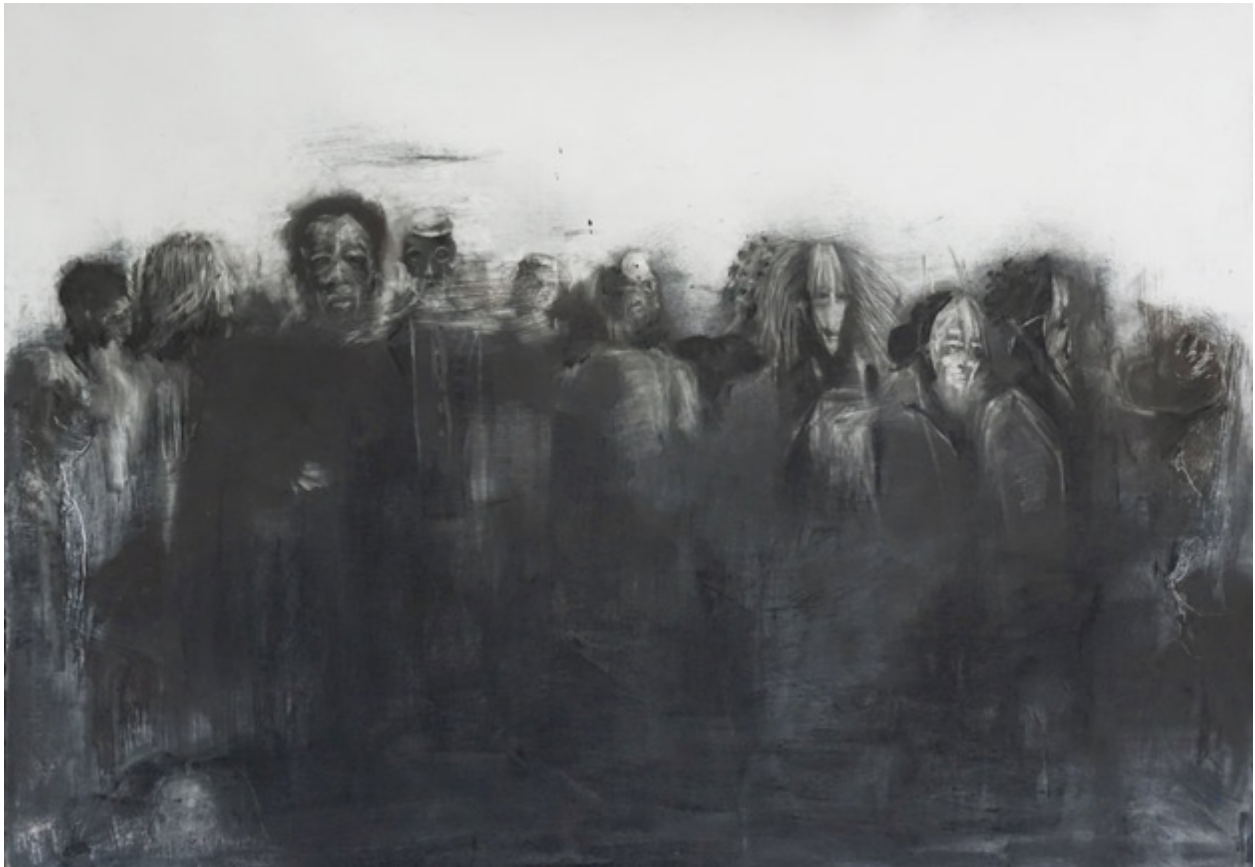
Figure 3 Sydney Cain, Refutations (for those waiting for light) , 2019, graphite and metals on paper, 33 x 46 in. (83.8 x 116.8 cm.).

contrast between shadows and highlights throughout the drawing results in figures with partially rendered faces, smudges, lines, and tones of gray (fig. 3). While these figures are only merely suggested, the use of African tribal masks indicate that they belong to the Black diaspora. Working with particles of black dust, Cain illuminates and reveals “those waiting for light,” or rather the spirits hidden within the voids of our own world.