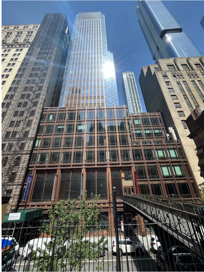
Figure 7. Pelli Clarke & Partners, Trinity Commons, 2013-2020.

majority religion as part of the social fabric and thus not really as religion.” 41 Material disestablishment allows church-led real estate development to satisfy the various interests and opinions of the church’s congregations, the state (as represented by regulatory and zoning bodies), real estate agents, tenants, and the various publics who might interact with or have opinions about the building. Material disestablishment thus allows churches to better navigate competing forces while hiding the continued power of churches to shape the urban fabric of the U.S.A.