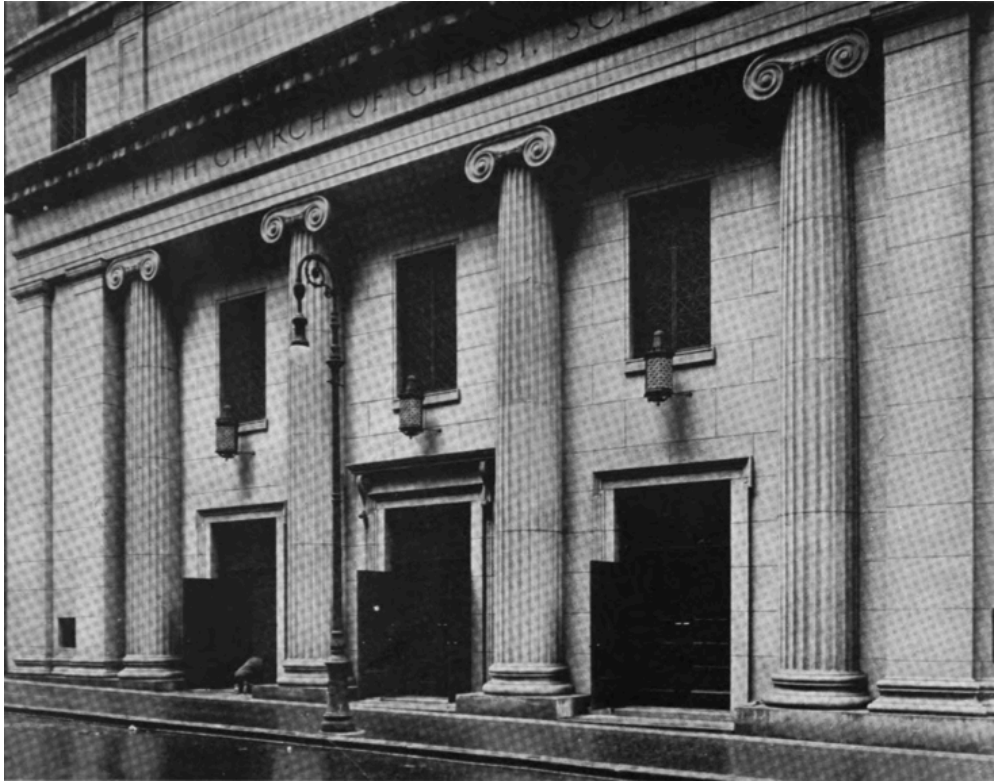
Figure 4. Starrett & van Vleck with A. D. Pickering, Fifth Church of Christ Scientist , Canadian Pacific Building, New York, 1919-21. Photo not credited in Architecture & Building , January 1922.

The economics of the development, however, demonstrated a strategic self-effacement. The real estate deal was covered in depth by the Evening Post , which cited a member of the congregation: