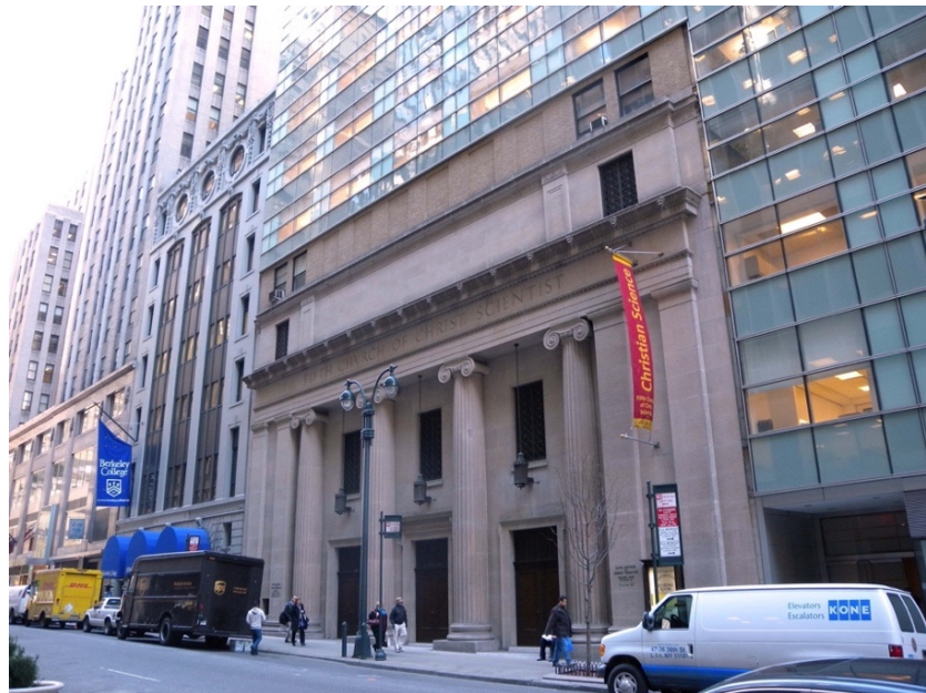
Figure 5. Starrett & van Vleck with A. D. Pickering, Fifth Church of Christ Scientist , New York, 1919-21, renovated Moed de Armas & Shannon and Gensler, 2005.

The building’s renovation in the early 2000s, when glass replaced the masonry walls, augmented the façade’s religious reference. 27 The Christian Science Church’s entrance was untouched, and the contrast with the rest of the building now makes the Church façade’s claim to religion’s place in the city clearer than ever (fig. 5). This conspicuous display contrasts with the congregation’s current status. In June 2022, I attended Sunday service at the Fifth Church. Entering the foyer from East 43 rd Street, a pair of staircases led me up to the auditorium, a stunning, quadruple-height space that slopes down toward the pulpit at the front. Two aisles divided three banks of seating. Both side banks had a full gallery of seating above them, while the central bank had a gallery above the back. The space was magnificent, with green marble columns and a coffered ceiling offset with rich cream-colored walls. But neither side banks nor galleries were in use. I was one of only eight attendees, in addition to the First and Second Readers leading the service, a far cry from the 1700 for whom the church was built. Fifth Church maintained its physical presence despite what seems to be a significant decline in attendance, suggesting the efficacy of material disestablishment. But material disestablishment may not be able to negate the impact of a shrinking congregation.