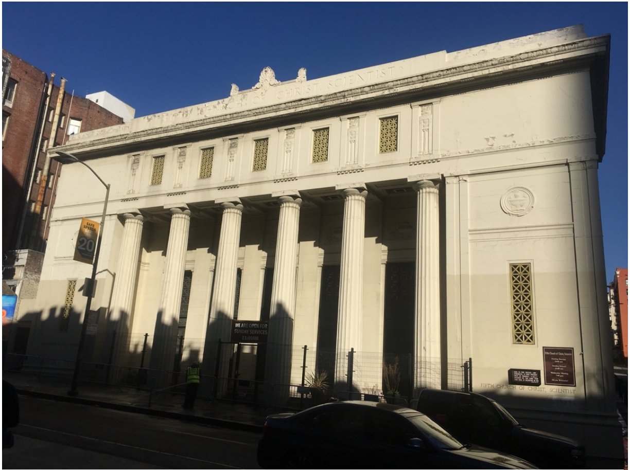
Fig. 6. Carl Werner, Fifth Church of Christ Scientist , San Francisco, 1923.

On the opposite coast, Fifth Church of Christ Scientist in San Francisco occupies a two-story, unpedimented neoclassical building built in 1923 and designed by local architect Carl Werner (fig. 6). 28 Around 2013, Fifth Church partnered with developer Thompson Dorfman and submitted a plan for a thirteen-story building housing ground-floor retail space, 176 apartments, and about 10,000 square feet for a worship space, church offices, classrooms, and a reading room. 29 Thompson Dorfman would own and manage the apartments, while Fifth Church would own the land—allowing this Fifth Church, like its New York counterpart, to relinquish the commercial role of developer. 30 The project was controversial from the start, as it involved demolishing the 1923 Werner building. Fifth Church eventually received permission to demolish its building in 2018 after invoking the Religious Land Use and Institutionalized Persons Act (RLUIPA),