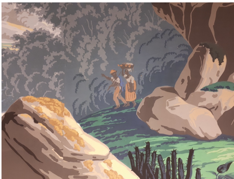
Figure 5. Jean Zuber and Jean-Julien Deltil, detail of Views of North America , 1834 [reprinted 1960s], woodblock-printed wallpaper, 12 ft 9 ½ in. x 49 ft 4 ⅛ in. Musée du Papier Peint, Rixheim, France.

Garrison and Douglass' visit suggests that Youngstown was a place of opposing ideologies during the antebellum period, which is even more significant to consider when noticing that a specific element in the background of Deltil's West Point tableau may have been read ambiguously in the eyes of a customer like Andrews. Indeed, the artist included two Black figures markedly different from the others to the right of the composition (fig. 5). A man and a woman seem to emerge from a dense