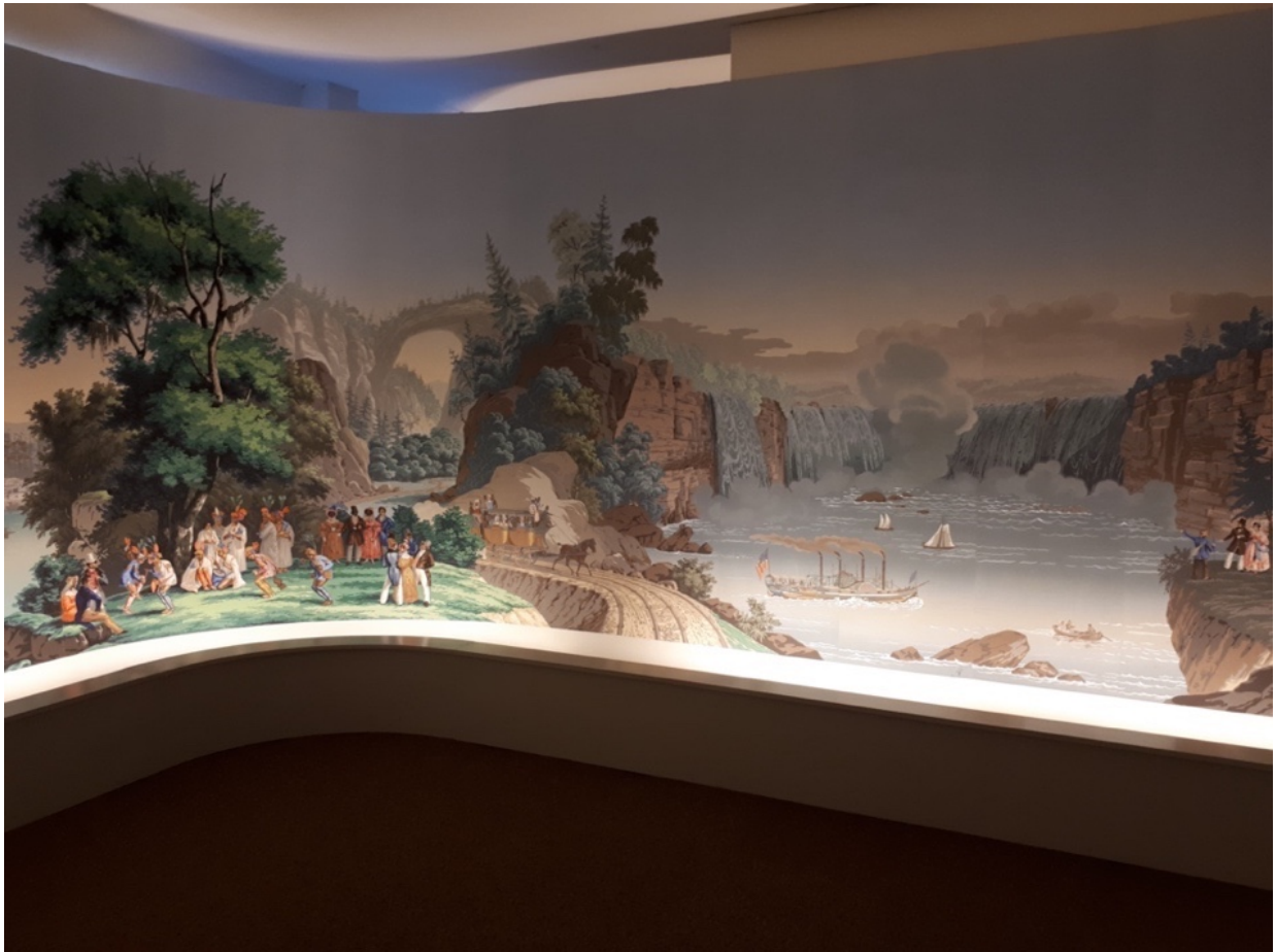
Figure 2. Jean Zuber and Jean-Julien Deltil, Views of North America: Natural Bridge and Niagara , 1834 [reprinted 1960s], woodblock-printed wallpaper, 12 ft 9 ½ in. x 49 ft 4 ⅛ in. Musée du Papier Peint, Rixheim, France.

pretense at racial, economic, and social privilege, as well as project visual discourses about American scenery that perpetuated beliefs in racial hierarchies and an untamed exploitation of natural resources. Behind an apparent depiction of harmony and prosperity, the imagery of scenic wallpapers like Zuber's supported a transatlantic construction of a white American landscape. 4