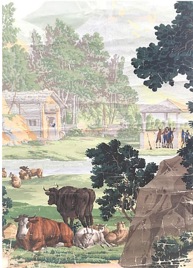
Figure 7. Jean Zuber and Pierre-Antoine Mongin, La Grande Helvétie [fragment], 1820, woodblock-printed wallpaper, dimensions unknown.

De la Ronde's influence extended into the city of New Orleans itself, where he had forged networks and owned a townhouse on Chartres Street. 34 The city itself, as a major harbor, also provided him with the opportunity to purchase imported transatlantic objects, like furniture made in Europe, to help the construction of his identity as planter. Sometime before his death, he acquired Zuber's 1820 Grande Helvétie décor, representing a Swiss pasture scene (fig. 7). Although the location of the wallpaper inside his mansion, destroyed by a hurricane in 1915, has yet to be established, its presence on the estate is attested by the survival of fragments. 35 Within De la Ronde's domestic space, a product such as La Grande Helvétie would have offered an appealing vision of peaceful human development, respectful of nature. Its bucolic and idealized views made the (enslaved) landscape of the U.S. South intelligible within the context of a transatlantic Euro-American pastoralism, erasing the