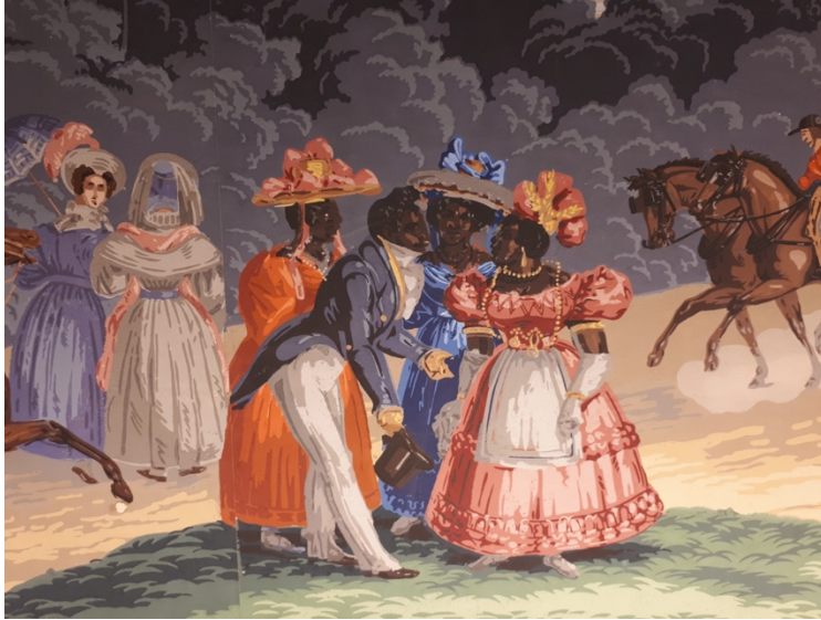
Figure 3. Jean Zuber and Jean-Julien Deltil, detail of Views of North America , 1834 [reprinted 1960s], woodblock-printed wallpaper, 12 ft 9 ½ in. x 49 ft 4 ⅛ in. Musée du Papier Peint, Rixheim, France.

manufacturers of paper hangings. 11 In turn, resellers would offer Alsace-made wallpapers to customers in places as diverse as Cincinnati, Ohio, Norfolk, Virginia, and Mobile, Alabama. 12 This network ensured a wide dissemination of the sets, as was the case for the Views of North America , launched in 1834. 13 In the U.S. South and on its Western frontier, the Views became both intimate and performative in helping customers construct racial, economic, and social identities.