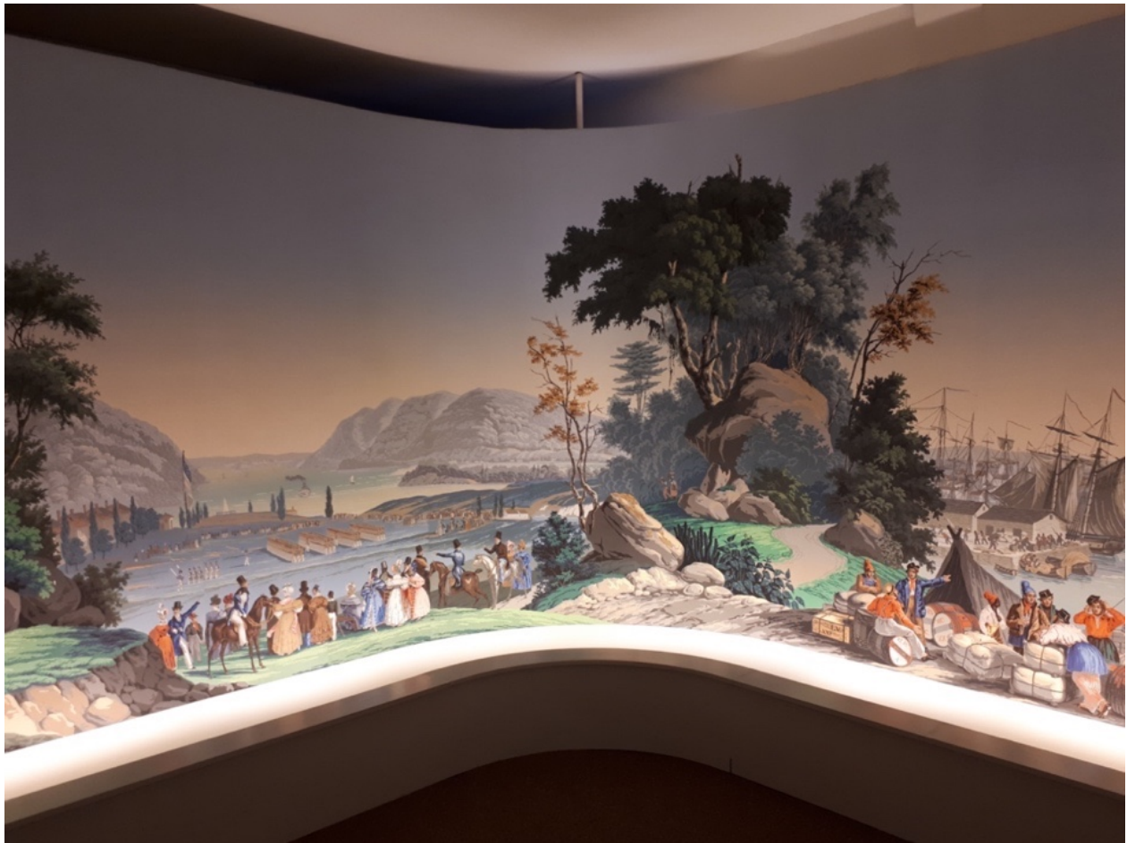
Figure 1. Jean Zuber and Jean-Julien Deltil, Views of North America: West Point and Boston Harbor , 1834 [reprinted 1960s]. Woodblock-printed wallpaper, 12 ft 9 ½ in. x 49 ft 4 ⅛ in. Musée du Papier Peint, Rixheim, France.

figures, the actual designs also reveal the artist's determination to use Black figures as props in his compositions. Engaged in social interactions, these characters appear in all four scenes, sometimes alongside Indigenous figures.