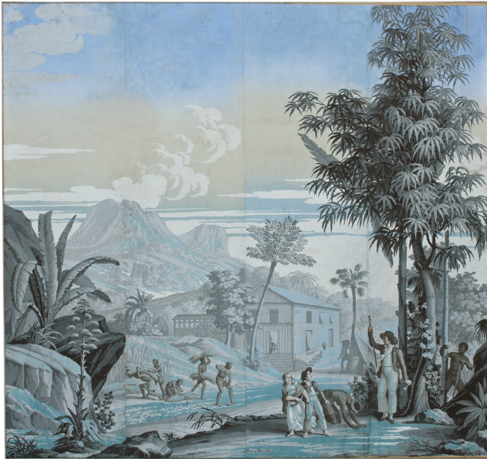
Figure 6. Jean Broc and Joseph Dufour, Paul and Virginie Meet the Master of the Fugitive Slave , 1824, woodblock-printed wallpaper, 6 ft 7 in. x 6 ft 11 in.

situation, equating the figures to self-emancipated people. 29 Hidden for now, these two figures seem on the brink of joining the U.S. polity, a prospect that would have been uncomfortable to some white viewers.