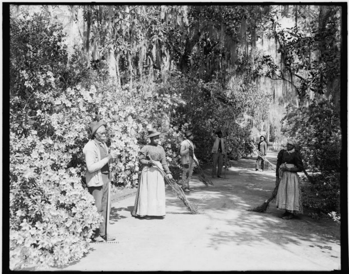
Figure 6. William Henry Jackson, The Caretakers , c. 1901, dry-plate negative, Magnolia-on-the-Ashley series; 8 x 10in. Source: Prints and Photographs Division, Library of Congress, Washington DC.

being violated by the Negro.” 31 This racist hysteria ignored the sexual violence perpetrated by white men on Black women and girls and revealed more than anything the sensitivity and insecurity of white masculinity. It rationalized and often occasioned lynching as a highly visible, spectacular form of punishment for those Black men accused of assaulting white women and sexually transgressing racial boundaries. More often than not, these allegations were mere pretenses contrived to justify mob violence. Perhaps the tendency of white folks to mask their violence as victimhood is why the guides treated visitors like “a brood of incautious chickens,” because the workers recognized the danger white guests posed to them . If this were the case, the guide who raced to find Duncan would have been less concerned for the writer than for one of her male coworkers. The lack of legal recourse for African Americans in the Jim Crow South would have made it all the more likely that Magnolia’s employees looked out for one another by engaging in acts of mutual protection and collective security.