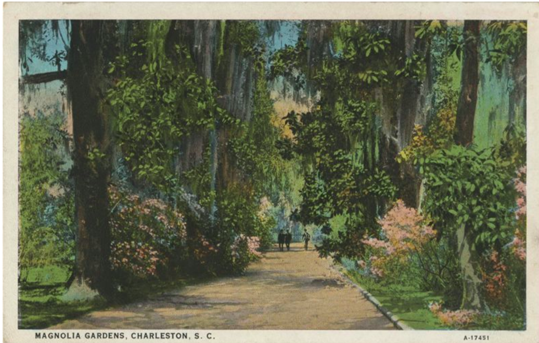
Figure 2. Postcard of Magnolia c. 1900-20, hand-colored postcard, approx. 3.5 x 5.5in. C.T. American Art.

Popular media amplified Magnolia's beautified image and promoted the estate as a spectacular wonderland for white tourists. Dramatic photographs of the site's Spanish moss-bearded trees and flower-flanked ponds graced several pages of the 1893 publication Art Work of Charleston . 17 The 1900 edition of Baedeker's Guide to the United States , then the premier travel publication, urged sightseers: "No one in the season (March-May) should omit to visit the...Gardens of Magnolia (reached by railway or steamer), on the Ashley, the chief glory of which is the gorgeous display of the azalea bushes, which are sometimes 15-20 ft. high and present huge masses of vivid and unbroken colouring." 18 In the early twentieth century, Detroit Publishing Company mass-produced and circulated colored postcards of the estate around the country to prospective visitors (figs. 1 and 2). The estate was even promoted as a glamorous destination in a 1938 Philadelphia Inquirer advertisement for Chesterfield Cigarettes featuring Metropolitan Opera star and Broadway actress Grace Moore (fig. 3). The cigarette advertisement in particular—which features the rosy-cheeked celebrity wearing an angelic white dress while reveling about the gardens in a scene of neo-Rococo exuberance—suggests the innocence, playfulness, and sentimentality with which white America approached Magnolia, and by extension, the institution of the plantation more generally. The modern phenomena of mass media, consumer culture,