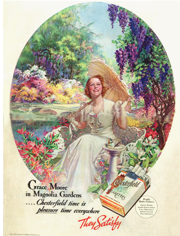
Figure 3. Advertisement featuring Magnolia. Chesterfield Cigarettes.

Magnolia's Black workers did inhabit the landscape, sometimes in ways invisible to whites. Scholars have uncovered the specialized practices the enslaved developed in order to negotiate landscapes of unfreedom, including passing down practical knowledge of plants, roots, and herbs 20 ; sharing strategies of terrestrial navigation and celestial wayfinding 21 ; creating hidden paths and hiding spots where covert activities could take place 22 ; and communicating in code on the "grapevine telegraph" by singing, marking trees, and mimicking animal calls. 23 Although Magnolia's workers were now free, the ever-present threats of Jim Crow laws and lynching bees, as well as the regular presence of white tourists, may have compelled them to adapt some of these clandestine