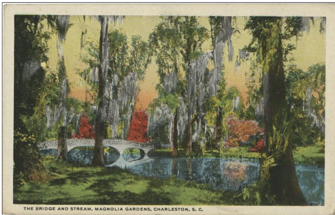
Figure 1. Postcard of Magnolia c. 1900-20, hand-colored postcard, approx. 3.5 x 5.5in. C.T. American Art.

on English estates as a reaction to the French formal garden that had long been in vogue with the European aristocracy. Unlike the rectilinear, symmetrical order of the jardin à la française (the exemplar of which is Versailles), the more “informal” and “natural” English country garden imitated an idyllic pastoral landscape. It typically consisted of rolling hills beset with groves of trees and decorative lakes or ponds, and some sort of Arcadian “set piece” like a temple, grotto, or recreated ruin. Over time, this style acquired more “gardenesque” elements like carpets of floral varieties, as well as orientalist features like ornamental pagodas. 16 The freed men and women tasked with translating this style to Magnolia beautified the plantation’s systemized rows of rice paddies into expansive, grassy lawns embellished with azaleas and camellias; created a constellation of winsome ponds adorned with little footbridges; laid a series of meandering paths bedecked with charming pergolas and trellises; and performed sundry other tasks that prepared the property into a space of recreation and leisure for white tourists. In so doing, these former slaves erased from the grounds and indeed from public imagination much of the evidence of their enslavement.