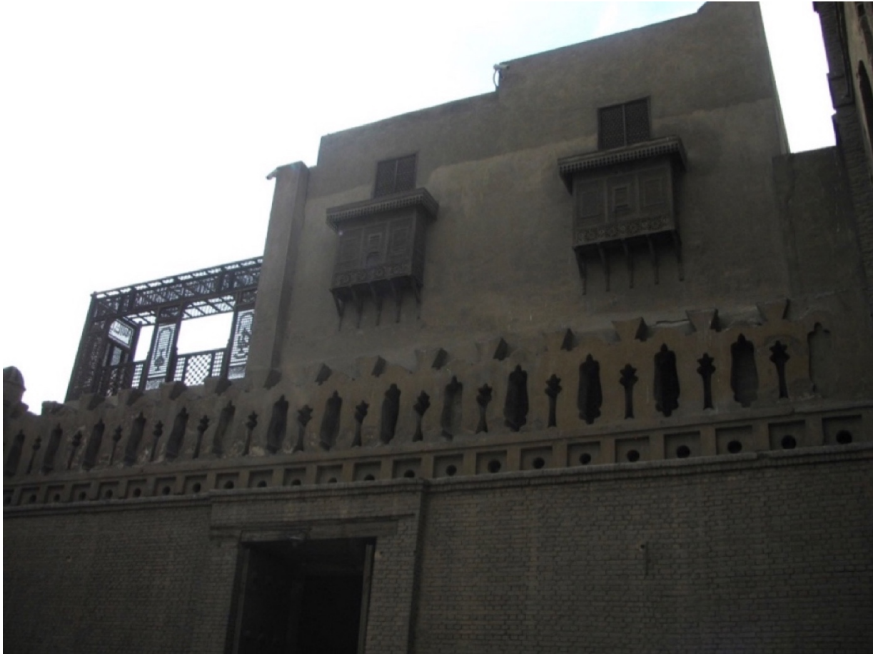
Figure 9. Manzil Kritliyya/Gayer-Anderson Museum. This is an example of a seventeenth-century house for an Ottoman notable, such as a bey or a pasha. The mosque directly abuts the Ibn Tulun Mosque (just south of number 15 on map, figure 2 and 7). Cairo, 2014.

people resisting the Public Works Department and its officials. But they also show that machines were useless without them.