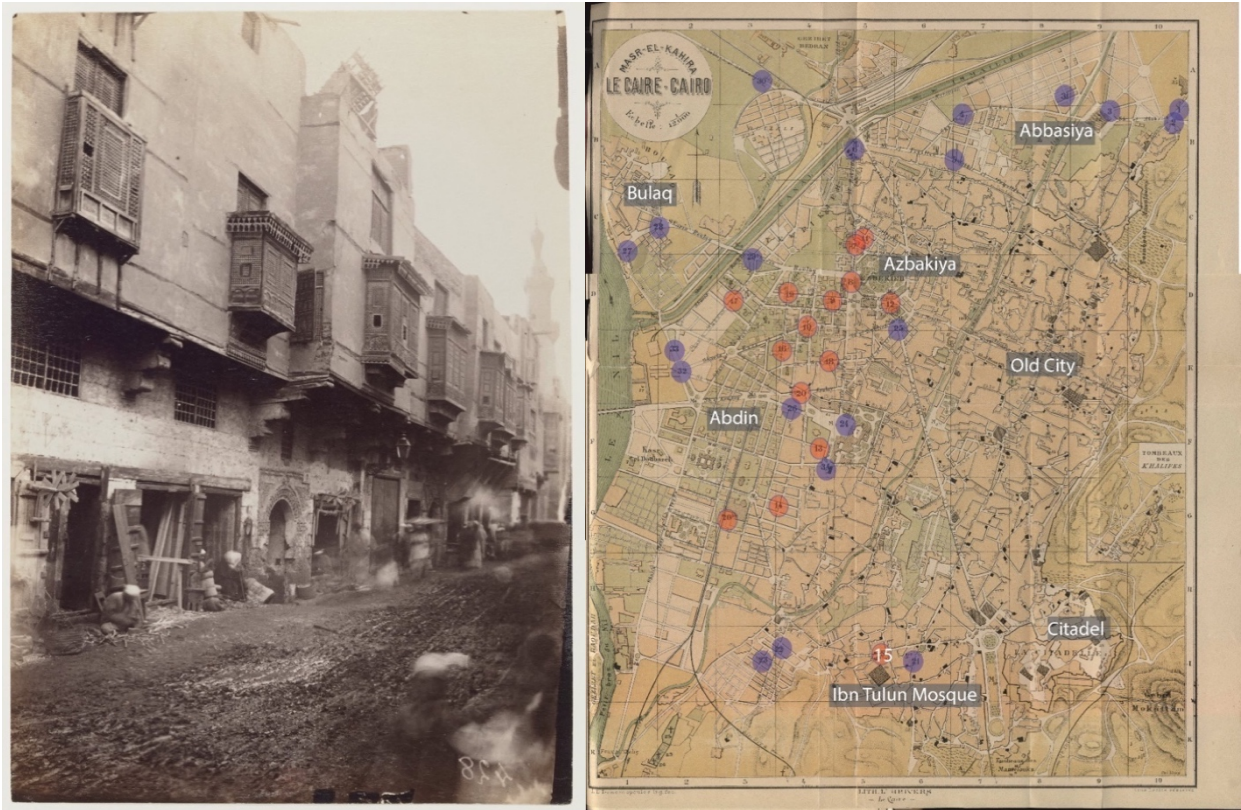
(left) Figure 6. This photograph shows a street in Old Cairo. Most people are blurry as they are moving, whereas the buildings are distinct. This was a limitation of photographic technology at the time. Beniamini Facchinelli, Strada Bab El Bahr , c. 1873.