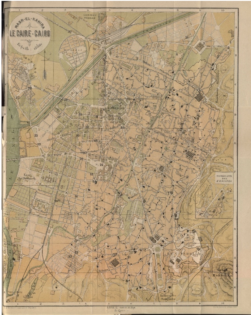
Figure 2. Map of Cairo, undated.