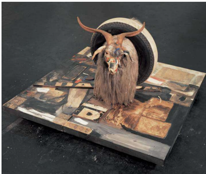
Figure 1: Robert Rauschenberg, Monogram (front view), 1955-59, mixed media, 42 x 64 x 62 ½ inches. Moderna Museet, Stockholm, Sweden.

When critic Leo Steinberg (1920 – 2001) invoked the phrase “the flatbed picture plane”—now synonymous with Rauschenberg’s work—he was describing the then-radical reorientation of a painting’s intended positionality: taking the painting down from where it hung (vertically) on the wall and laying it out horizontally. No longer was