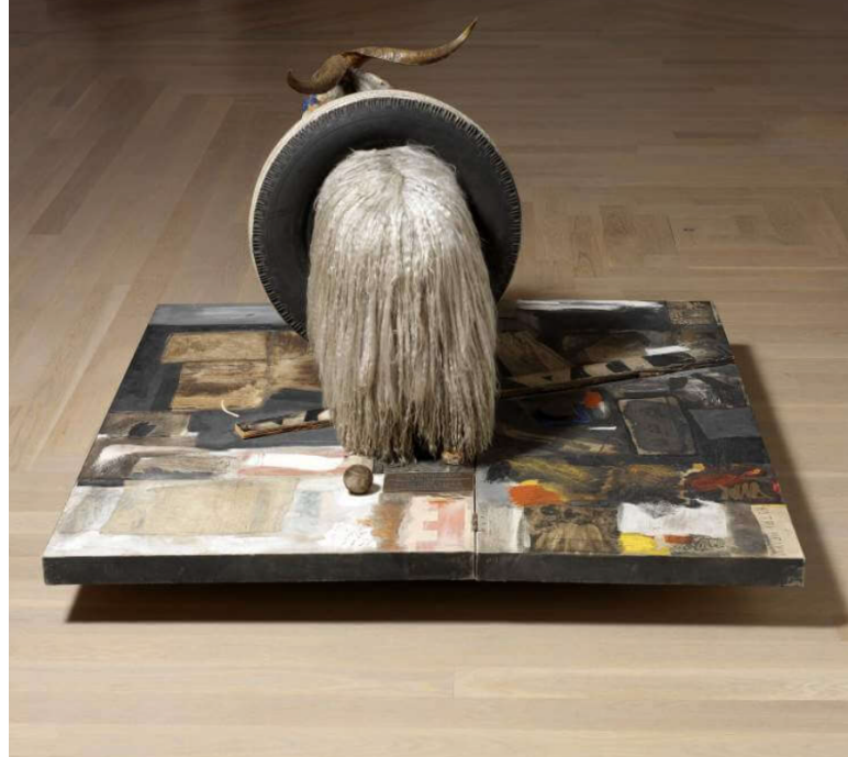
Figure 2: Robert Rauschenberg, Monogram (back view), 1955-59, mixed media, 42 x 64 x 62 ½ inches. Moderna Museet, Stockholm, Sweden.

This focus on mobility dictates that, if we are going to continue to mine Steinberg's overburdened reading, we do so in ways that come to bear on means of moving through and encountering the world; that is, ways that come to bear on the disabled mind-body. The first of these is to consider the flatbed picture plane as a compositional device directed toward the act of leveling. This function becomes clear when we consider the kinds of things