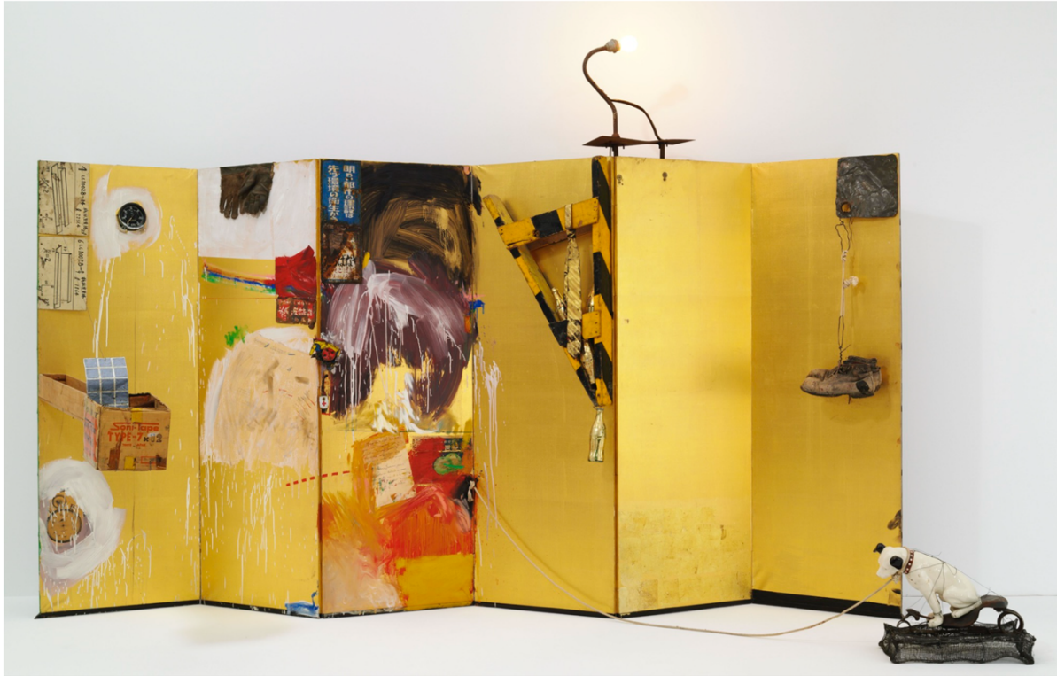
Figure 5: Robert Rauschenberg, Gold Standard (created during the 1964 performance 20 Questions to Bob Rauschenberg ), 1964, mixed media, 84 ¼ x 142 x 51 ¼ inches. The Glenstone Foundation.

and anti-American (even Communist). 30 Indeed, scholar of disability and deafness Lennard J. Davis firmly links the establishment of the norm with the rise of modern capitalism under industrialization and the solidification of the working body as laborer and producer. 31 Put simply: the norm as a psychophysical ideal grew out of this connection between expected bodily production and industry that enabled reliable supply and demand in an economy now dedicated to the profitability of war.