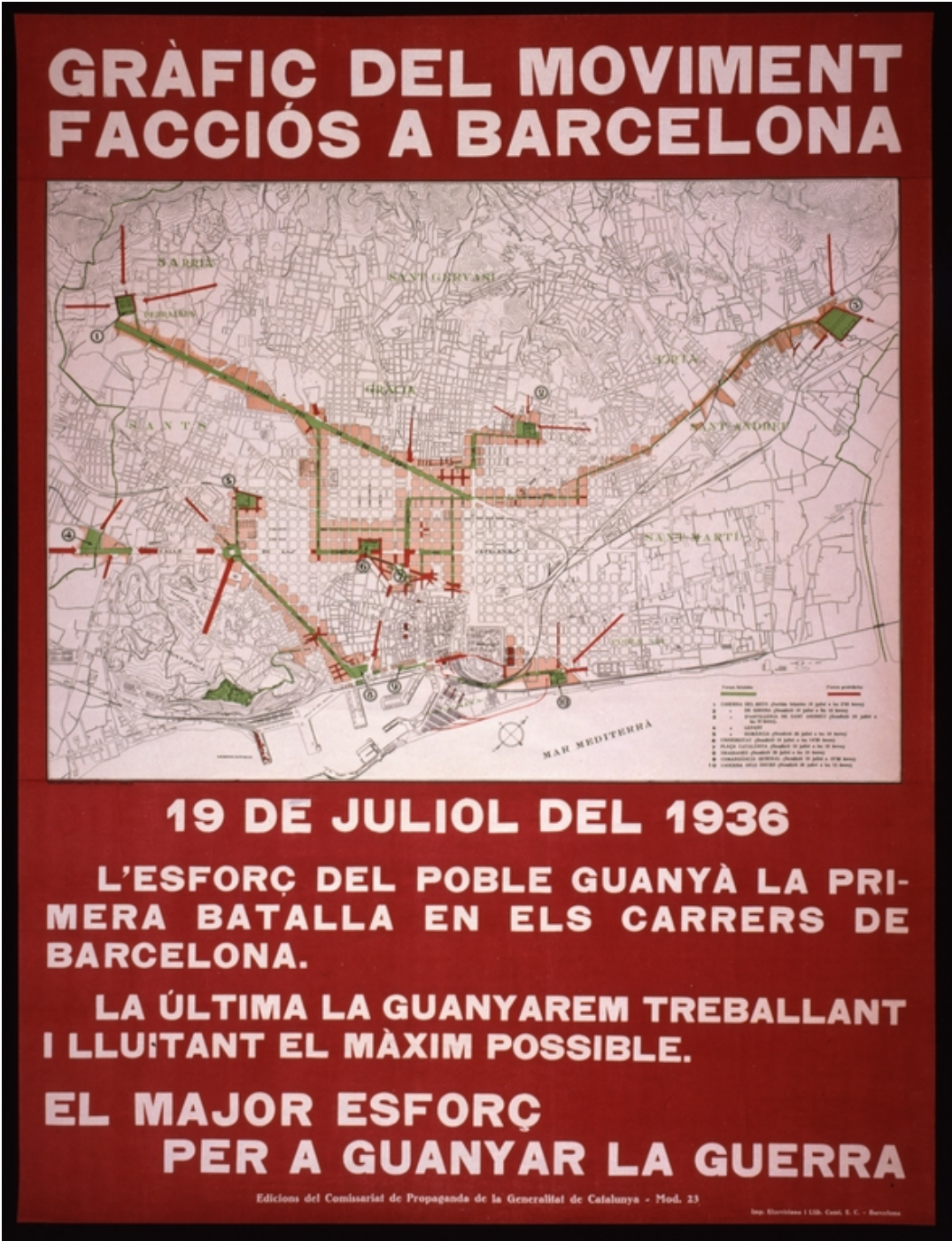
Figure 1: Gràfic del moviment facciós. 19 de juliol del 1936 (Diagram of the insurgent movement. July 19, 1936). This propagandistic map of Barcelona shows the military uprising and its repulsion by Republican-allied forces, predominantly the CNT-FAI. Red areas show forces feixistes (fascist forces, i.e. Nationalists) and green areas show forces proletòries (forces of the proletariat), with arrows indicating movement. Las Ramblas can be seen between (7) Plaça de Catalunya and the port. Note the upper and lower occupation of Las Ramblas by Nationalist forces and the density of the old city, particularly the Barri Gòtic to the east. Comissaria de Propaganda de la Generalitat de Catalunya, 1936.