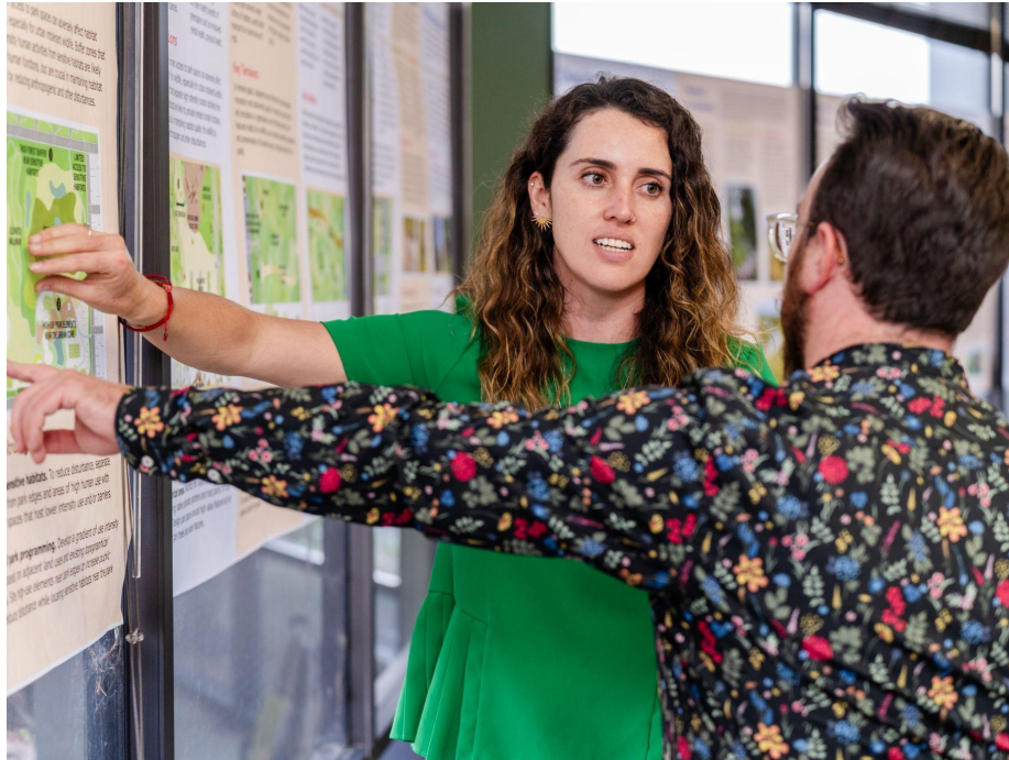
Figure 5: Salon attendees discussing the regional and city parks strategies presented by the Ecology for Health guide.