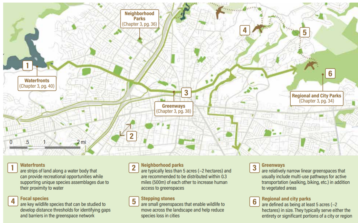
Figure 1: Key elements of a greenspace network may consist of continuous green corridors and distributed neighborhood parks that provide greenspace access to local communities and act as stepping stones for wildlife. Drawing Credit: Vanessa Lee (SFEI).

Planning for a connected greenspace network. Filling in gaps between poorly connected greenspaces by creating distributed neighborhood parks, greenways, and other habitat patches helps establish a connected greenspace network. Residents' access to greenspace is associated with improved mental and physical health, and aids wildlife in moving safely between patches (fig. 1). 2 Large habitat patches are associated with higher rates of recreation and health benefits and also offer the most significant wildlife benefits, especially for species sensitive to urban impacts. However, a few large