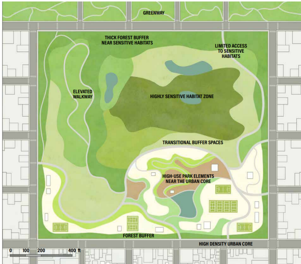
Figure 2: An example of regional and city parks that demonstrate a gradient of use intensity in park areas based on adjacent access, land uses, and existing landscape features. Drawing Credit: Vanessa Lee (SFEI).

patches, as opposed to small, dispersed patches, limit access to those who can afford to live near them and may be more likely to contribute to green gentrification. 3 When resources are limited, planning for greenspaces to be distributed throughout the city can create habitat stepping stones for wildlife and provide recreation access to more residents.