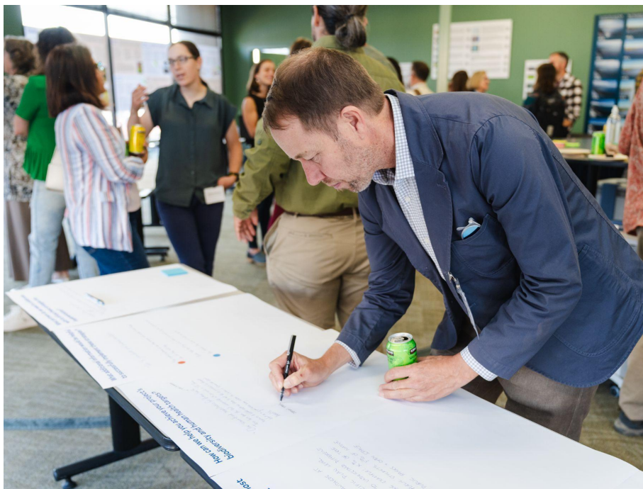
Figure 6: A salon attendee providing thoughts on a feedback board related to how the Ecology for Health team can help support projects in achieving biodiversity and human health goals.