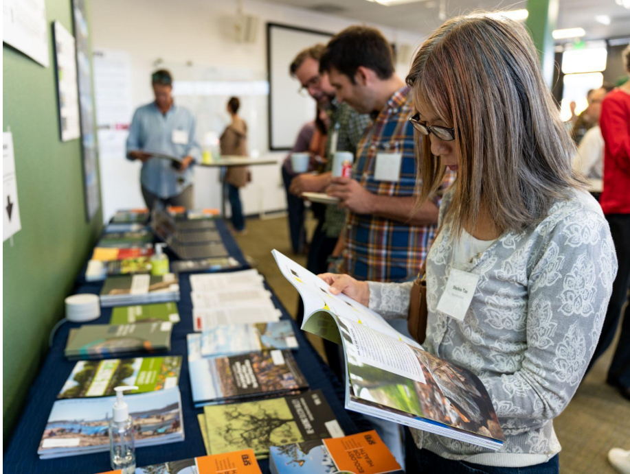
Figure 7: Salon attendees reading other SFEI publications related to urban ecological and resilience planning and design.

Salon attendees identified two primary ways in which they intend to use the design guide. First, they plan to incorporate the planning and design strategies into their ongoing and future urban greening projects. This includes addressing design trade-offs between health and biodiversity support, as well as exploring the human health benefits associated with open space and green infrastructure design. Second, they aim to reference the human health and biodiversity benefits identified in the guide when communicating the benefits of urban greening efforts, particularly tree planting and open space design, to their stakeholders and/or clients.