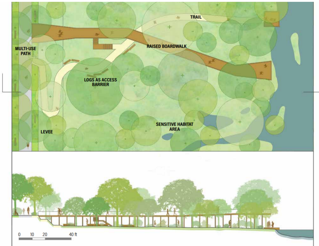
Figure 4: A typical site design of urban waterfronts, showing multi-use trails at habitat edges to preserve sensitive habitat zones with limited human trail access. Drawing Credit: Vanessa Lee (SFEI).