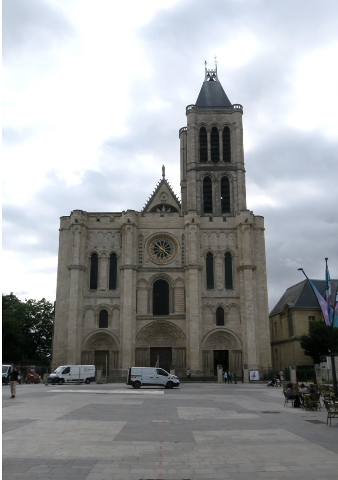
Figure 1. West façade of the Basilica of Saint-Denis, north of Paris, France.

objects new meanings today. 3 What about those objects that are not present at all? How do vanished or deteriorated objects challenge disciplinary boundaries? How do they push against common methodologies?