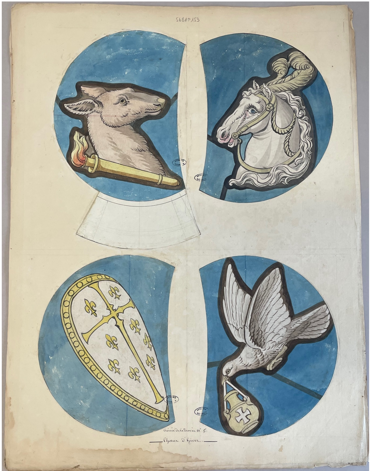
Figure 6. François Debret, ornamental designs for a crossing in the bay of the Winter Choir, 19th century (undated).