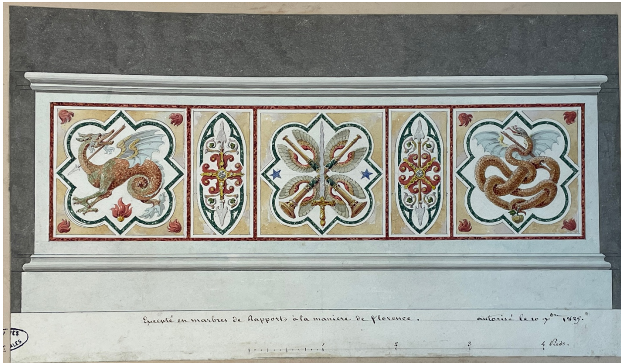
Figure 5. François Debret, ornamentation “executed in marble in the Florentine style” for Saint-Denis, 1829.

Saint-Denis’s historic imprint was critical to the project of restoration. In other words, the extrait was critical to the architect’s conceptual reconstruction of the site. It evoked the spirit of what had been lost long of the site context before the Revolution stripped the basilica down to its frame. The document expresses the inherent ephemerality of the city in the longue durée of history.