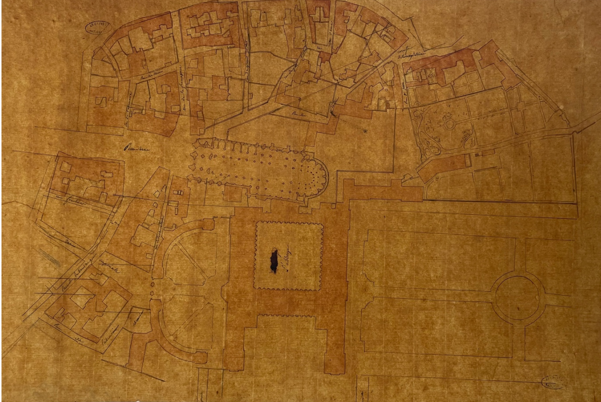
Figure 3 (above). François Debret, site plan of the Abbey of Saint-Denis, 19th century (undated).