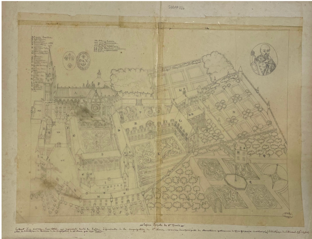
Figure 2. François Debret, Church of Saint-Denis , 19th century copy of 17th century engraving. Inscription below by Debret: “Copy of an untitled work that represents all of the dependent churches of the Congregation of Saint Maur. This work was to be part of the Monasticum gallicanum by Dom [Michel] Germain [...]” (translation by Taylor Van Doorne).