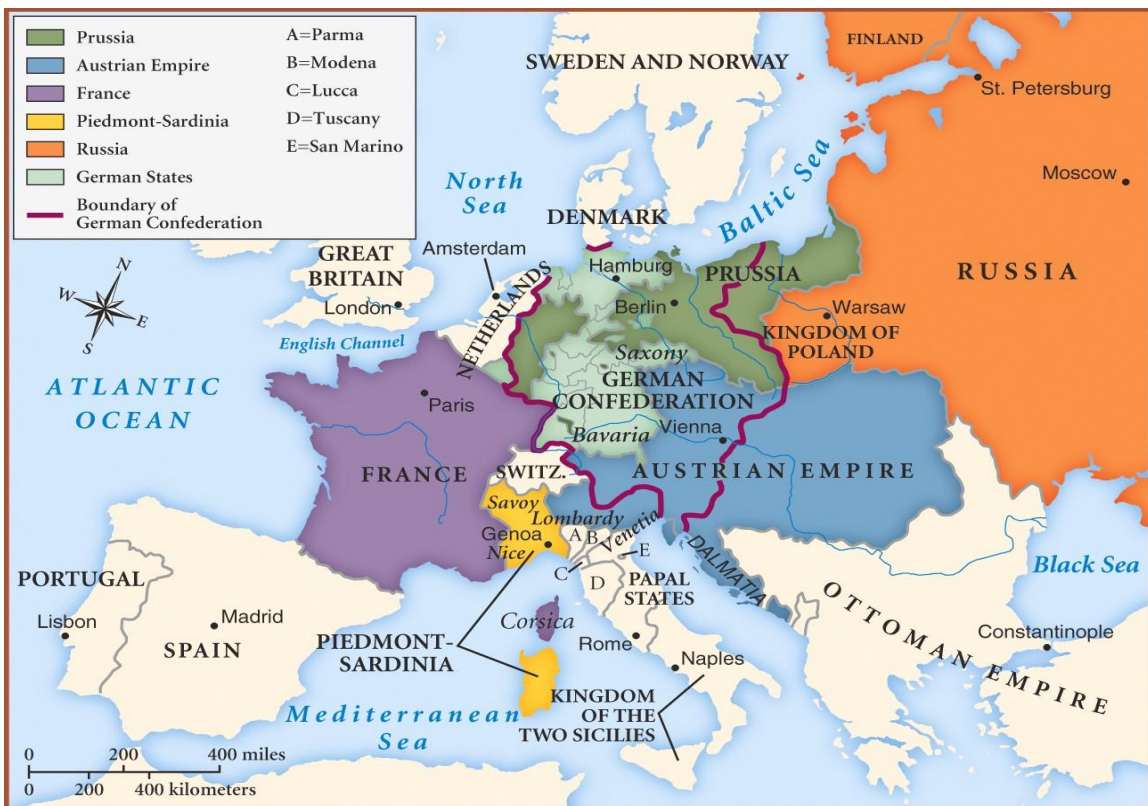
Figure 2: The map of Europe that was agreed at the Congress of Vienna in 1815, and remained the political map with slight modification until 1848.

This speech demonstrates that Frederick William was not willing to budge on any constitutional possibility Prussia may have in the future. Frederick William also dictated to the United Diet that they should resist all forms of liberalism because they represented the different estates of the kingdom, the aristocracy, the bourgeoisie, and the peasantry, not to people as a whole; and to give into liberal ideas was un-Germanic. 25 This is the point at which the liberals identified that Frederick William had no intention of any constitutional compromise, where any form of progress would have to be accomplished without the help of the king. Frederick William's opposition marks a point when real opposition to the king and his government started to solidify. The liberals just needed a way to funnel societal unrest toward the monarchy—this outlet was not difficult to discover.