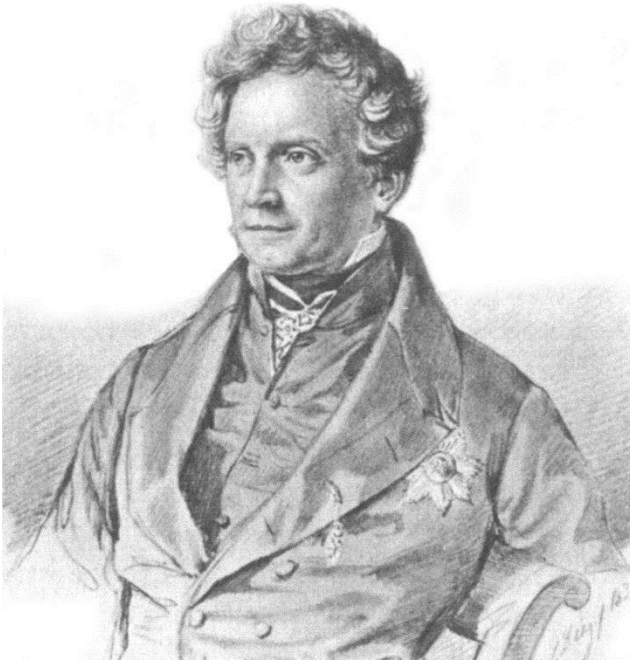
Figure 4: Karl August Varnhagen von Ense

When the news reached Berlin that Metternich had stepped down and fled from Vienna, jubilation engulfed the liberals. Varnhagen von Ense, in a March 15 diary entry, claimed that he “was quite shocked at home. After the Count came to me to tell me he was in Vienna and Metternich’s dismissal is required, but with one shot of grapeshot the military seemed champion, but they feared the suburbs.” 41 Varnhagen von Ense was very surprised to hear that the people of Austria had called for the resignation of Metternich, an action that appeared to be remotely unlikely. It was not until the following day, March 16 that Berlin had received credible reports that Metternich indeed did resign and fled Vienna because of the revolution on March 13. 42 The diary entry for March 16, Varnhagen von Ense writes “that Vienna was in flames, Metternich’s palace is destroyed, the Kaiser has abdicated, the students stormed the arsenal, the citizens are armed, [and] the military is beaten.” 43 Frederick William took the news of Metternich’s fall from power and the state of revolution in Vienna as a bad omen and decided to allow for some political concessions. 44