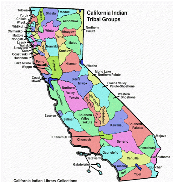
California Indian Library Collections Figure 1. Native American Tribes in California. Source: California Indian Library Collections.