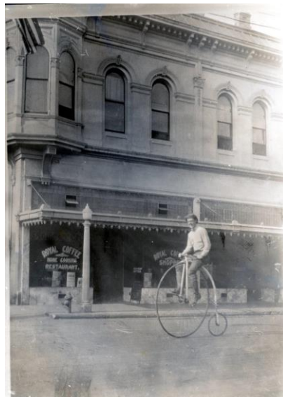
Figure 3. Man on High Wheeler.

In the 1890s, Merced newspapers presented topics centered around new uses of the bicycle. Individuals viewed the bicycle as a means to address various transportation uses, such as military defense. Soldiers would ride into battle peddling or dismounting from these bicycles and then engage in combat. Thinking about this today might sound out of the question, but at the time the bicycle was the fastest personal machine. It required little maintenance and no fuel. Horses on the other hand required grooming, equipment, hay, and water. Furthermore, the Merced Evening Sun stated, "it has been estimated that the expense of mounting a cavalryman is $225 a year while it is only $15 for the cyclist." 9 This