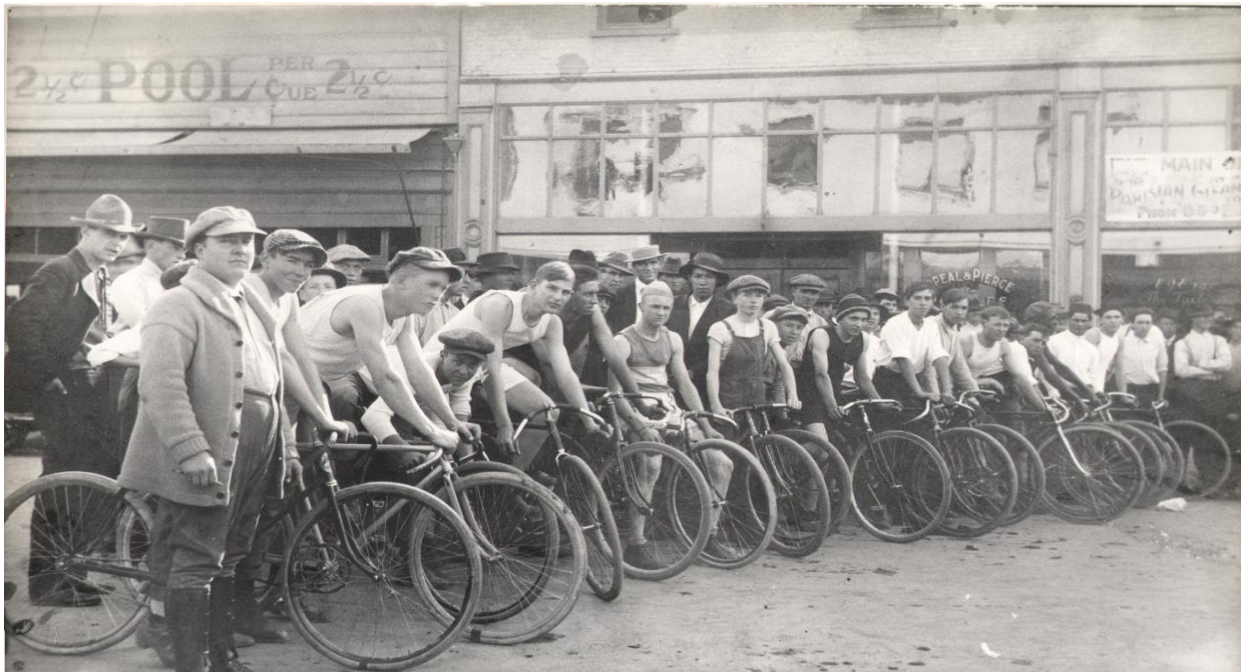
Figure 7. Young men taking part in bike race, 1900.

Cycling was a sport where people earned a significant amount of money and had fun doing so. When put into perspective, a national champion was making almost twice what a normal worker in a year's work, in one day. It is no wonder why it became appealing to young men. The financial possibilities fueled the need for speed for Merced's residents.