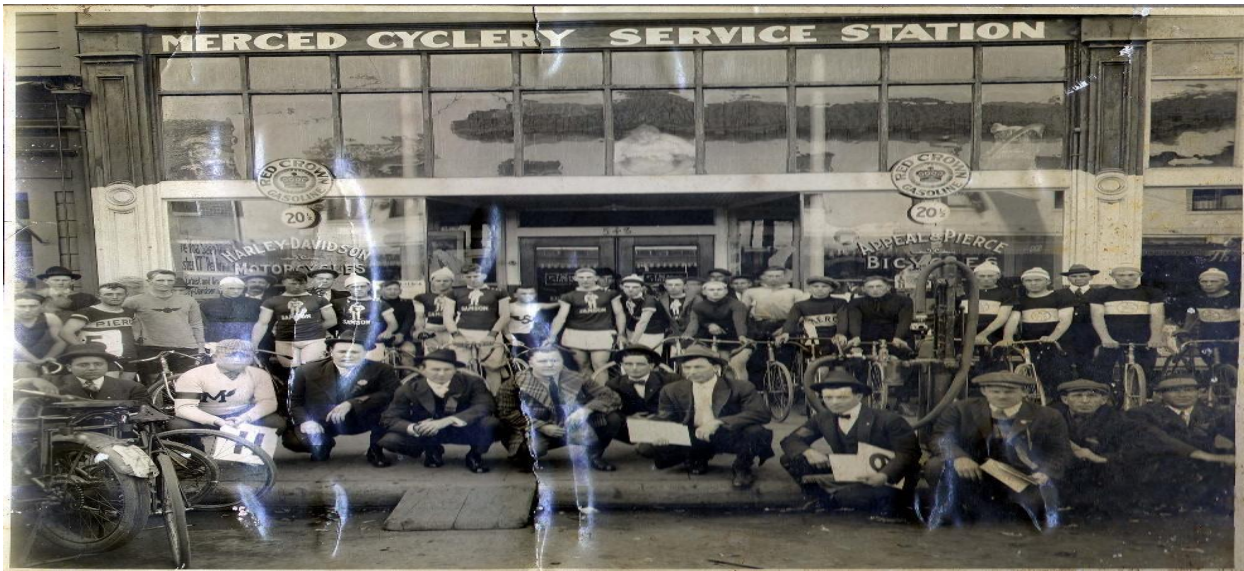
Figure 5. Portrait of Race Participants.

the background are all holding bicycles. Putting two and two together, we can infer that this was an event, and the photograph was taken before or after a bicycle race.