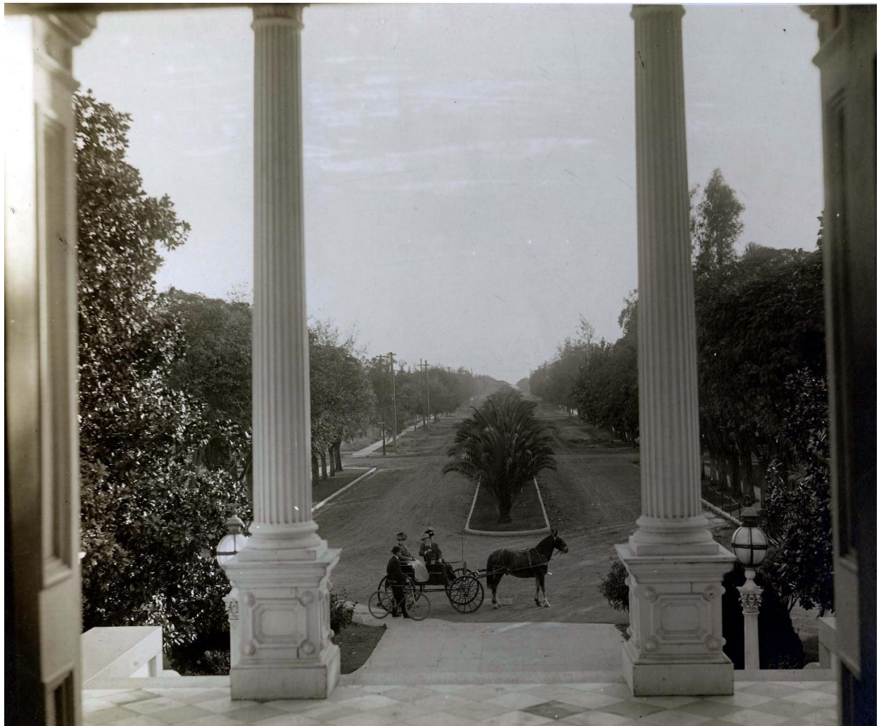
Figure 1. Conversation between Buggy and Cyclist, 1900.