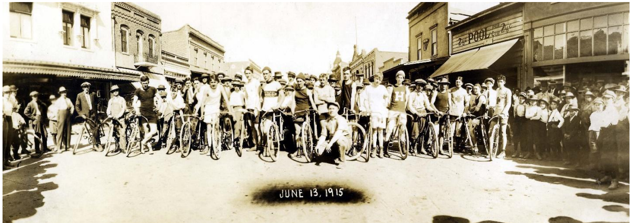
Figure 6. Race Start line; June 13, 1916.

Due to cycling's growing popularity in the city, bicycle races became common in Merced. Newspaper articles commented on the races and the prodigious lap times Merced's young men completed. Both the Merced County Sun and the Evening Sun reported "Mercedites make fast time in bike races; Merced's cyclists made a splendid showing of speed in the bicycle race run over the Lake Yosemite course of 15 ½ miles yesterday afternoon, winning the first three places against entries from Stockton, Modesto, Madera and Fresno." 13 These stores and clubs were located in the center of town. With races happening on Main Street, they became the forefront of daily life. People who strolled downtown or passed by these buildings on their way to work would see these machines often. Bicycling in this era must have been a common part of discussion in Merced. My assumption comes from the starting line pictures, such as the one