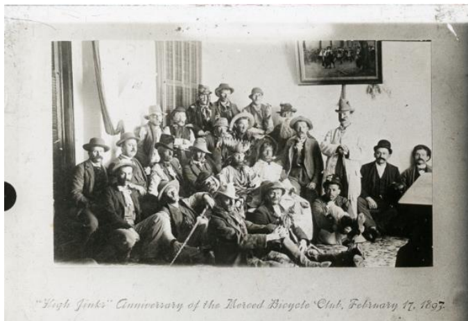
Figure 4. Men in Costumes, High Jinks Anniversary of the Merced Bicycle Club, Feb. 17, 1893.

Cycling became a large part of daily life in Merced. However, owning a bicycle was not cheap. Seeing someone on a bicycle during this period is the equivalent to seeing an electric car today; it is a spectacle that will be talked about long after the machine has passed you by. The bicycle craze reached Merced in 1890. Two years later, Merced had its very own Bicycle Club. It was founded on February 17, 1892 and named appropriately the Merced Bicycle Club. It joined the various organizations that took part in Merced's social order and held many organized social events. The Merced Bicycle club appeared to be a man only club of passionate peddlers. They were founded during the bicycle craze and promoted the new past time. Although there are no meeting minutes to properly document their actions, we can assume that they would meet every so often and bike around town.