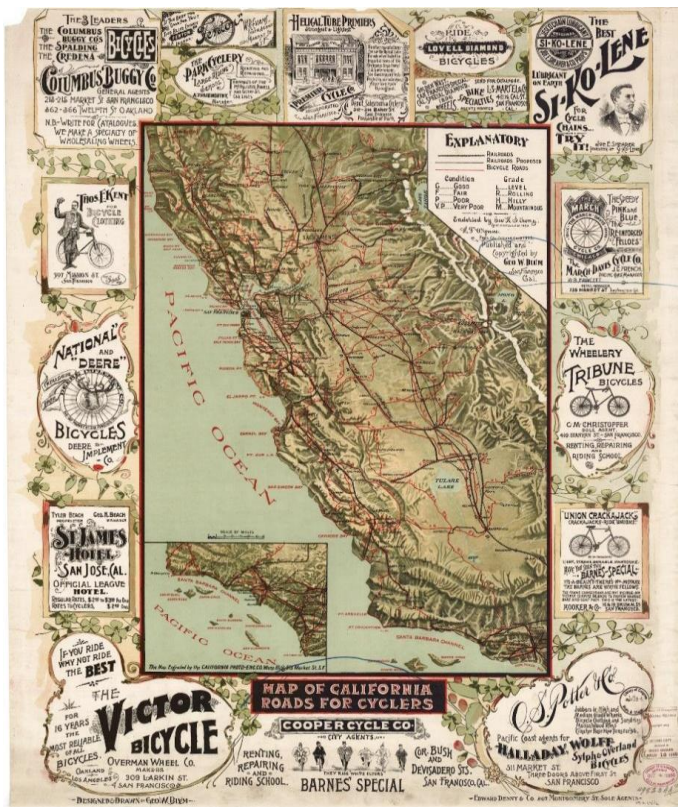
Figure 2. "Map of California Roads for Cyclers," George W. Blum.

California is coming to the front with a new discovery—the kerosene road. In many ways it is considered superior to the stone roads on the Pacific coast, and it is rapidly replacing macadam. Most of the Californian earth roads are made of sand or gravel, which contain excellent cementing materials in the shape of admixtures of loam, clay or iron ores. These roads are much smoother and more pleasant to and they are not so likely to raise the dust. 7