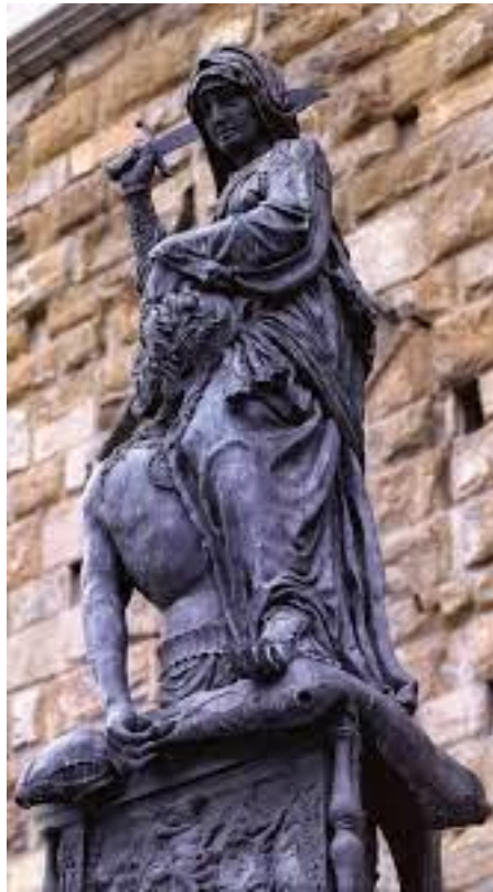
Fig. 6 Judith and Holofernes (1455)

Donatello's depiction of Judith emphasises her as a seductress, and temptress, although exhibiting masculine aspects. Despite Judith still holding power as she yields a knife above Holofernes head, women in Italy during the time did not have the same kind of social and political conviction as the Judith depicted by Donatello. Instead, the statue stood as a reminder of women's power, and the need for men to control it. 25 Besides portrayals of Judith being sexualized, she was also made to look disgusted and passive to the situation; this is evident in Caravaggio's interpretation of the story. Caravaggio's Judith Beheading Holofernes (1589-99), made the violent image more tame as Judith stood to the side of the painting, appearing to be young and distressed by the situation. 26 This is evident through her