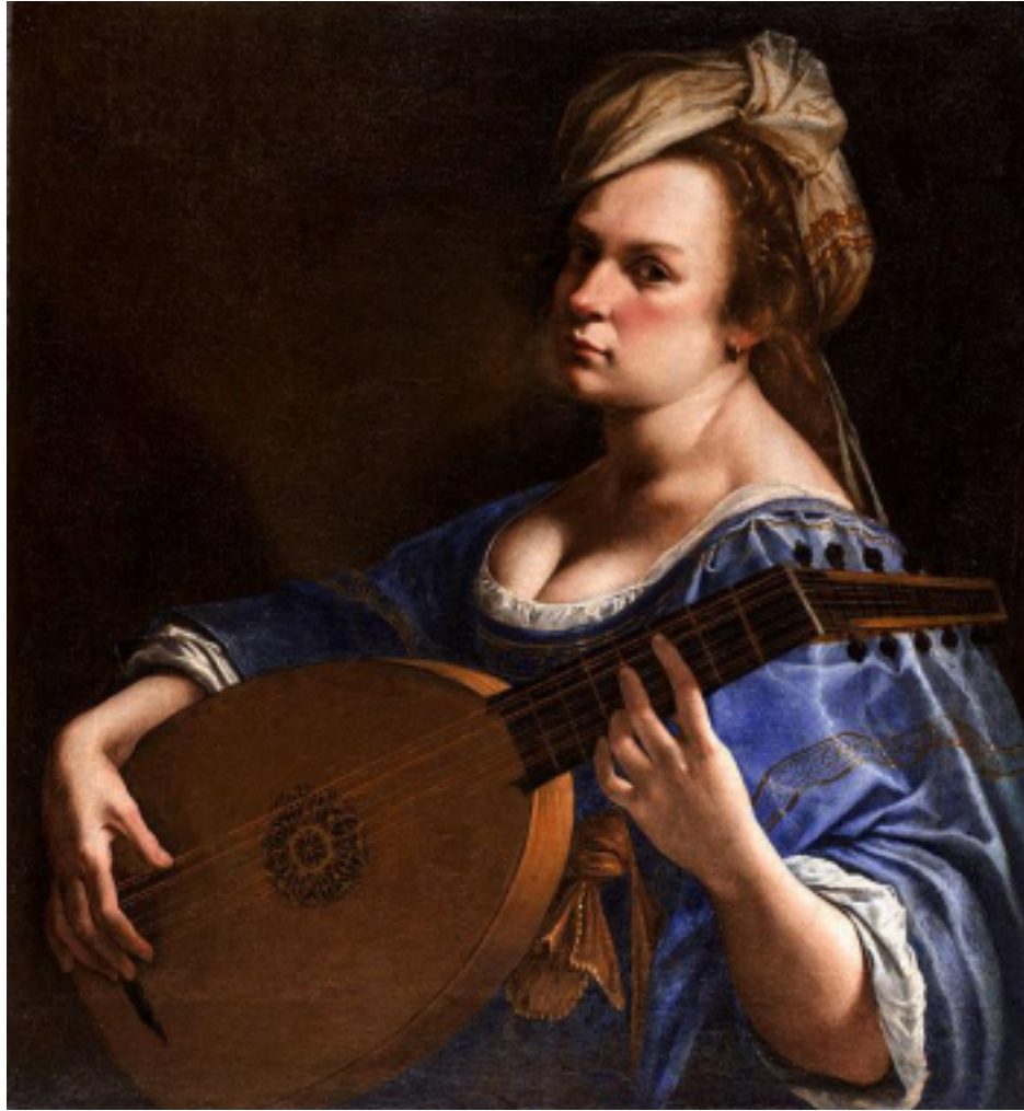
Fig. 9 Self Portrait as a Lute Player

mirrors the portrait of Michelangelo, from 1520. 36 The connotations held by the painting express ideas of female identity, as well as artistic status. The incorporation of a variety of female experiences and identities provides ideological depth to the painting. 37