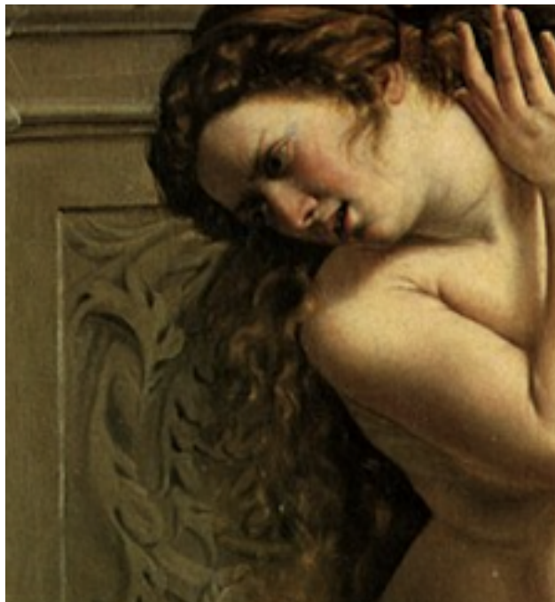
Fig. 5 Susanna and the Elders (1610) detail

Artemisia is able to portray women in a heightened realistic sense, since sexual attraction is inherent, even in women who say no. Portraying one of the male assailants as young, she is able to amplify Susanna as virtuous and heroic by refusing sexual acts to protect her honor and refusing to succumb to sexual attraction. 19 Artemisia reinvents Susanna as a real woman, one with sexual desires, limitations and virtues. This depiction of Susanna also examines women's sexuality and sexual identity. Visually, the contrast of Susanna's loose curls, and the tightly confined foliage relief coiffure behind her head, further illuminates the social hypocrisy of being a woman. 20 A woman is meant to feel shame for her beauty and sexuality until it is made legitimate by being given to, or taken by, a man. 21