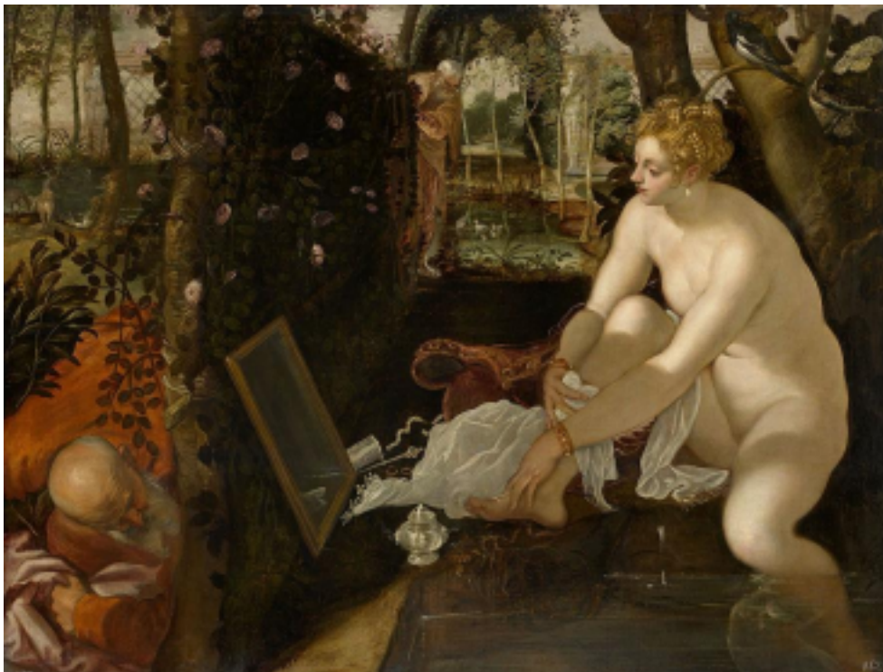
Fig. 3 Susanna and the Elders (1555)

two elderly men. The men blackmail her, and demand her to perform sexual acts with them, and if she refuses, they will accuse her of adultery, forcing her to be stoned to death even if she did not commit illegal acts. The story, although incredibly disturbing, was often depicted in sexual and playful ways. This is evident in Tintoretto's depiction of the story in Susanna and the Elders (1555). 15