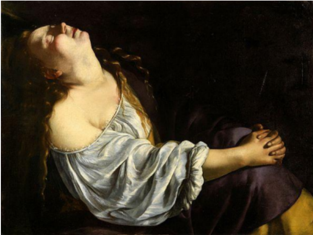
Fig. 11 Mary Magdalene in Ecstasy (1623)

Caravaggio's Magdalene sits with her head tilted downward, only exposing her profile to the viewer. This kind of slow, passive and withdrawn depiction of Mary Magdalene was common during this time. However, Gentileschi's Mary Magdalene in Ecstasy (1623) shows the female figure in full action, she is passionate and in movement, becoming an active figure against a deep shadowed background. Similar to Gentileschi, Mary Magdalene is a figure very defined by her sexualized past, making many depictions of her being passive more digestible to viewers.