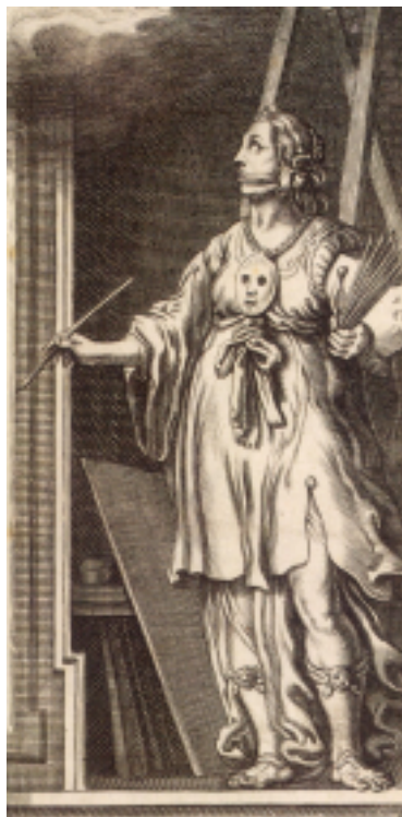
Fig. 1 Allegory of Painting

At the time, women in paintings were accepted as erotic figures, and critiqued if they were characters with power. Gentileschi participated in the shifting of these commonly consumed women, and reinvented female characters who were dissociated with their stories of action, and more commonly equated to figures of pleasure. This is attainable in Gentileschi’s Self Portrait as the Allegory of Painting (1638-39).