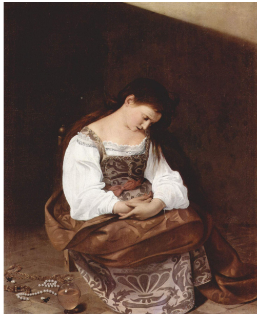
Fig. 10 Penitent Magdalene

The ideas presented by her Lute Player are also tangible within her Mary Magdalenes. One of Gentileschi’s most infamous Magdalenes is her Mary Magdalene in Ecstasy (1623). 39 Mary Magdalene is a female biblical figure outlined frequently in European art. Usually she is penitent, which can be seen in Caravaggio's Penitent Magdalene (1594-1595). 40