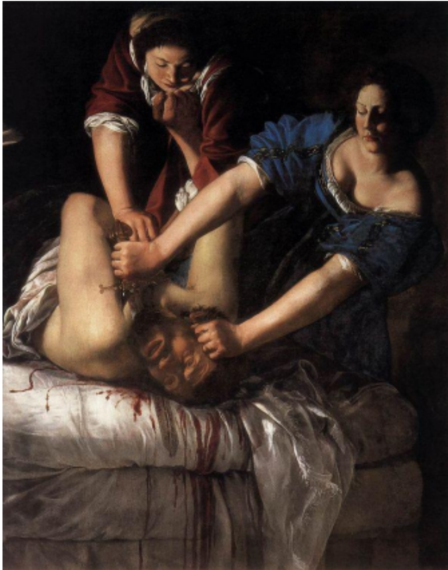
Fig. 8 Judith Slaying Holofernes (1612-1613)

The common trope of the domineering mistress and the sexualization of this theme breaks by the strength expressed by the two biblical figures within Gentileschi's painting. As her handmaid holds down the victim, her sleeves rolled up as blood spews from Holofernes' neck. Both of the women look down, focused on completing the heroic task, there is a dramatic composition as all the characters are central in the piece. Baroque art held the common characteristic of holding momentary qualities, paintings captured fictional