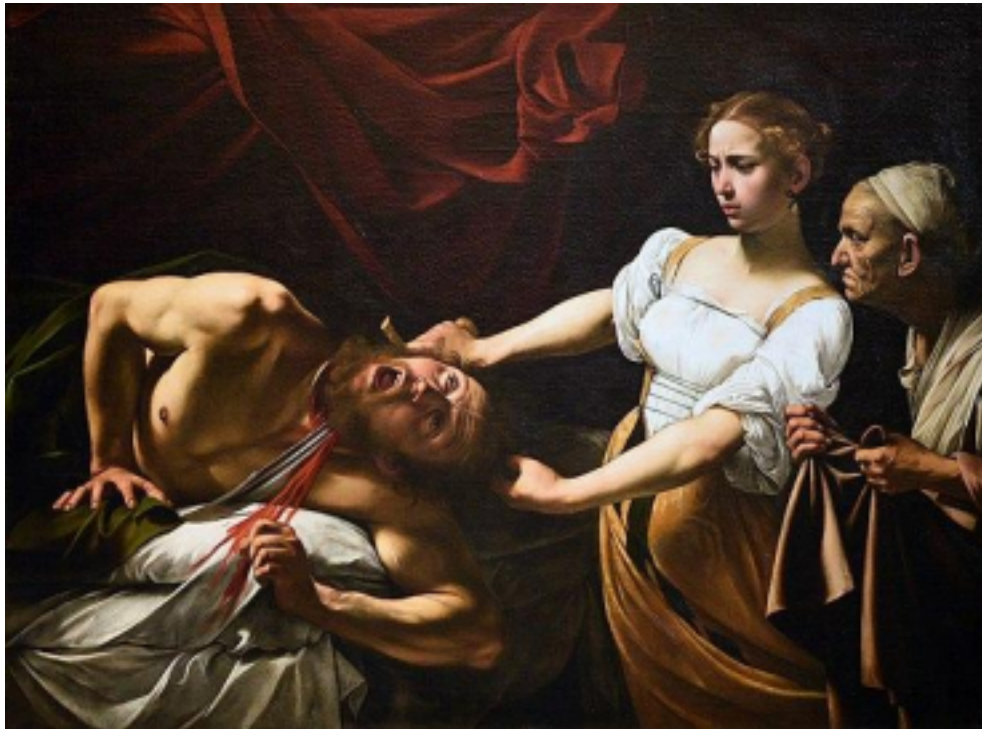
Fig. 7 Judith Beheading Holofernes (1589-99)

facial expressions of disgust as well as her detached stance within the scene. Holofernes remains in the center of the painting, while Judith and her handmaid take a passive stance to the situation.