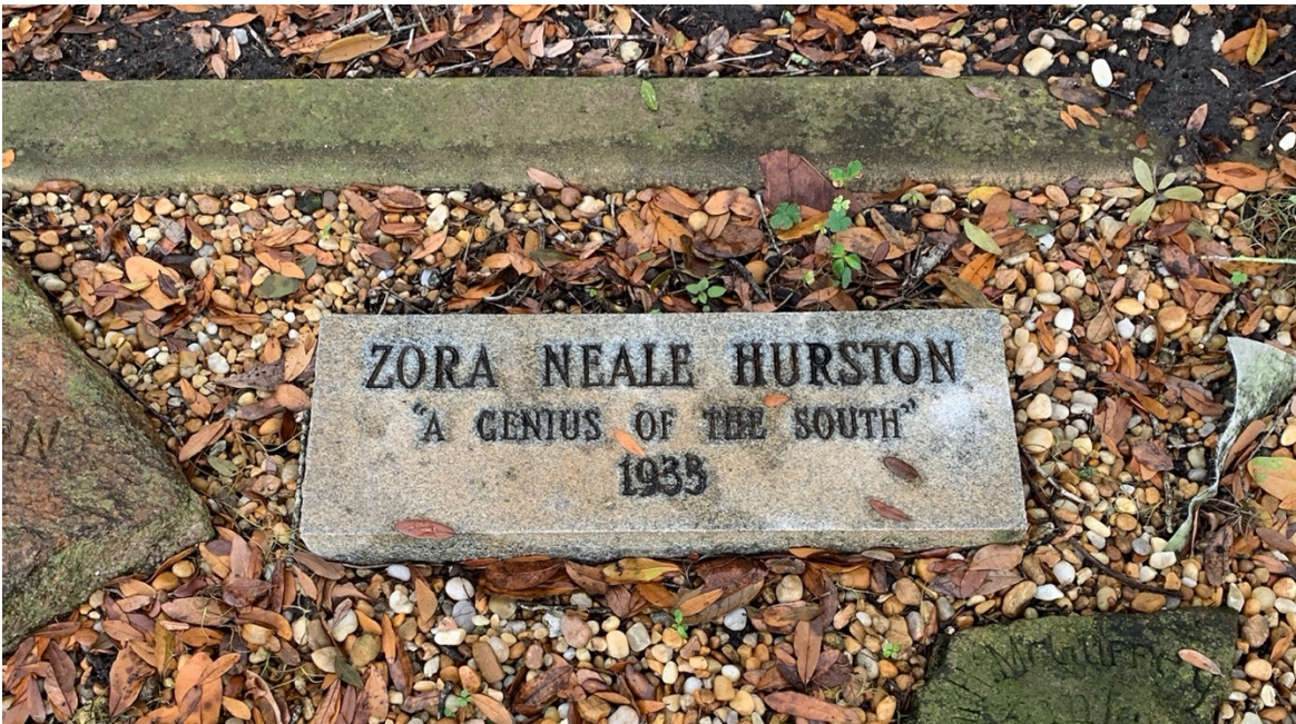
Figure 3. Memorial stone, Rollins College

Although you were subject to erasure and your work was pushed into obscurity, I am inspired to join efforts in anthropology to preserve your legacy. I will be leaving the Winter Park area upon graduation, but I have developed a deep affinity for this area. I have been here for four years, only to learn in my final semester how close you have been to me all along. While I studied late hours in the Olin Library, your work and life were preserved right below me in the archives. While I took classes at the Hannibal Square Heritage Center, your story was enshrined in the exhibit, your soul's mission scaffolding the building. While I walked the brick paths of our campus, I would pass the stone honoring your memory countless times, never realizing it until now (Figure 3). But I met you for the first time, Ms. Hurston, on a walking tour of Eatonville. That day I walked the paths that separate majority-white Maitland from historically Black Eatonville and entered your home, a place that nurtured your strength and talent.