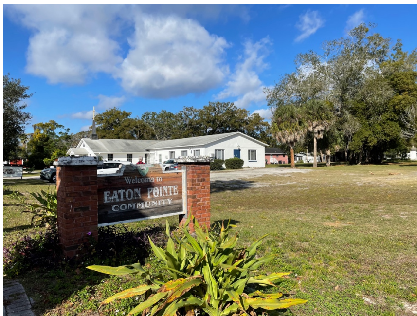
Figure 2. Center of Eatonville, February 2021