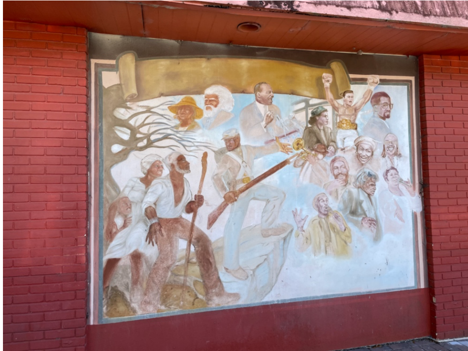
Figure 5. Zora Neale Hurston honored among powerful Black figures. Downtown Eatonville.

I realized how close you are to me only after visiting the Rollins Archives. Your legacy directly touched me when I learned about your work with the school to get students engaged with Black folklore through theater. The archival record at the school values your commitment to supporting the liberal arts, too. In our class, we pondered why we had not heard about the theatrical performances you directed here in the 1930s. We were inspired to ask the theater department if they would ever bring back your plays again, to continue to spread your work to a greater audience. I hope you think fondly of the memories and relationships you made at Rollins. Beyond Rollins, I'm encouraged by the efforts of young anthropologists to preserve your legacy as a founding figure of American anthropology, and I hope to do the same by sharing your life and stories with my peers.