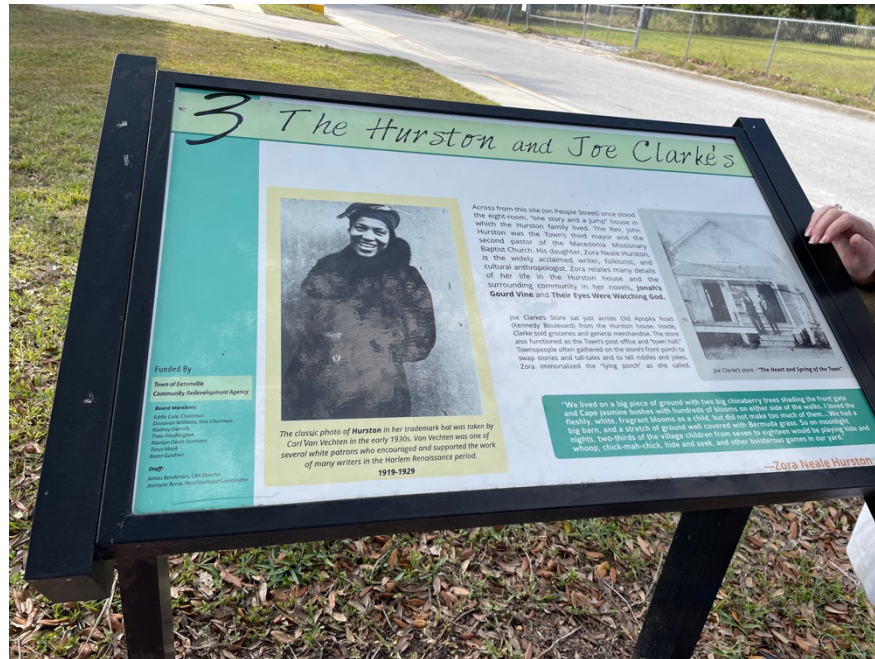
Figure 4. Hurston home historical marker, Eatonville