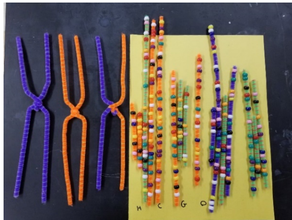
Figure 1. Pipe cleaners used to model chromosomes with textured pony beads representing alleles.

There are many options for including more accessible activities in the genetics and variation modules of this course, some of which require only minor adjustments. A DNA Twist model (along with genetics simulations/models), available through the American Printing House for the Blind (APH; https://www.aph.org ), demonstrates the structure of the DNA molecule through the use of contrasting textures to convey base-pairing rules. BLV students can also easily participate in demonstrations of DNA extraction from cheek cells by using talking measuring equipment and a talking liquid level indicator to measure the alcohol, soap, and salt required in the procedure; students can then touch the resulting DNA. Mendelian traits can be observed through touch and recorded using raised-line Punnett squares or Braille-labeled tiles. Instructors can also use karyotypes pre-made from pipe cleaners and textured beads. These models allow students to compare the karyotypes of evolutionarily related species based on relative spacing of the alleles (i.e., beads), while centromere position can help demonstrate crossing-over and recombination (Figure 1). Additionally, exercises involving simulations for natural selection, gene flow, genetic drift, and mutations are accessible with the addition of differently textured, shaped, or sized objects to sort, count, and manipulate. Specific examples and links to useful AT/MAT can be found in the resources folder linked above.