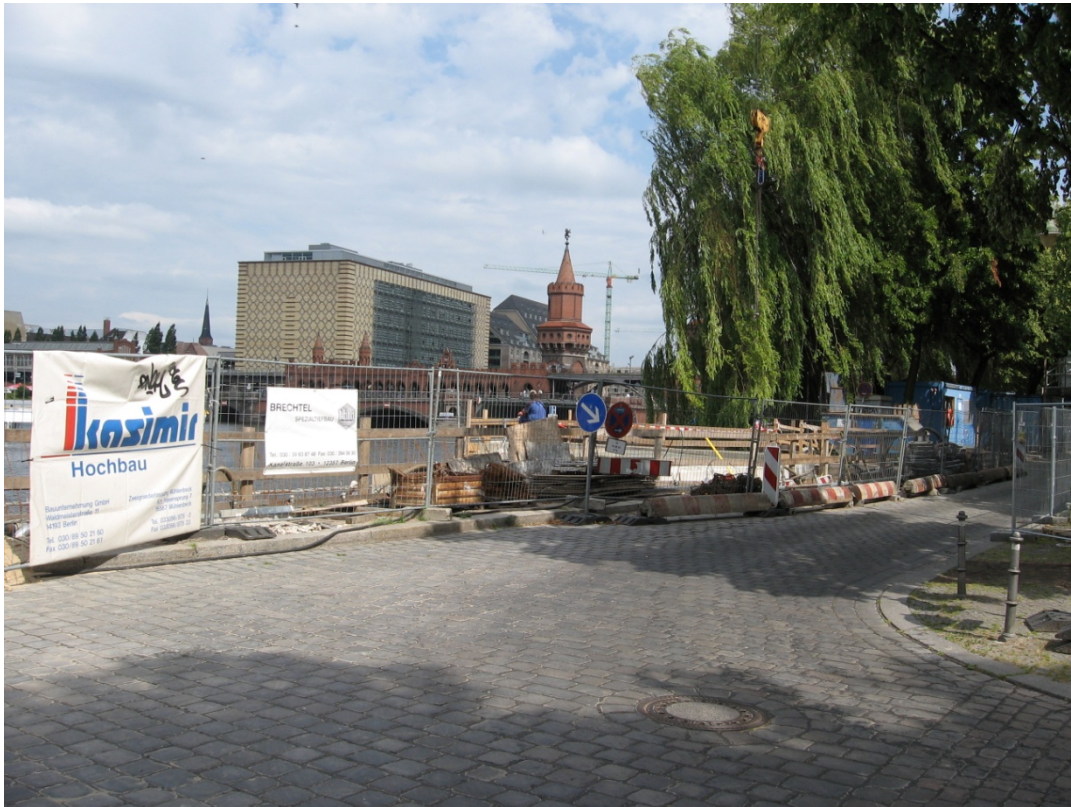
Figure 8: Gröbenufer (now May-Ayim-Ufer), Berlin (2009).

removed at some point in the ensuing two decades, the remaining marker appeared to offer a generic tribute to the Wall's victims, much as the tomb of an unknown soldier honors the collective sacrifice of a nation's war dead (Anderson 9–10). Yet I would argue that this fragment deflected past events at least as much as it commemorated them. The emphasis on an “unknown” victim was particularly curious given the likelihood that most—although perhaps not all—of the people who died near the