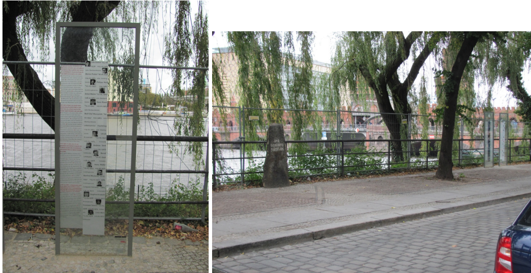
Figure 10: Documenting Wall Victims on Both Sides of the Spree, Berlin (October 2011).

Turkish (post-)migrant experience in the past, present, and possible future. Despite and even because of the oblique nature of its remembrance, then, the play delivers an aesthetically compelling perspective on the city's braided histories of division and mobility.