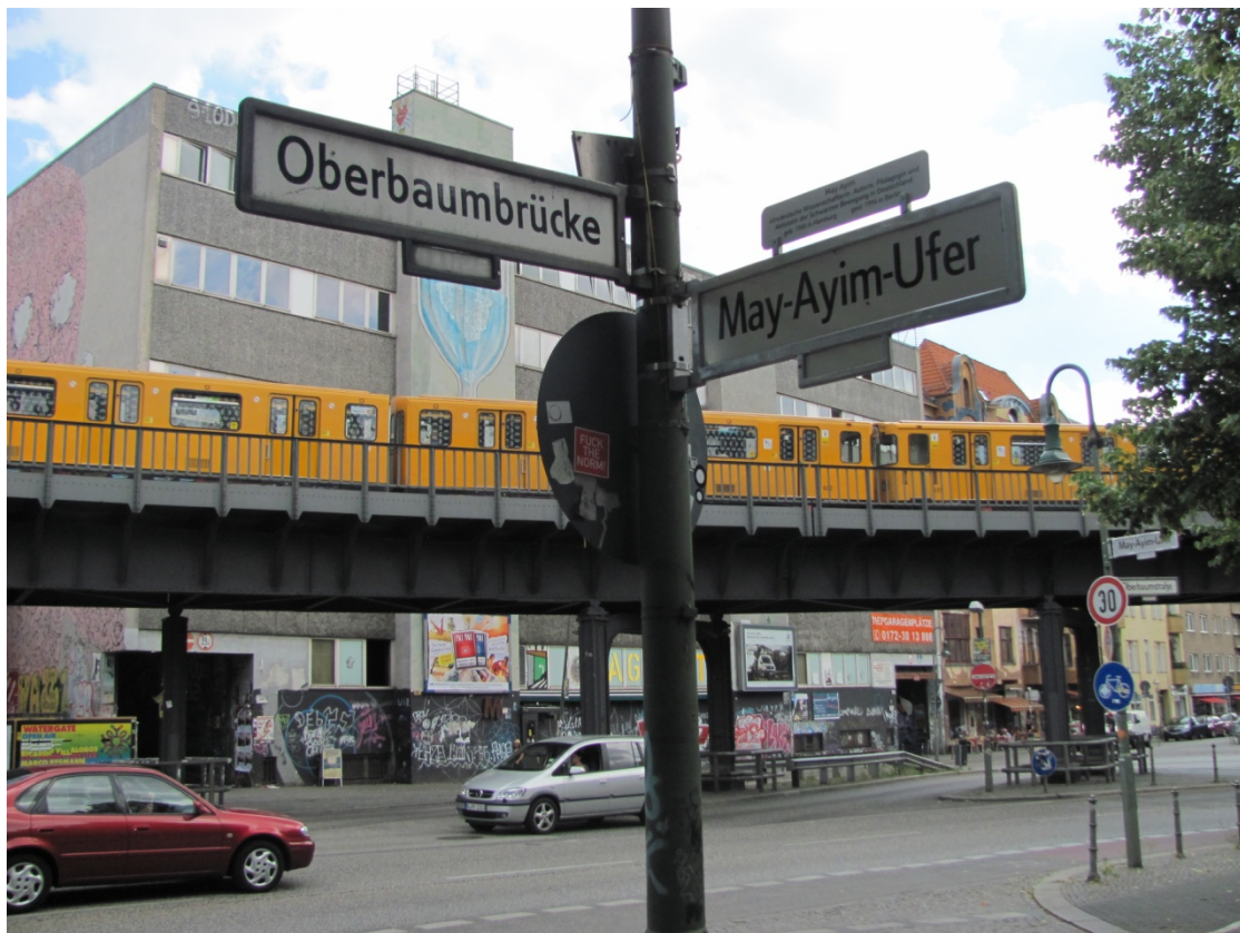
Figure 11: The New Name, Berlin (2011).

and an estimated nineteen to thirty thousand Africans were routed through it prior to their transport to Europe and the Caribbean. The riverbank's commemoration of Gröben had drawn little comment for more than a century, but in the spring of 2009 a coalition of Afro-German and other organizations successfully petitioned the district council of Friedrichshain-Kreuzberg for a name change (see fig. 11). Following the passage of a council resolution in May of that year, the riverbank and the adjacent street were rechristened the May-Ayim-Ufer, after the Afro-German activist, scholar, and poet also known as May Opitz (Kwesi Aikins and Hoppe 532–534). 14