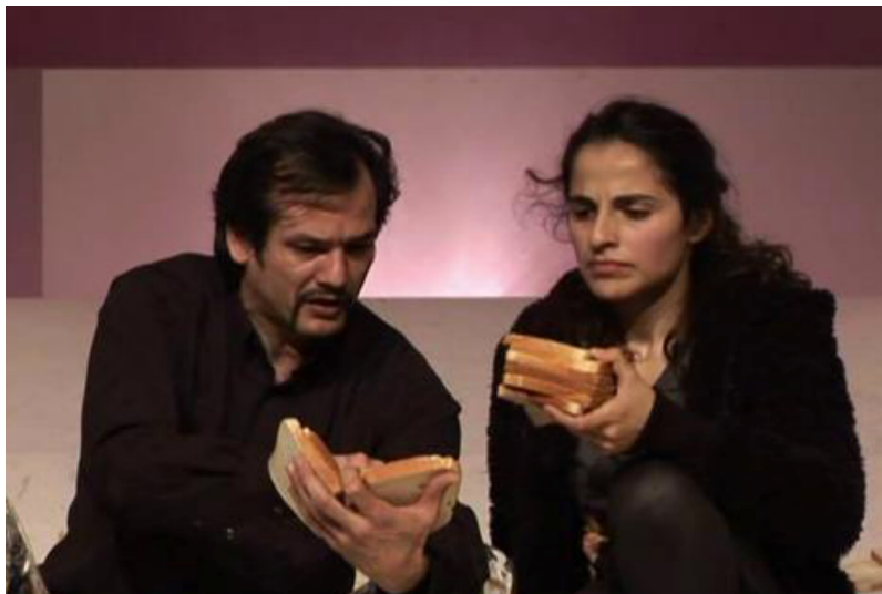
Figure 9: Video trailer from “The Swans of the Slaughterhouse,” Ballhaus Naunynstrasse, Berlin (2009). Available at http://vimeo.com/16409016

In this last case, the particular form of the recollection is more elliptical and associative than strictly documentary: the play does not merely frame the dramatic action as the haunted dreaming and reminiscence of a troubled elderly journalist, but also threads allusive references to the boys’ demise through other narratives of