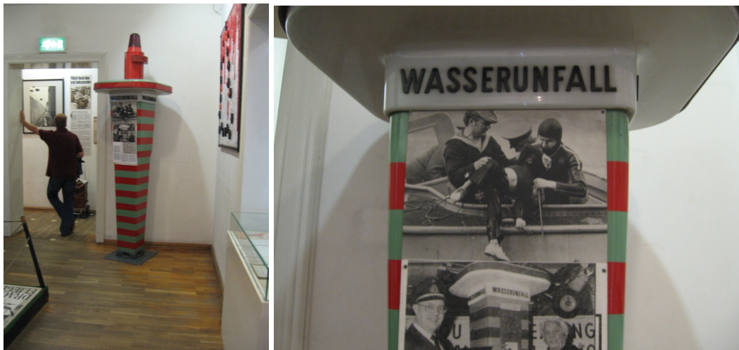
Figure 6: The Water Accident Reporter, Wall Museum at Checkpoint Charlie, Berlin (2009).

Nevertheless, one display at the Museum does refer to the situation on the Spree River. This is the so-called “water accident reporter” ( Wasserunfallmelder ), an eye-catching intercom unit with instructions in German, Turkish, and Serbo-Croatian (see fig. 6). As the accompanying text relates, twenty of these intercoms were installed