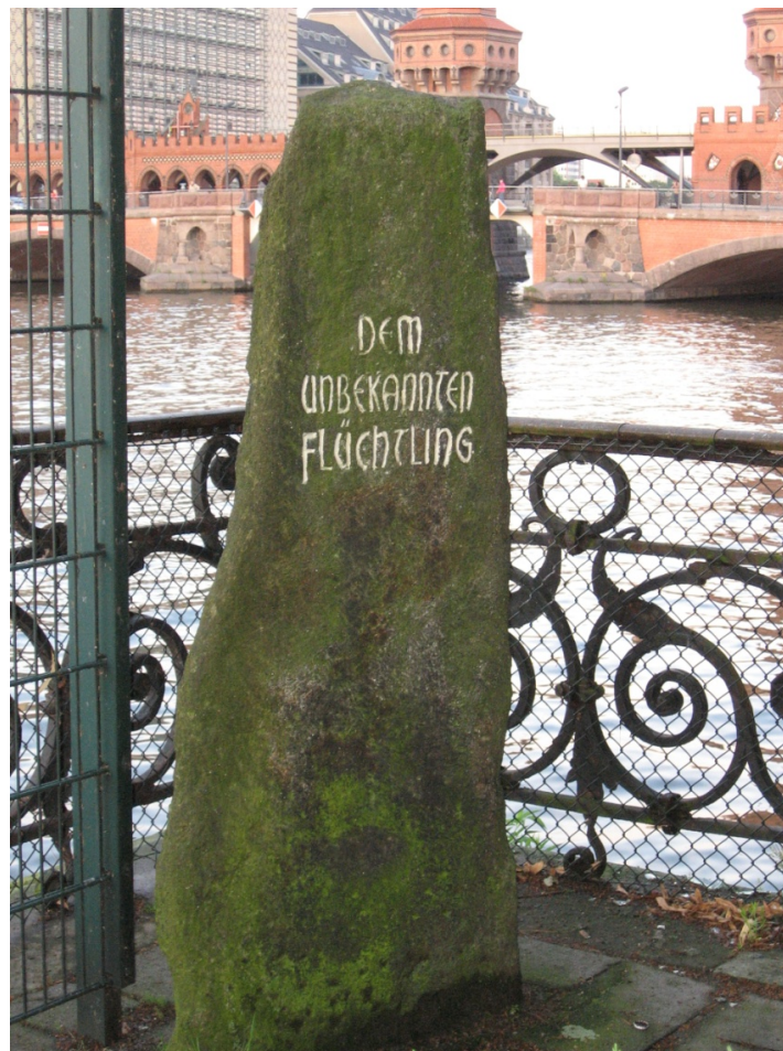
Figure 7: To the Unknown Refugee, Berlin (2007).

An analogous displacement has recently taken place on the Gröbenufer itself. When I first visited the bank in 2007, the plaque that migrants had placed on the site in May 1975 was nowhere to be found, and the only reference to the Wall was a modest stone marker dedicated “to the unknown refugee” ( dem unbekanntem Flüchtling ; see fig. 7). This marker once belonged to a larger memorial that a group of young West Berlin protesters had erected in November 1961 to commemorate the