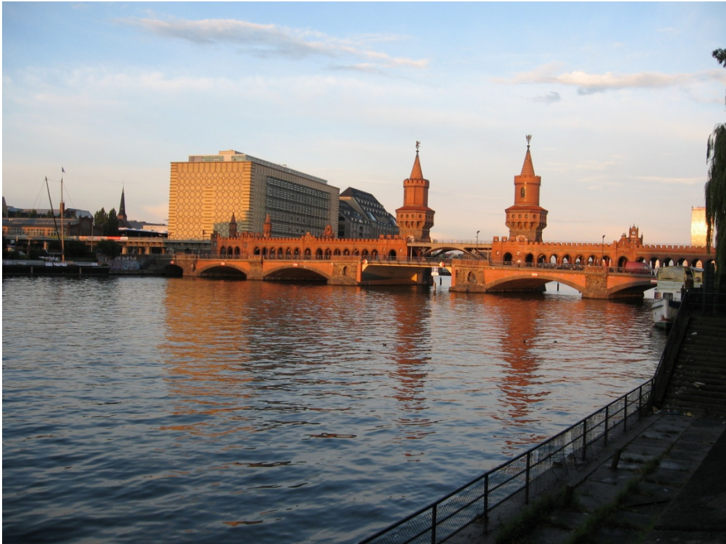
Figure 2: Gröbenufer (now May-Ayim-Ufer) and Oberbaum Bridge, Berlin (2007).

of the river but either drowned or were shot and killed by East German border soldiers. 4