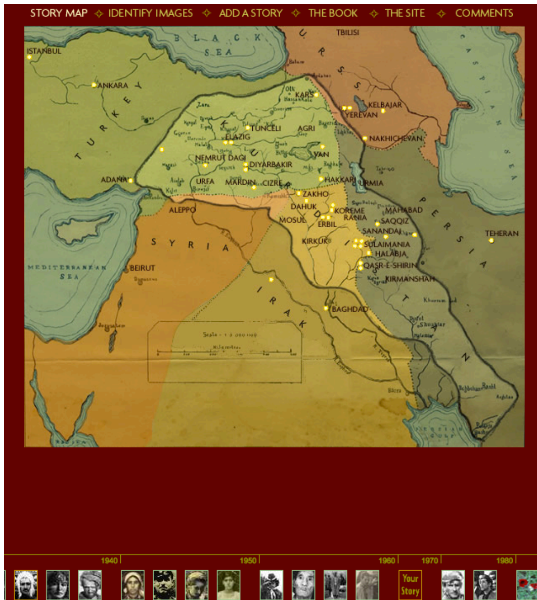
Figure 1: An interactive "story map" of Kurdistan.

The site is divided into three sections, the first of which consists of a story map in the form of a geographical map of Kurdistan, indicating where different narratives took place (fig. 1). By clicking the locations, one can read personal memories added by other visitors to the site. The second section, the unknown image archive, invites people to identify images and tell the story behind each one. People can also send their own images to find out, with others' help, more about their photographs. In the third section, people can add their own stories and memories to the site. By collecting narratives and images of the past from its audience, the website uses the method of crowdsourcing in memory work to build an archive for the displaced and nationless.