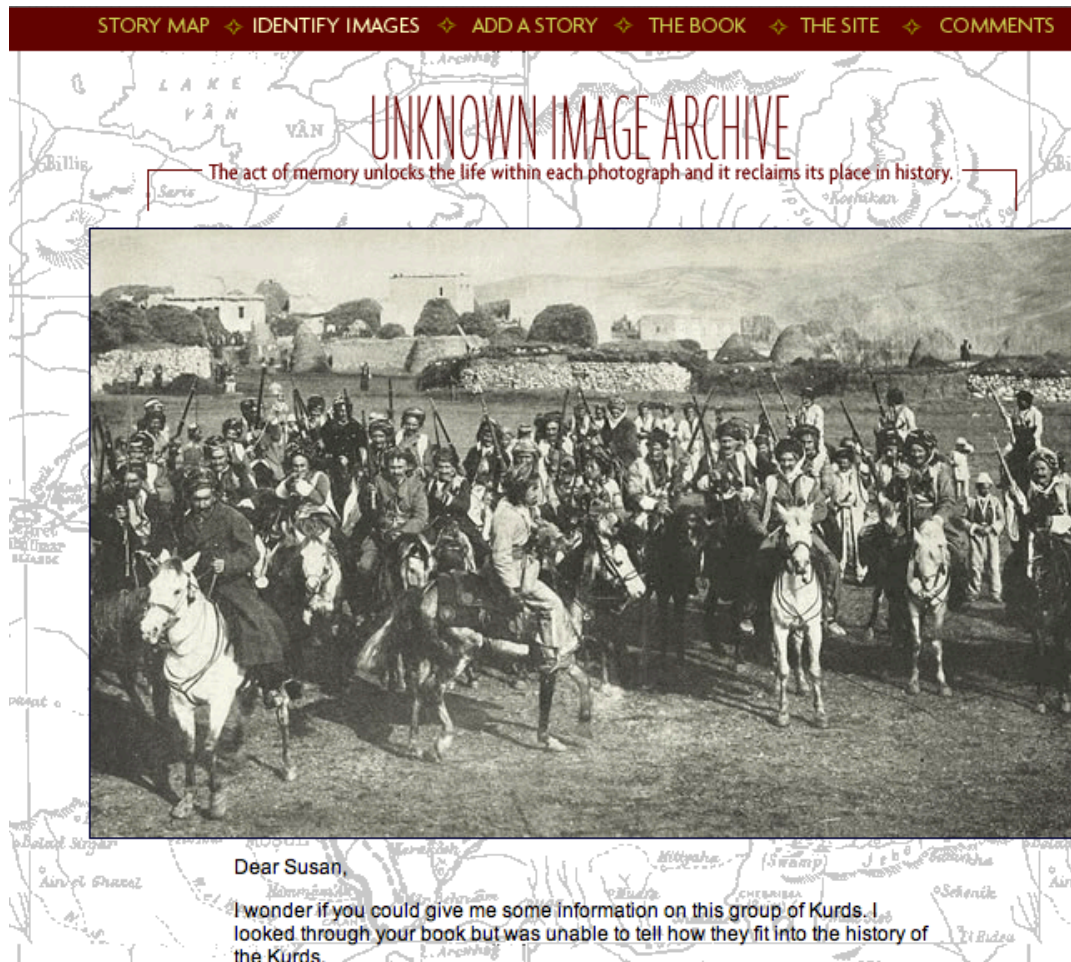
Figure 2: An unknown image to be identified.

image is actually from the Suleymania area of Iraq, around the 1920s. Still others suggest that the photograph was possibly taken by an English missionary in connection with the Tiyyare Christian uprising. Judging by the clothing the men are wearing, the scenery, and the housing, the contributors draw conclusions as to which area and historical context the image is situated in. Some contributors identify the source of the picture as originally published in The New York Times in 1915, whereas another recognizes the image as one from a book on Armenian genocide.