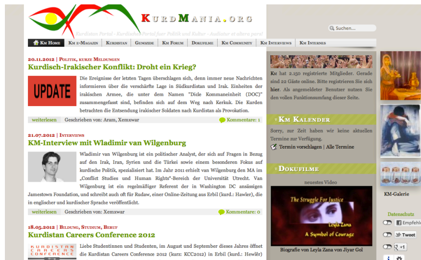
Figure 3: The colors of the Kurdish flag decorate Kurdmania.org

the Kurdish nation is reinforced through the abundance of images and texts available on the website (fig. 4). The gallery in itself offers a view into the ways in which national identity is defined and embodied through traditional cultural imagery of the past.