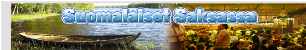
Figure 6: An appeal to Suomalaiset.de 's twofold audience—Finnish (left) and German (right).

In the sparse imagery of Suomalaiset.de , it is nature that seems to capture the essence of the nation. At the top center of the site there is a collage of two images (fig. 6): The left-hand image depicts a view of a lake during the summer. The lake, the small rowboat, and the birch trees are all symbols of Finnish cultural heritage commonly found in films, literature, popular music, and advertisements. The other image, on the right, presents what seems to be a celebration of Oktoberfest, a stereotypical and easily identified symbol of Germany. Thus the collage conveys the transnational nature of the site as both Finnish (peaceful nature) and German (cheerful traditional sociability). It is however, illustrative, that the only map on the forum is a roadmap of Germany, presumably intended to help members find their way in a new home country.