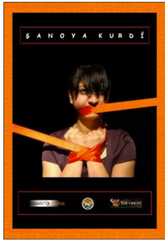
Figure 5: A symbol of the Kurdish struggle against oppression? Or, the suppression of women in Kurdish culture?

The tendency to reinforce ethnic and national identities is often connected in precarious situations with political struggles that suppose or draw upon essentialist identities. Indeed, as Sari Hanafi argues, the Internet promotes new possibilities of re-anchoring culture and identity, thereby reinforcing ethnic identity (592). However, there are various ways in which this sense of fixed identity can be challenged. First of all, not all of the images on Kurdmania.org follow this sense of tradition and particular nostalgic imagery of the past. Amongst the traditional images, there is a contemporary photograph, most likely from a theatre production, of a young woman whose hands and mouth are tied with a red ribbon to convey her role as a victim or prisoner (fig. 5).