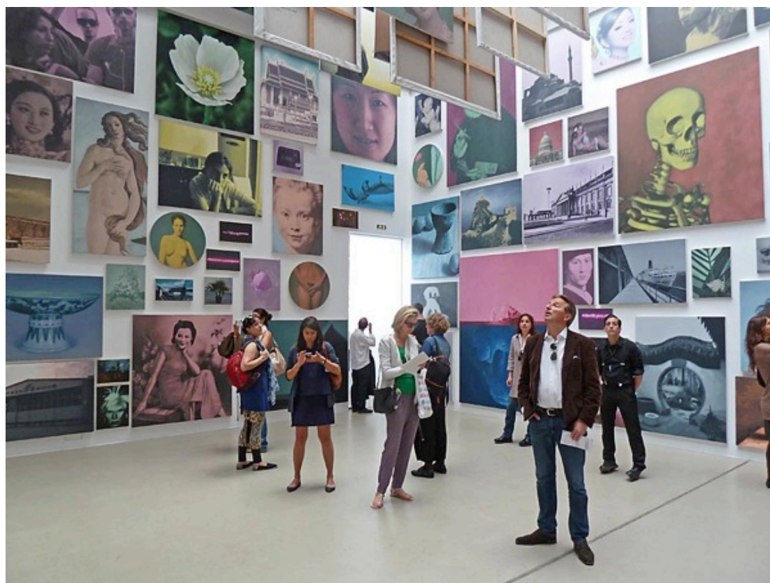
Figure 2: Yan Lei's Limited Art Project, 2010–2011 , Photo: Hartwig Bambeay.

The first artwork mentioned in the Tagesthemen broadcast and the exhibit to which it devoted most of its dOCUMENTA (13) coverage was Yan Lei's installation Limited Art Project, 2010–2011 (see figure 2).