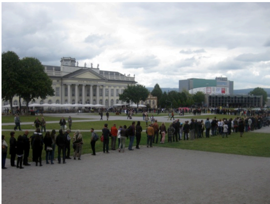
Figure 24: Waiting in line to see dOCUMENTA (13) , Photo: Christos-Nikolas Vittoratos.

It is this newly emerging relationship between a spectacle and its audience that Christov-Bakargiev took into account in the attempt to make dOCUMENTA (13) stand out from other now-ubiquitous biennials and festivals displaying artists’ positions and representing public issues. Although this may seem to be a radical change, returning to Guy Debord’s Society of the Spectacle makes it appear to be merely one more rotation of a spiral: “The spectacle is not a collection of images, but a social relation among people, mediated by images” (4). Carolyn Christov-Bakargiev was aware of the social practice of the “new individual” and of the art of re-mediation and was thus able to arrange the spectacle of dOCUMENTA (13) as an anti-spectacle. The necessity for a continued political fight for equality and participation has not become obsolete, but this documenta seemed to allow for a temporary, perhaps heuristic, leave. Ultimately, dOCUMENTA (13) was a staged vision heralding the end of diversity politics and the beginning of diversity.