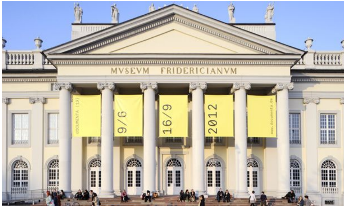
Figure 3: The Fridericianum in Kassel in June 2012, Photo: Nils Klingner.

During my research for this essay, I glimpsed a photo documenting the opening of dOCUMENTA (13) with yellow banners between the pillars of the Fridericianum (see figure 3). Yet when I attended the show a few days later, these banners had been removed. 3 Even though there were huge billboards advertising the event in Berlin and a yellow engine moving on the tracks of the Deutsche Bahn, one of dOCUMENTA (13) 's sponsors, within the town of Kassel promotional signifiers were at a minimum with small yellow signs only being used where guidance or reference was absolutely necessary. This abstinence may be read as a first sign of director Christov-Bakargiev's intent to make the event less of a spectacle.