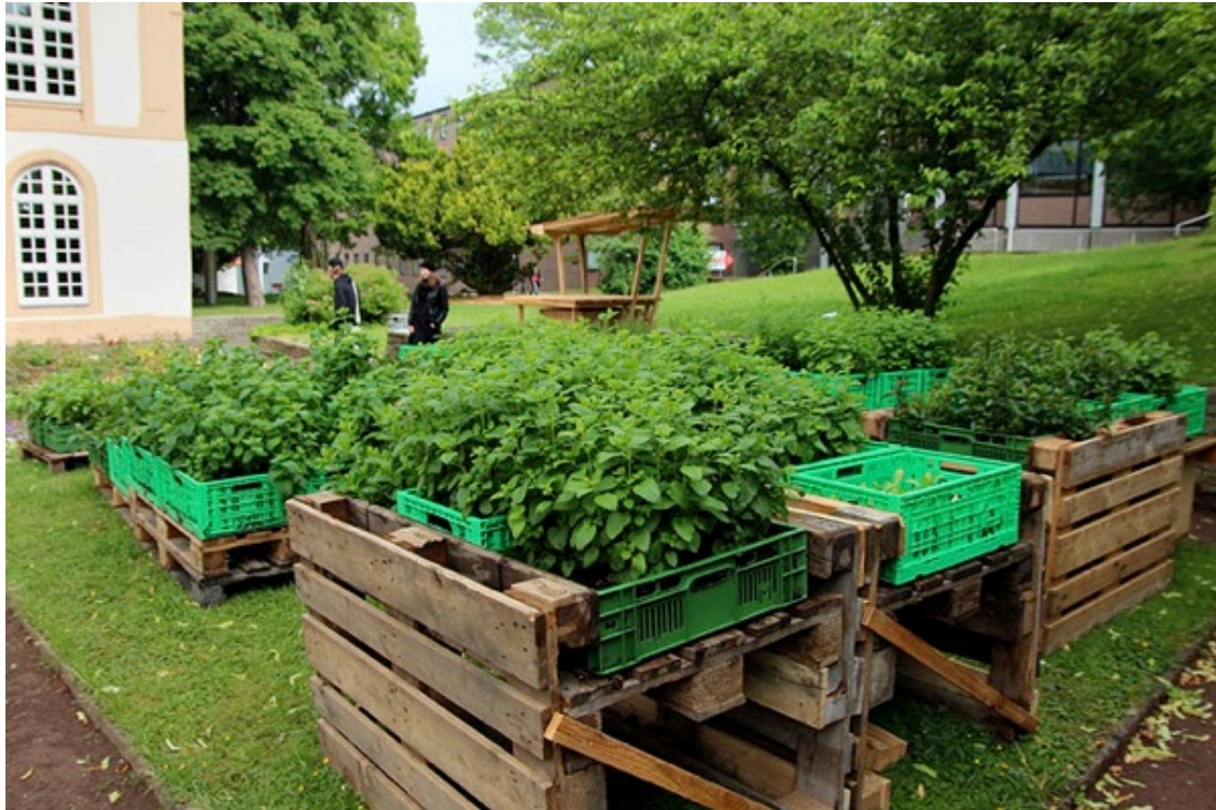
Figure 9: Artist Collective AND...AND...AND...’s The Tea Garden in front of the Ottoneum

Before we enter the Fridericianum, I would like to take you around providing several more examples of the laconic casualness characteristic of this documenta's curatorial practices. In front of the Ottoneum, neighboring the Fridericianum and the Documenta Hall, visitors could see wooden pallets and plastic boxes. This Tea Garden was part of the project "Commoning in Kassel," an initiative of students at Kassel University's Landscaping and Agriculture Departments and the artist group AND...AND...AND... (see figure 9). Intended simply as a place for social encounters among visitors, The Tea Garden was not made with any considerable technical or aesthetic considerations, and it resembled any other urban horticulture project of container farming (See Ristau).