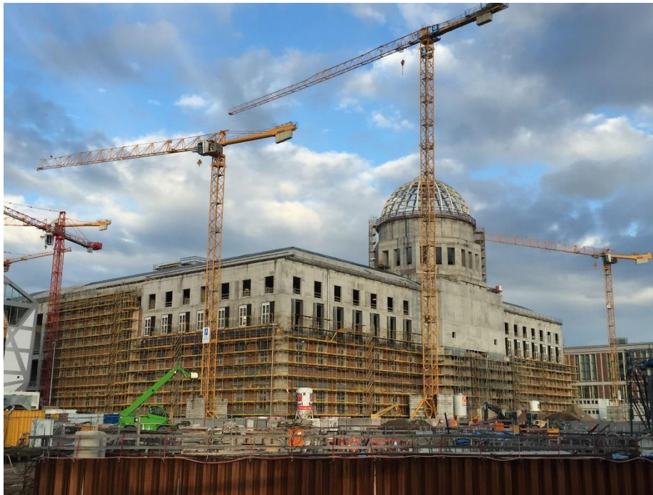
Fig. 1 Reconstruction of the Berlin City Palace/ Humboldt Forum (April 2016).

Berlin City Palace, now called the Humboldtforum , rose to obscure the cathedral behind it, like a revenant feasting on the bodies of the living architecture around it.