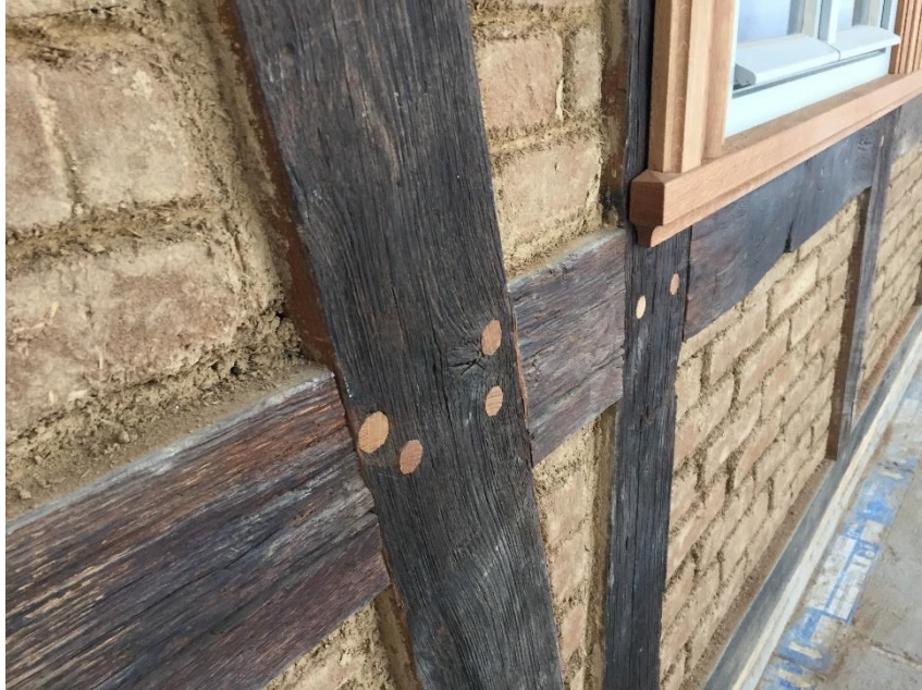
Fig. 3 Half-timber construction on the "Hof zum Rebstock" in the Dom/Römer reconstruction project in Frankfurt am Main (2016).