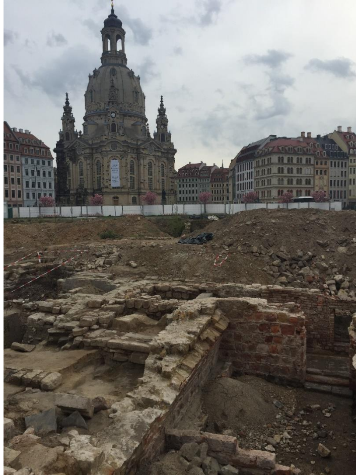
Fig. 2 Frauenkirche in Dresden with archeological excavation in the foreground (April 2016).

scenes of huge, uneven blocks of rubble being perfectly fitted into computer-generated and laser-straightened new church walls, and the ethical question of “dürfen” (are we allowed to rebuild?) turned into a technological discussion of “können” (are we capable of rebuilding?) (McFarland and Guthrie 227-229).