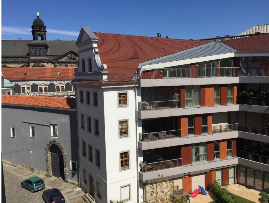
Fig. 4 Hybrid historical reconstruction / new construction near the Neumarkt square in Dresden (April 2016).

Reduzierung eines Ort . . . auf ein Bild schafft eine merkwürdige Distanz zwischen der Stadt . . . und dem Reisenden, der sie besucht und der an einem Ort, so wie er wirklich ist, oder war, nie ankommen wird. (91)