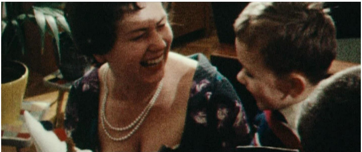
Figs. 5–6 Christmas as the ultimate promise of migration and capitalism.