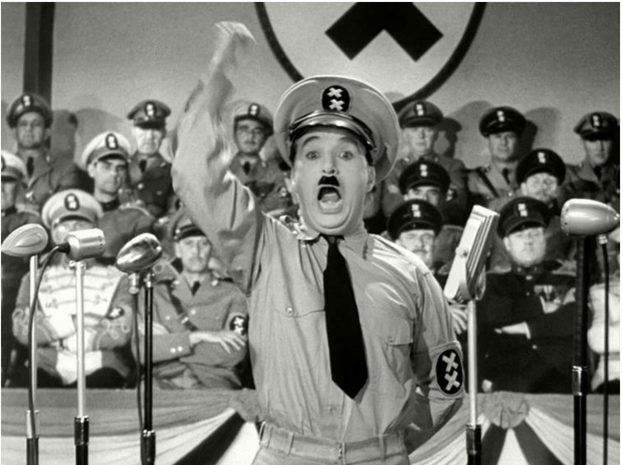
Figs. 3-4 Using comedy for creating a sense of historicity.

The gibberish speech completes the modal transition, which the film carries out parallel to the change of setting from Turkey to Germany: from the melodramatic mode characterizing Hüseyin's departure to the mode of comedy. With this transition, the mode of affectively involving the audience also transitions: instead of the heavy legato—the