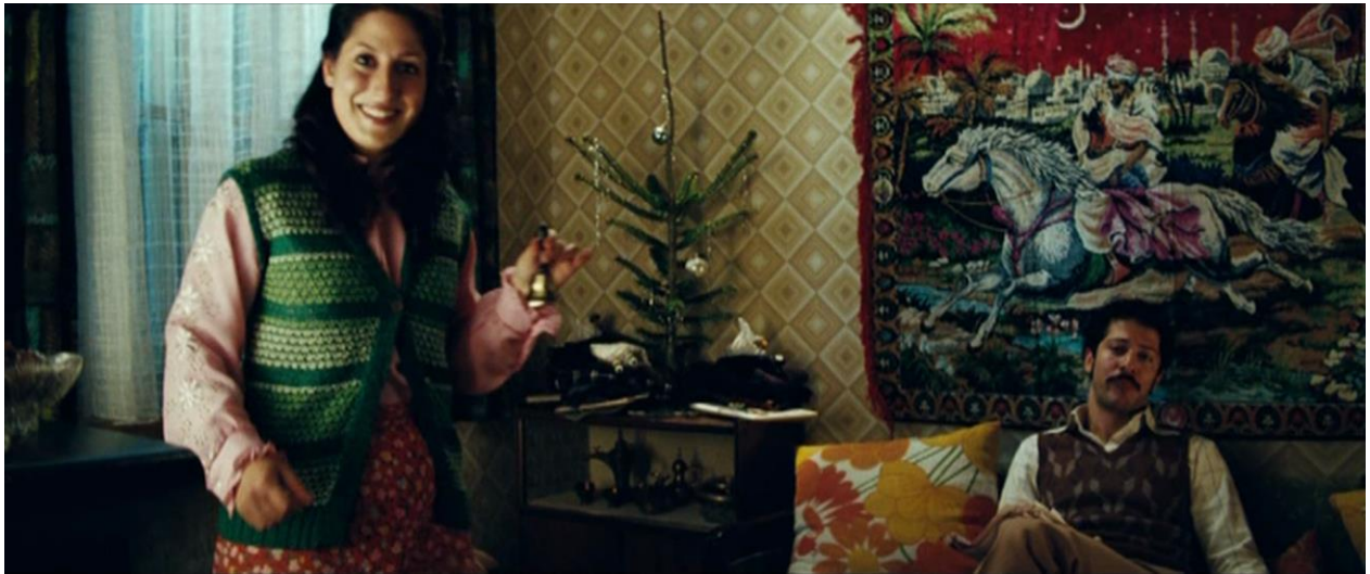
Fig. 7 Christmas as the ultimate disappointment.

The seamlessly integrated rhythm of movements becomes stuck at the exact moment when the protagonist family attempts to transpose this fantasy onto their circumstances. The children beg for their “first Christmas,” and the mother gives in. Significantly, the rhythm is broken by her revealing the presents too early—a pointed violation of the ideal dramaturgy of expectation which Christmas is built on. This ideal dramaturgy is then completely ruined when instead of an impressive tree, the mother reveals a puny little sapling (Fig. 7), a reveal resulting in the pronounced sagging of smiles.