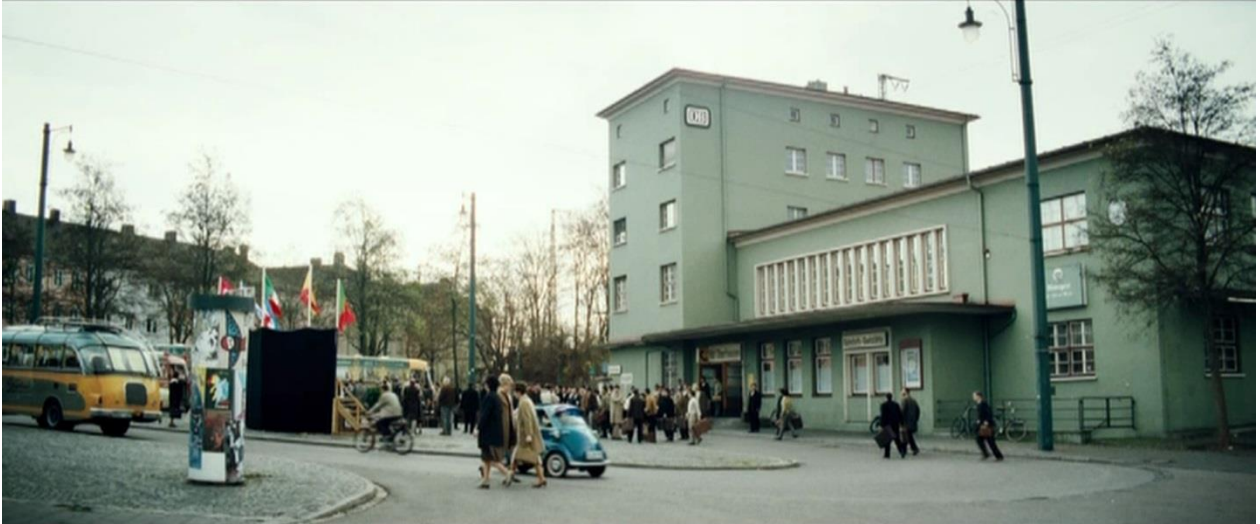
Fig. 2 Arrival as the undercutting of expectations.

jaunty clarinet melody. The symmetric composition at the beginning of the scene is replaced by a cluttering of perspectives depicting the train station and its forecourt as a typical German whistle stop in the 1960s—maybe the most banal reveal possible after the tunnel walk had suggested a kind of liminal phase leading up to a great revelation (Fig. 2).