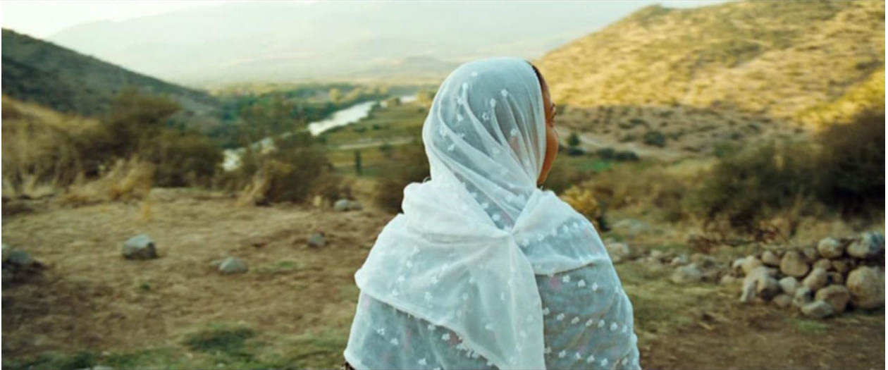
Figs. 8–10 Arriving as the overwhelming of expectations.

The sight gag is here transformed from a form of comedy into one of melodrama, and consequently changes its function within the film’s poetics of affect: It is now charged with the whole weight of lived history and lived disappointments accumulated over the course of the film’s permanent alternation between present and past.